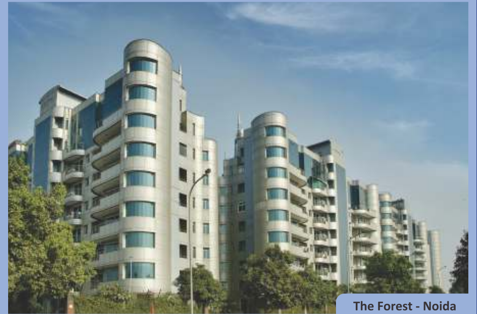
The Forest - Noida