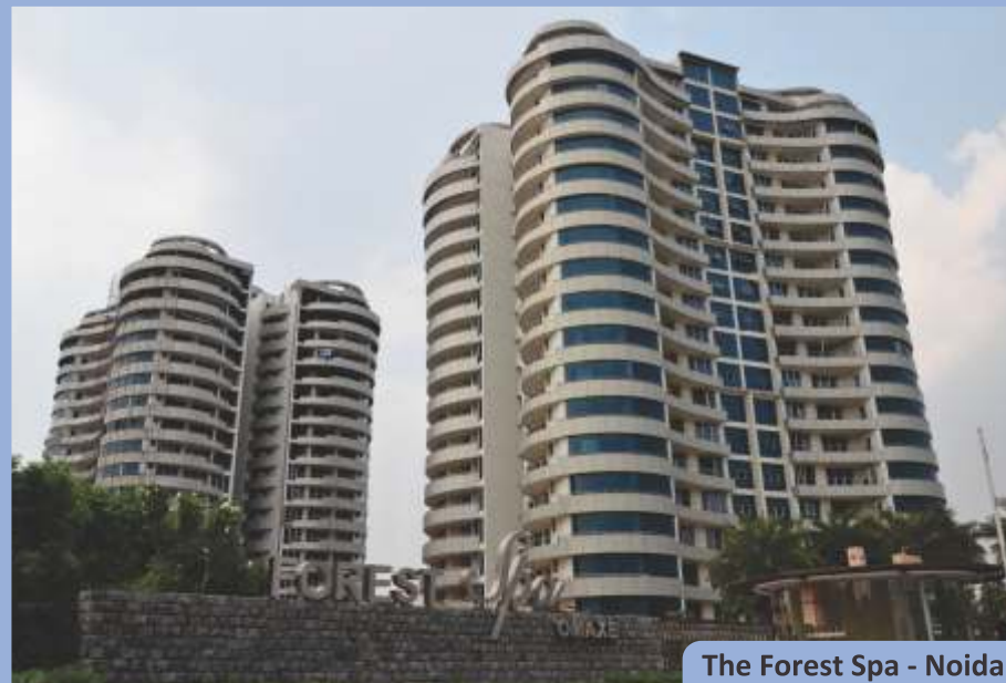
The Forest Spa - Noida