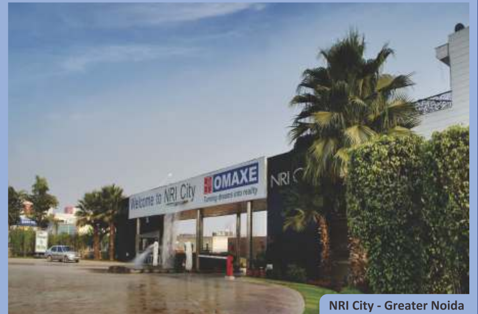
NRI City - Greater Noida