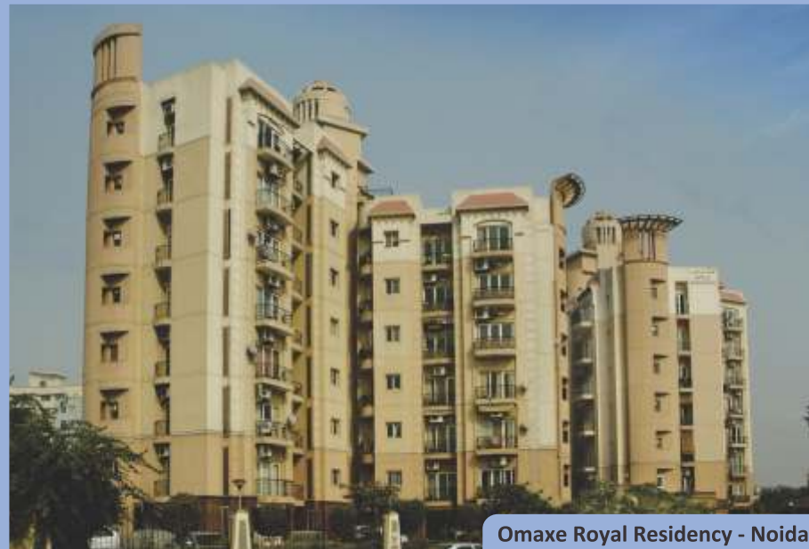
Omaxe Royal Residency - Noida