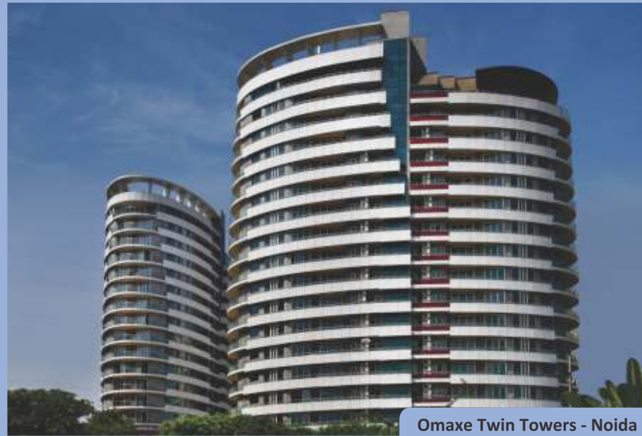
Omaxe Twin Towers - Noida