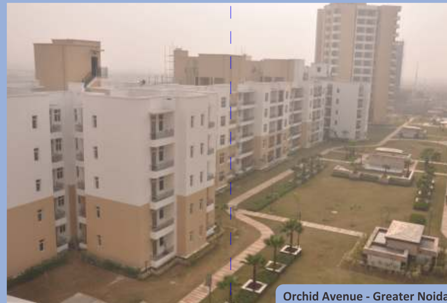
Orchid Avenue - Greater Noida