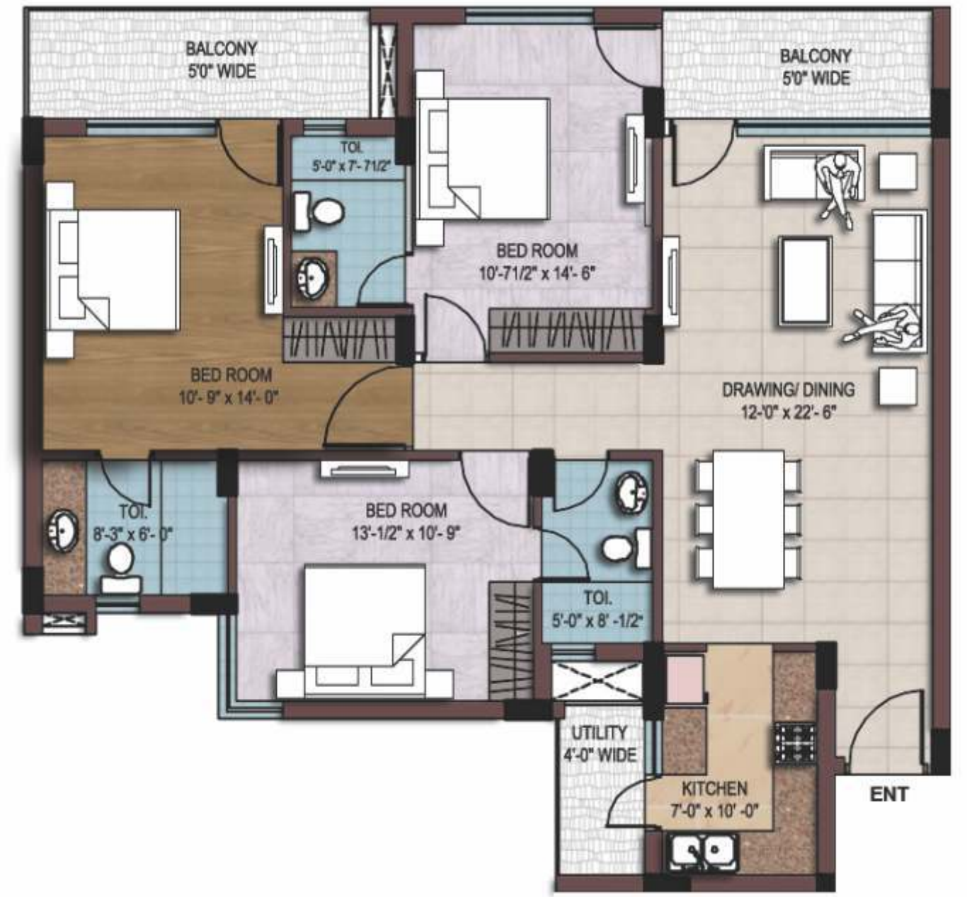
3 BED ROOM UNIT TOTAL UNIT AREA = 1675 Sq.Ft.