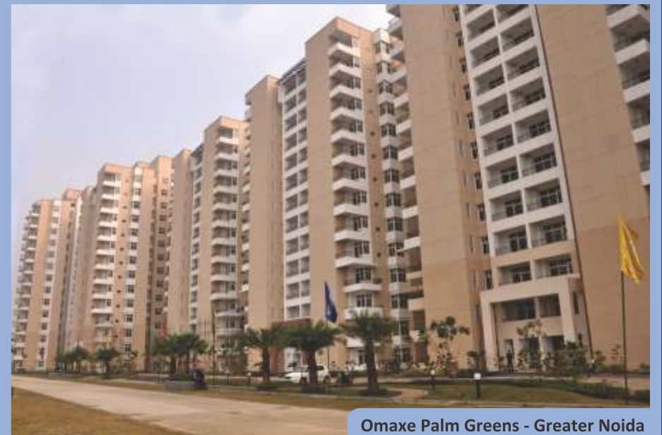
Omaxe Palm Greens - Greater Noida