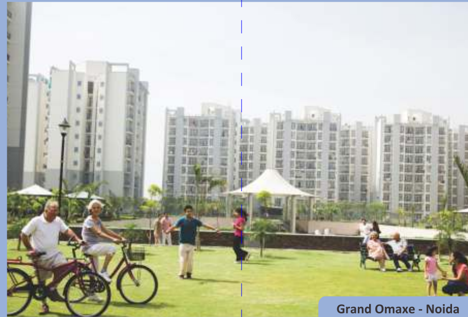
Grand Omaxe - Noida