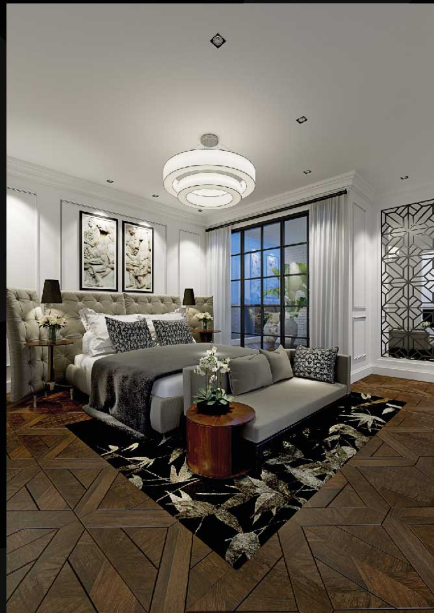
LIMITED EDITION APARTMENTS WITH PRIVATE GARDENS