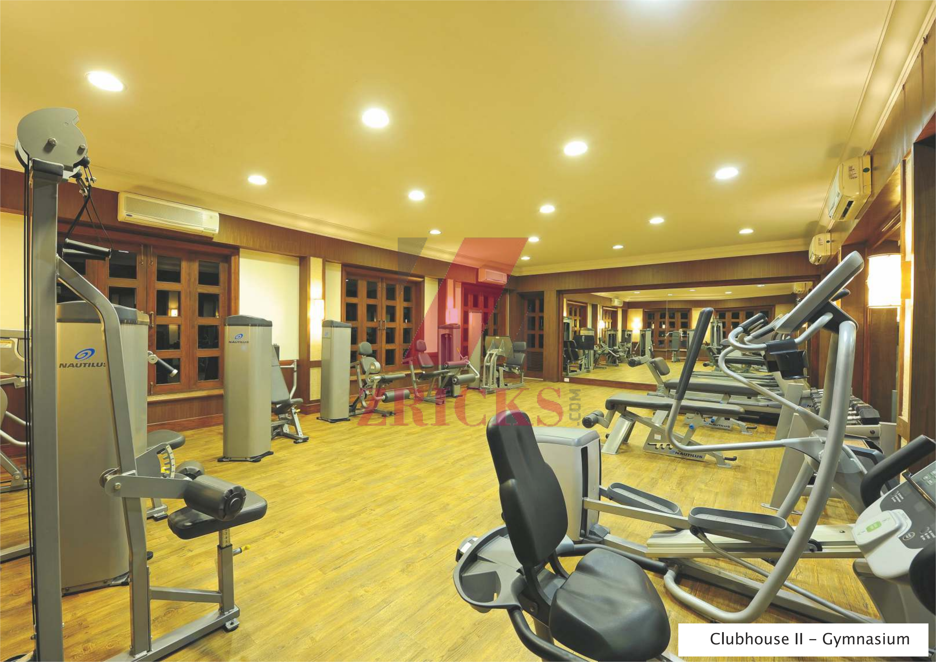
Clubhouse II – Gymnasium