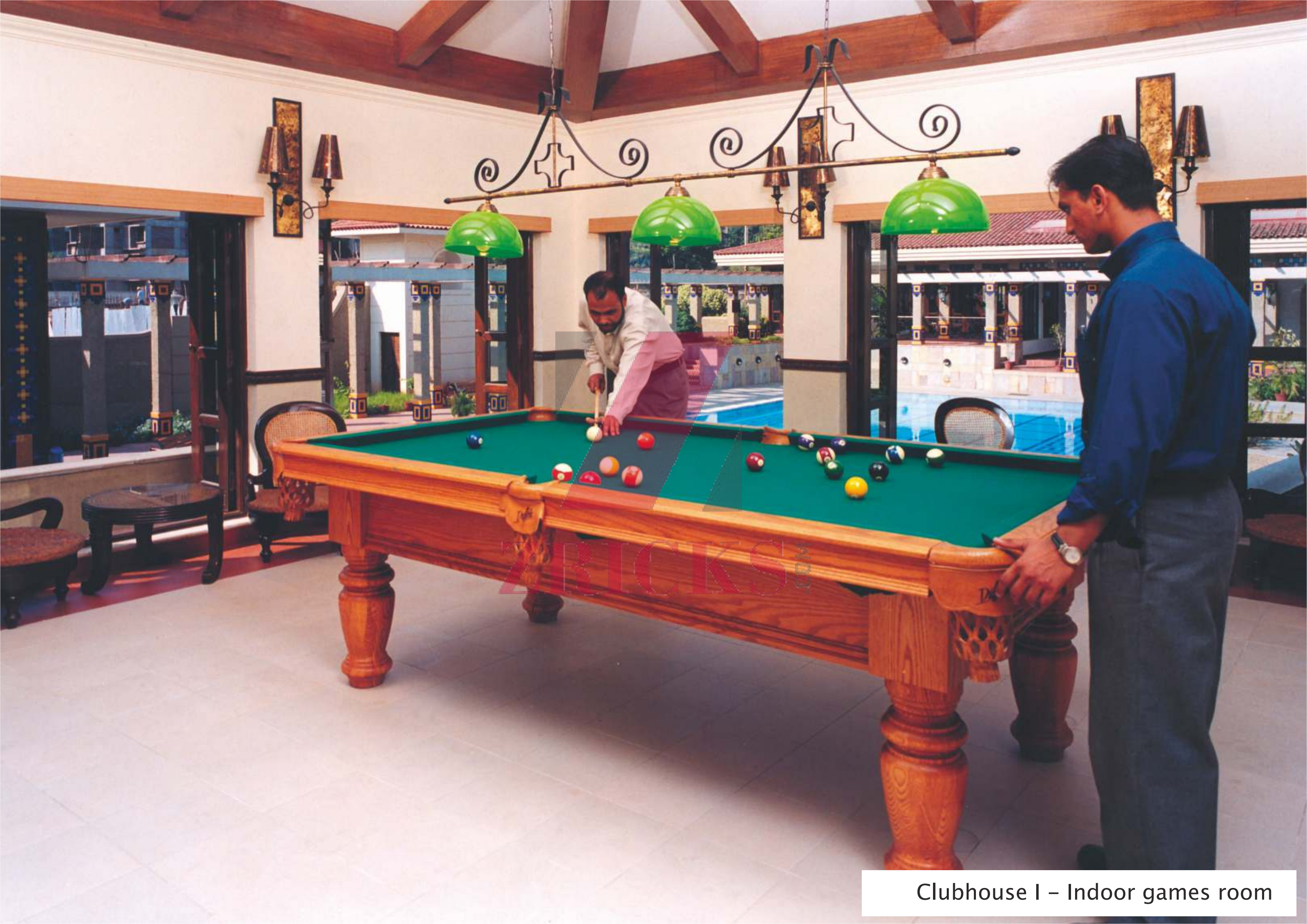
Clubhouse I – Indoor games room