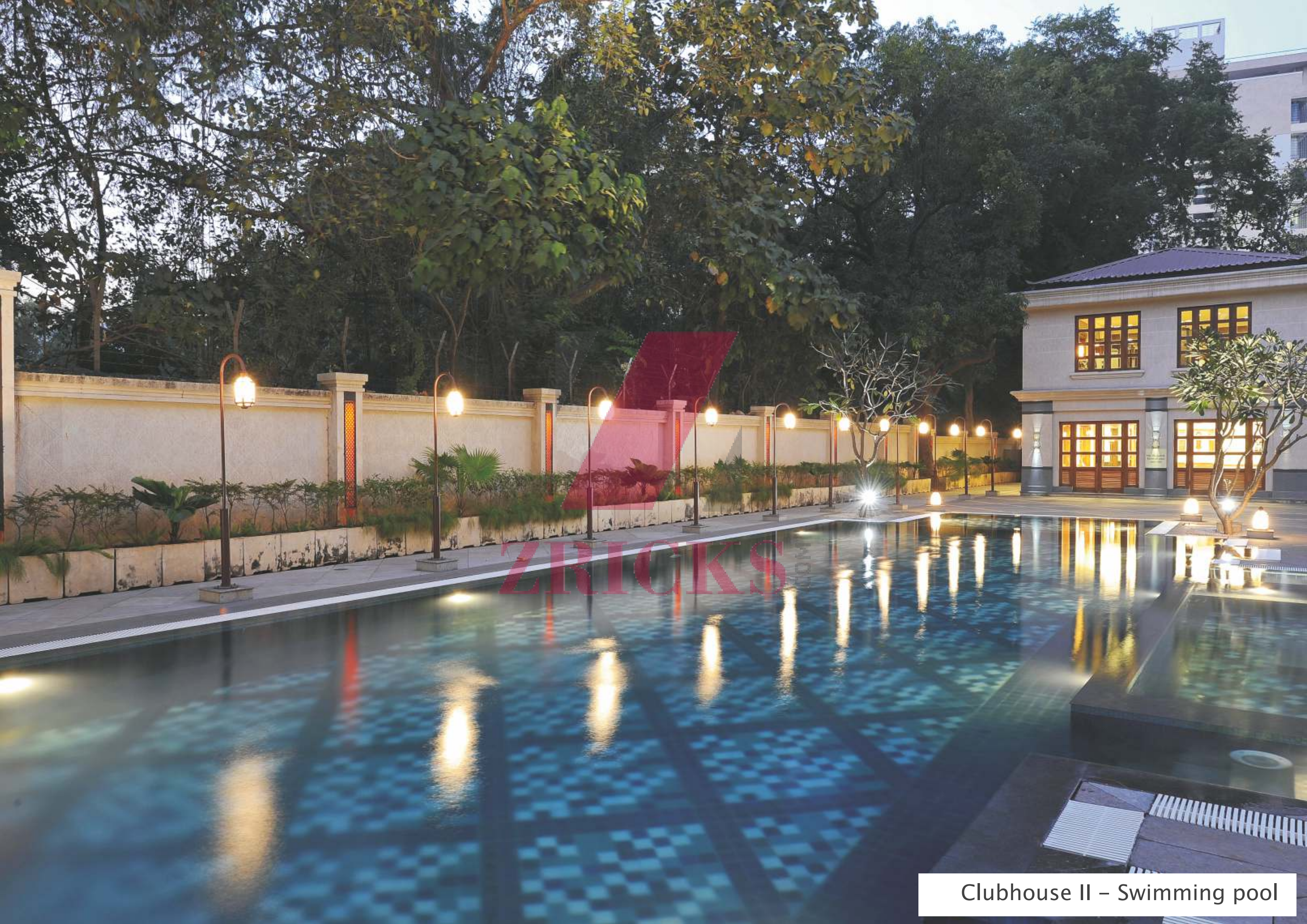
Clubhouse II – Swimming pool