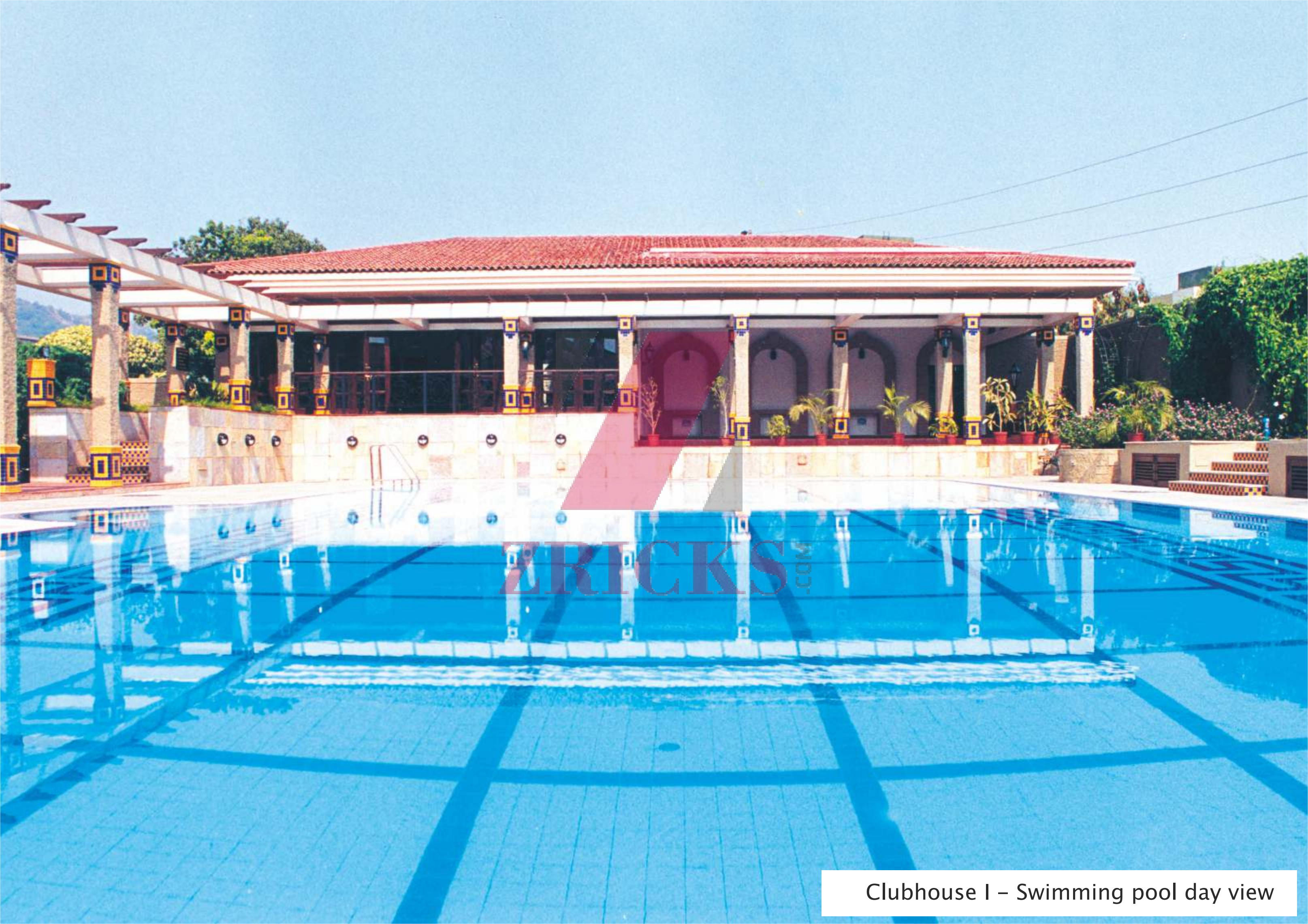
Clubhouse I – Swimming pool day view