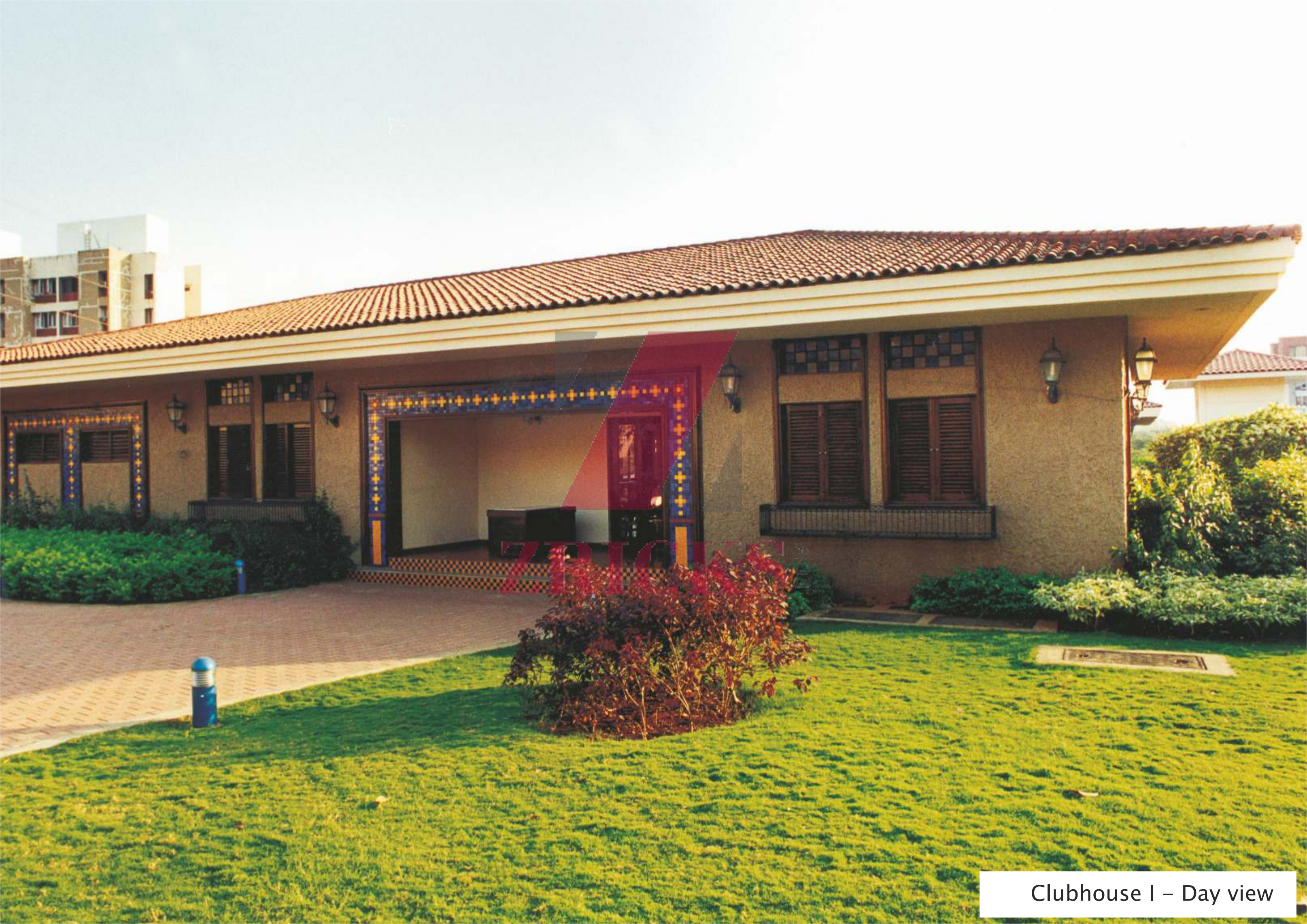
Clubhouse I – Day view