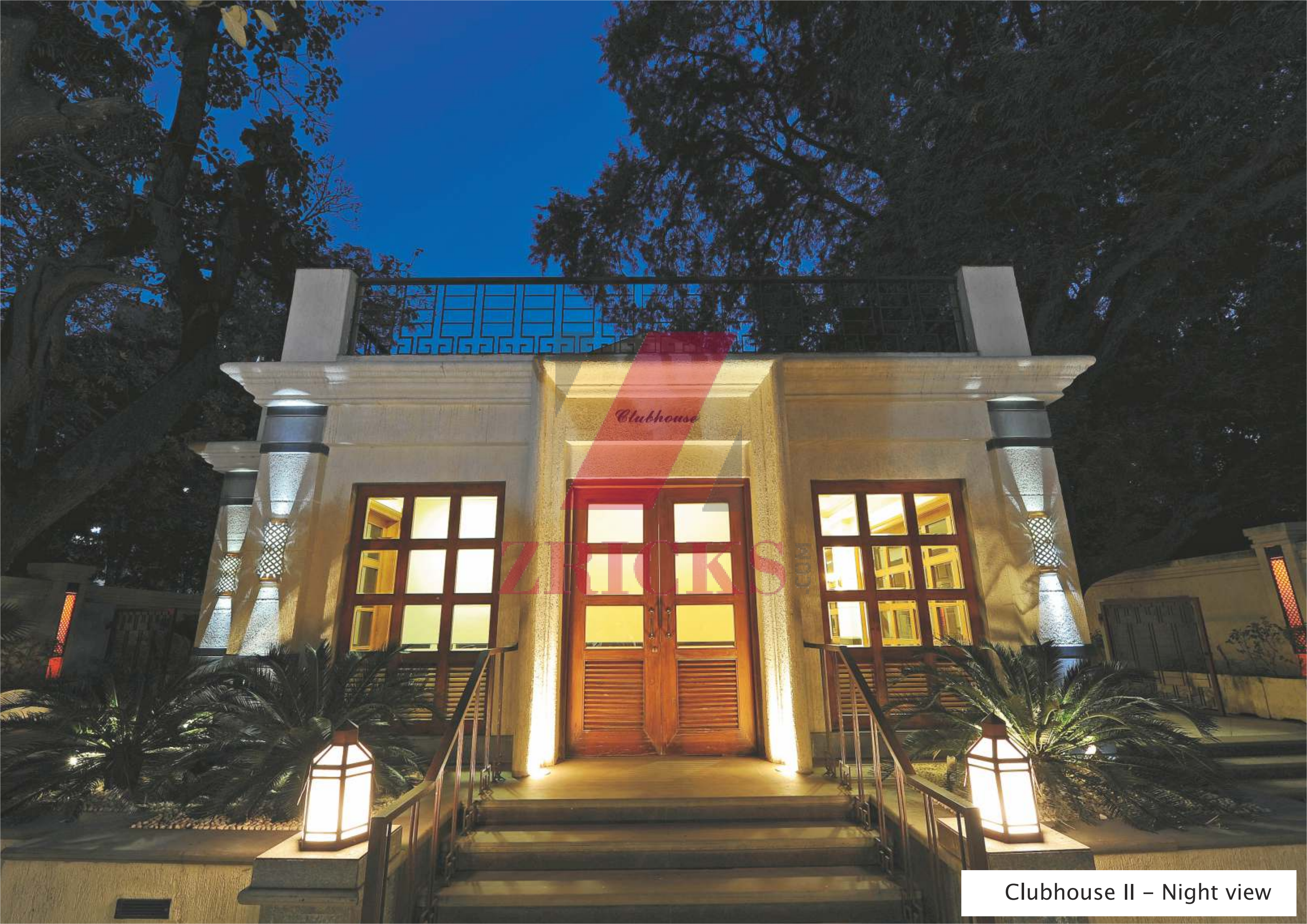
Clubhouse II – Night view