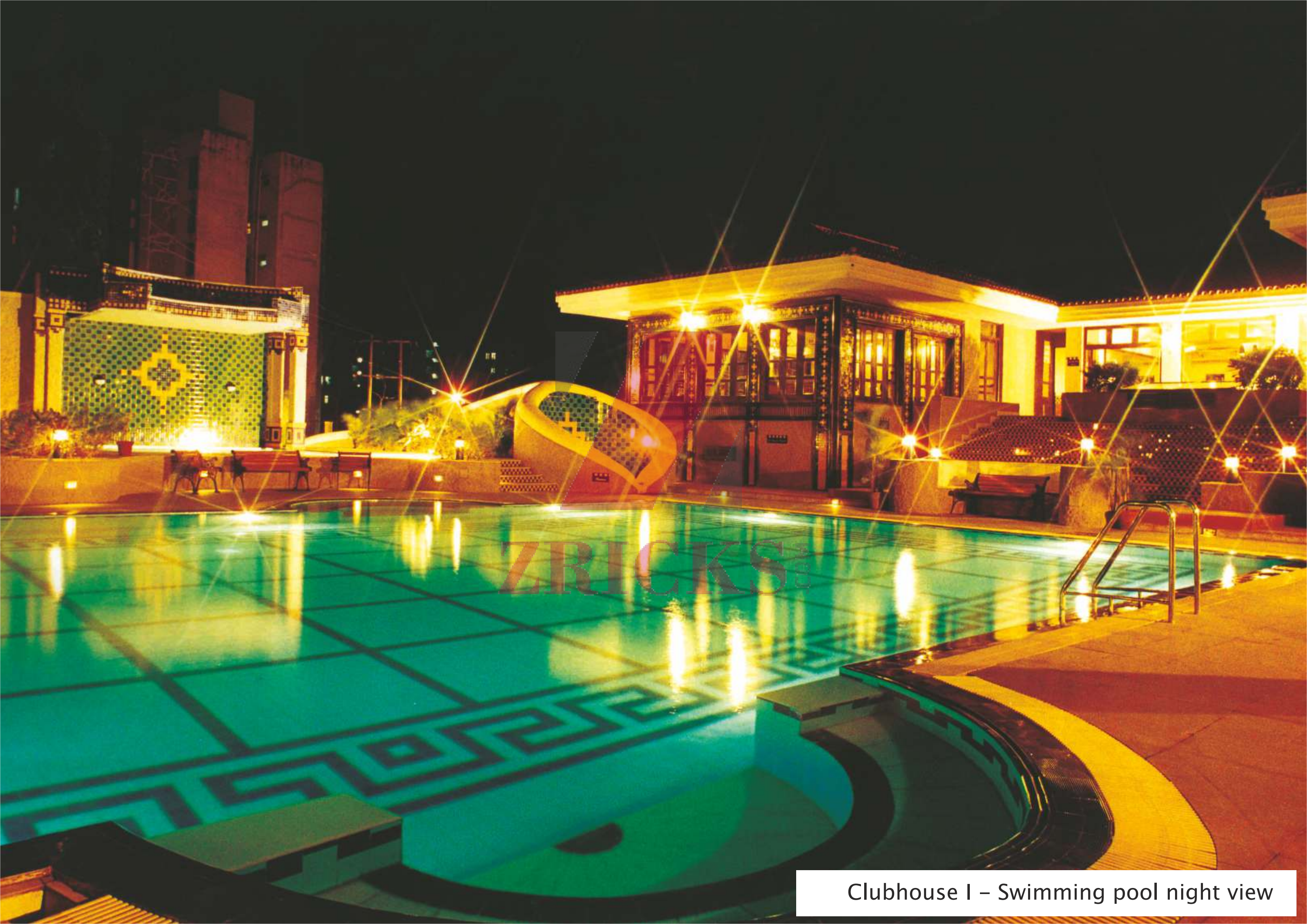
Clubhouse I – Swimming pool night view