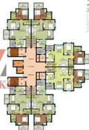
Fig. 01 - 1 (CONTINUED) of 01