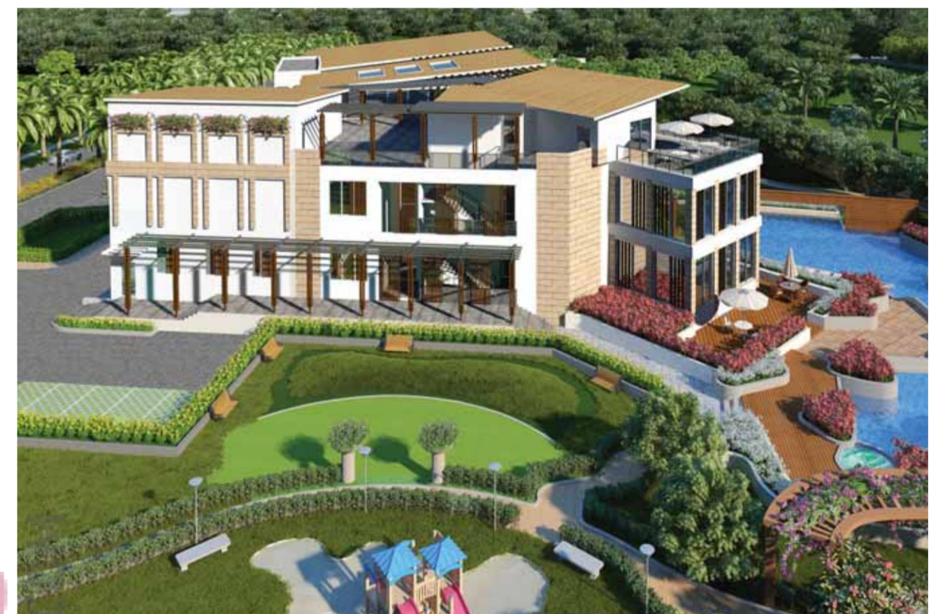
Children's play area