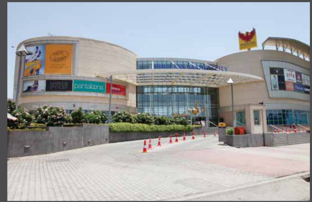
Phoenix MarketCity, Pune (1.15 million sq ft)