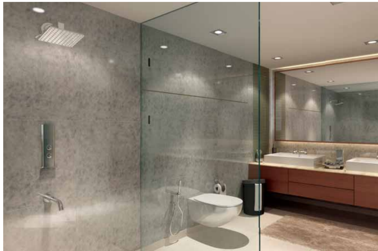
Bathroom for master bedroom