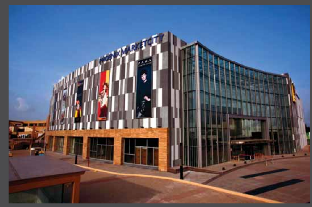
Phoenix MarketCity, Bangalore (1 million sq ft)