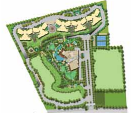
Master Key Plan