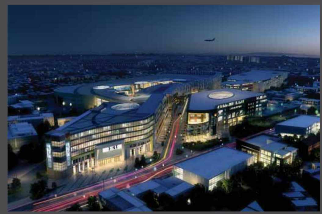
Phoenix MarketCity, Kurla (2.1 million sq ft)