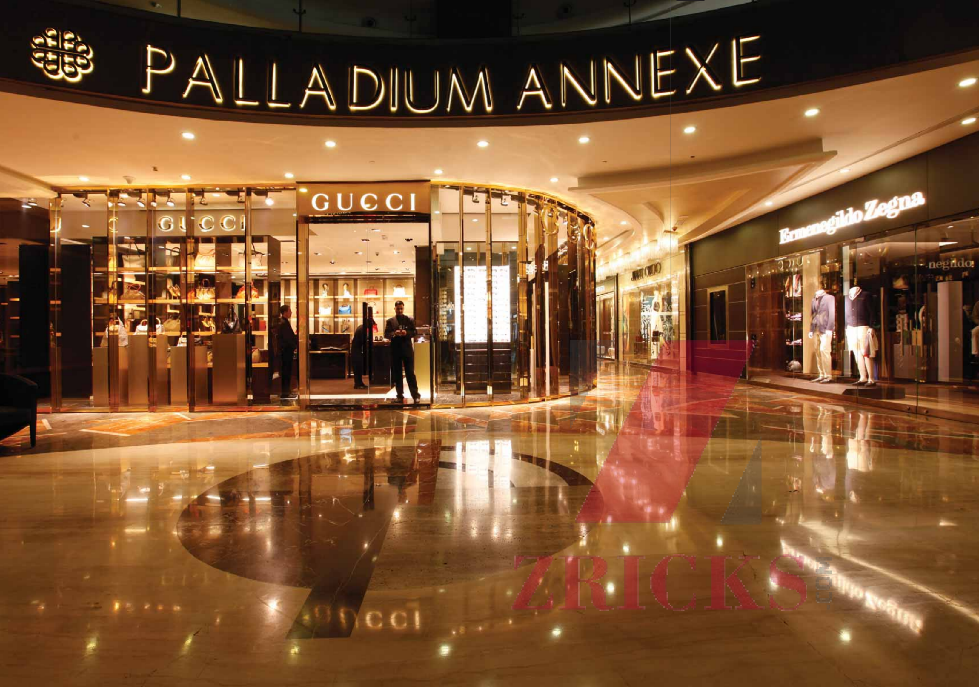
Palladium, Mumbai (.31 million sq ft)