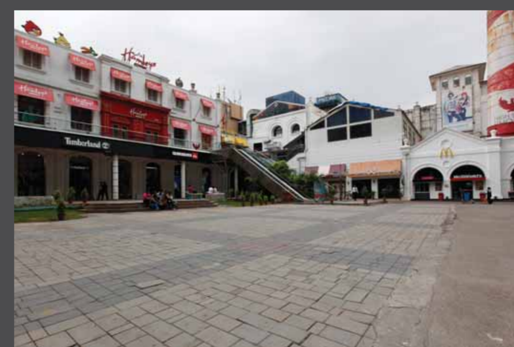
High Street Phoenix, Mumbai (1.5 million sq ft)

Upcoming endeavours by Phoenix Mills include the Shangri-La Hotel in Mumbai, MarketCity in Chennai and The Crest, luxury residences incorporated into MarketCity's vast premises in Velachery, Chennai. Having raised the standard for shopping and entertainment hubs across the nation, the Phoenix Mills legacy of excellence now makes its foray into Bangalore's residential realm with One Bangalore West .