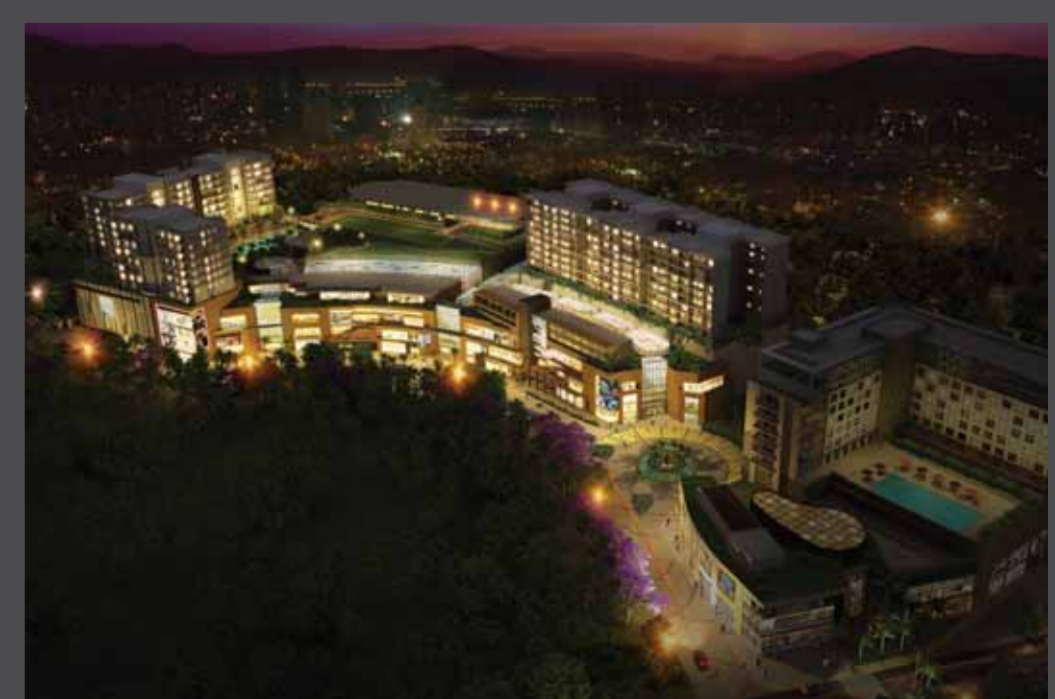
Phoenix MarketCity, Chennai (1 million sq ft)