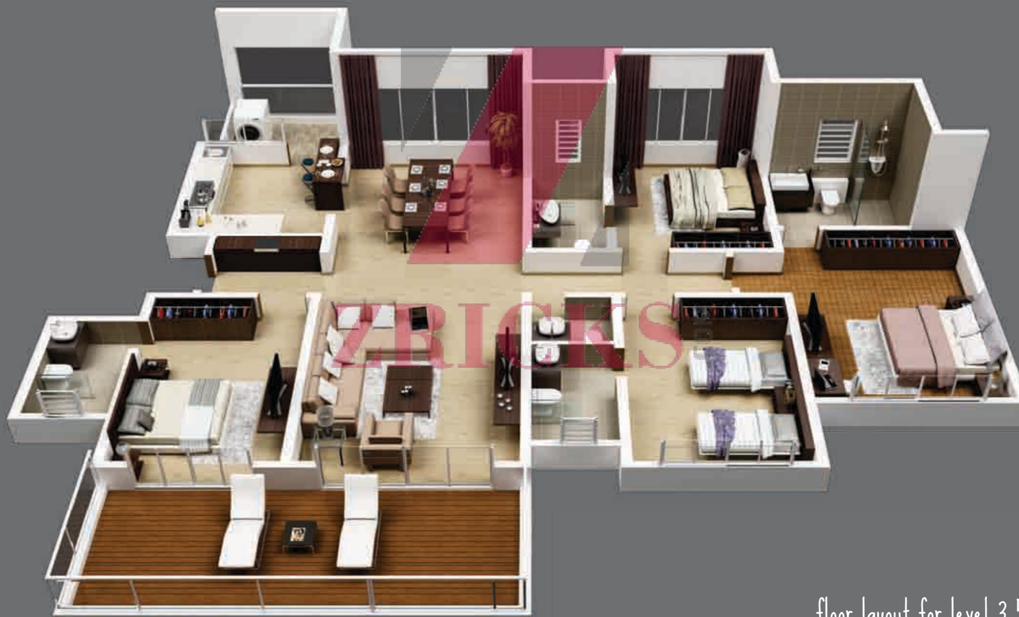
floor layout for level 3,5,9,13

this brochure is not a legal offering, it is an artistic conceptualisation, the developers reserve all rights to cancel or change the said amenities, the proposed buildings are a part of a larger layout, the developers reserve all rights to alter the position of the buildings proposed in the future, the developers reserve all rights to amalgamate the said layout with adjoining layouts or to subdivide the said layout into various plots.