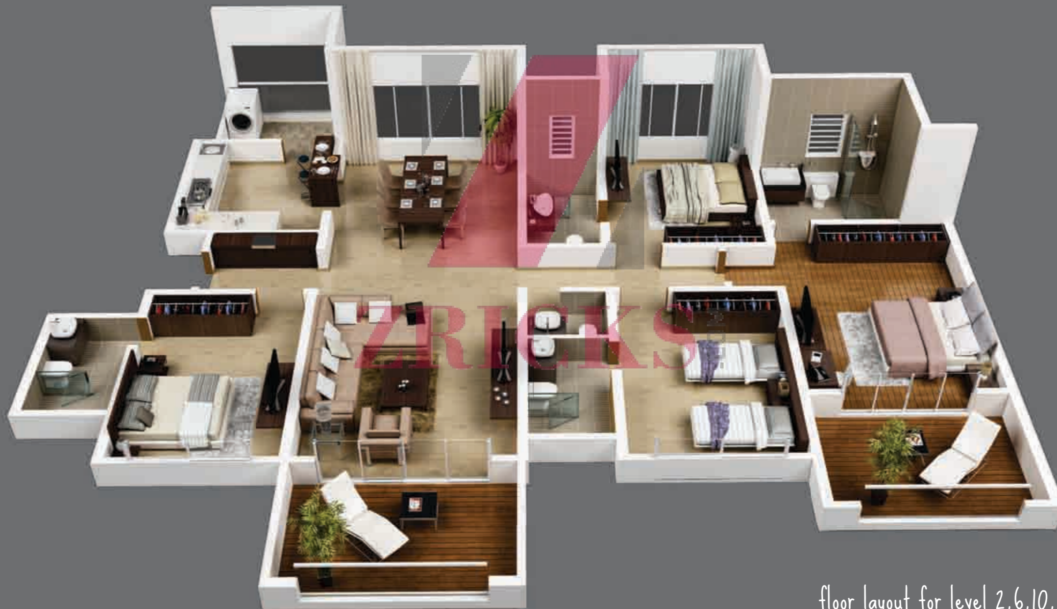
floor layout for level 2,6,10,14

this brochure is not a legal offering. it is an artistic conceptualisation. the developers reserve all rights to cancel or change the said amenities. the proposed buildings are a part of a larger layout, the developers reserve all rights to alter the position of the buildings proposed in the future. the developers reserve all rights to amalgamate the said layout with adjoining layouts or to subdivide the said layout into various plots.