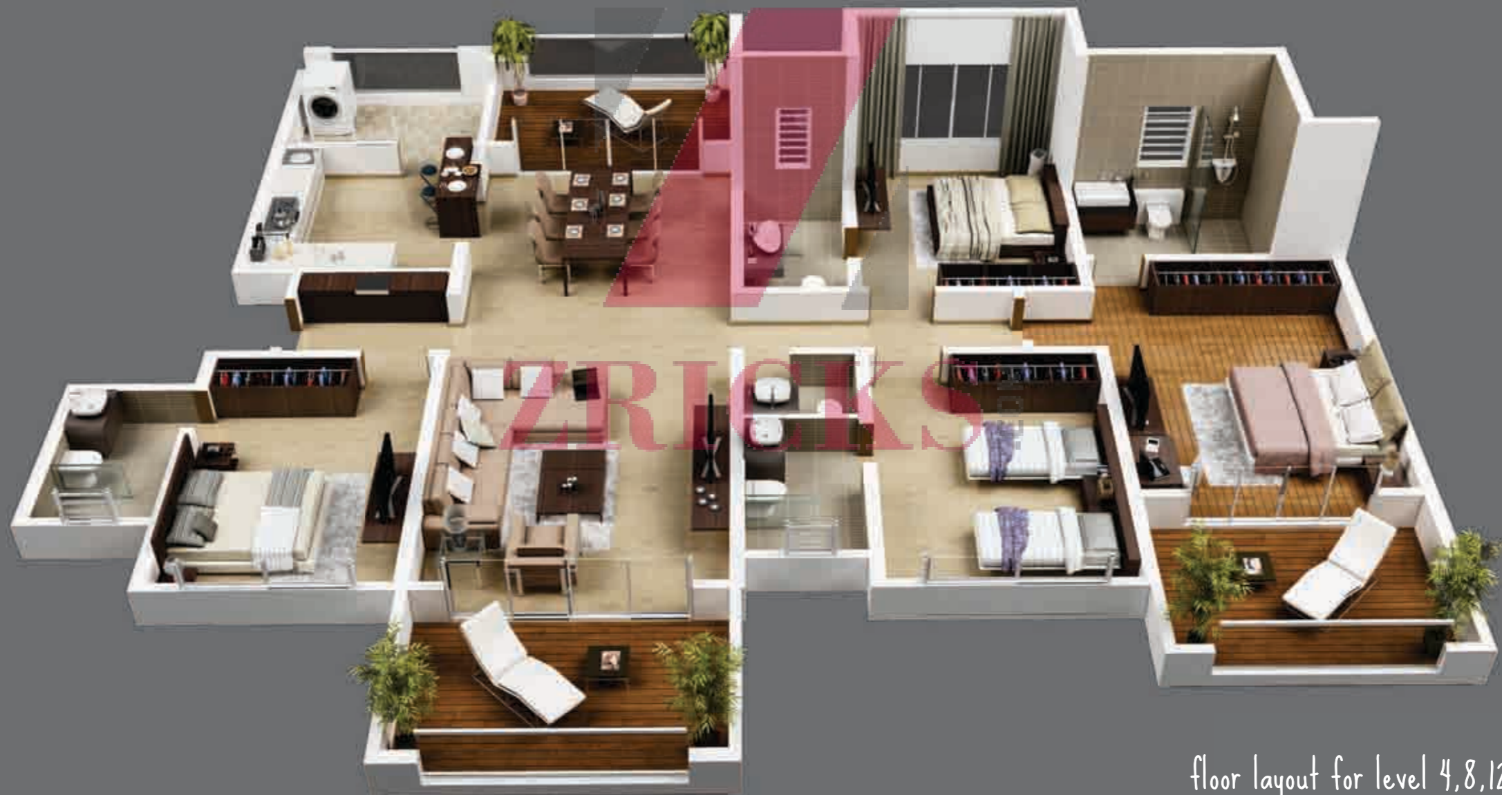
floor layout for level 4,8,12