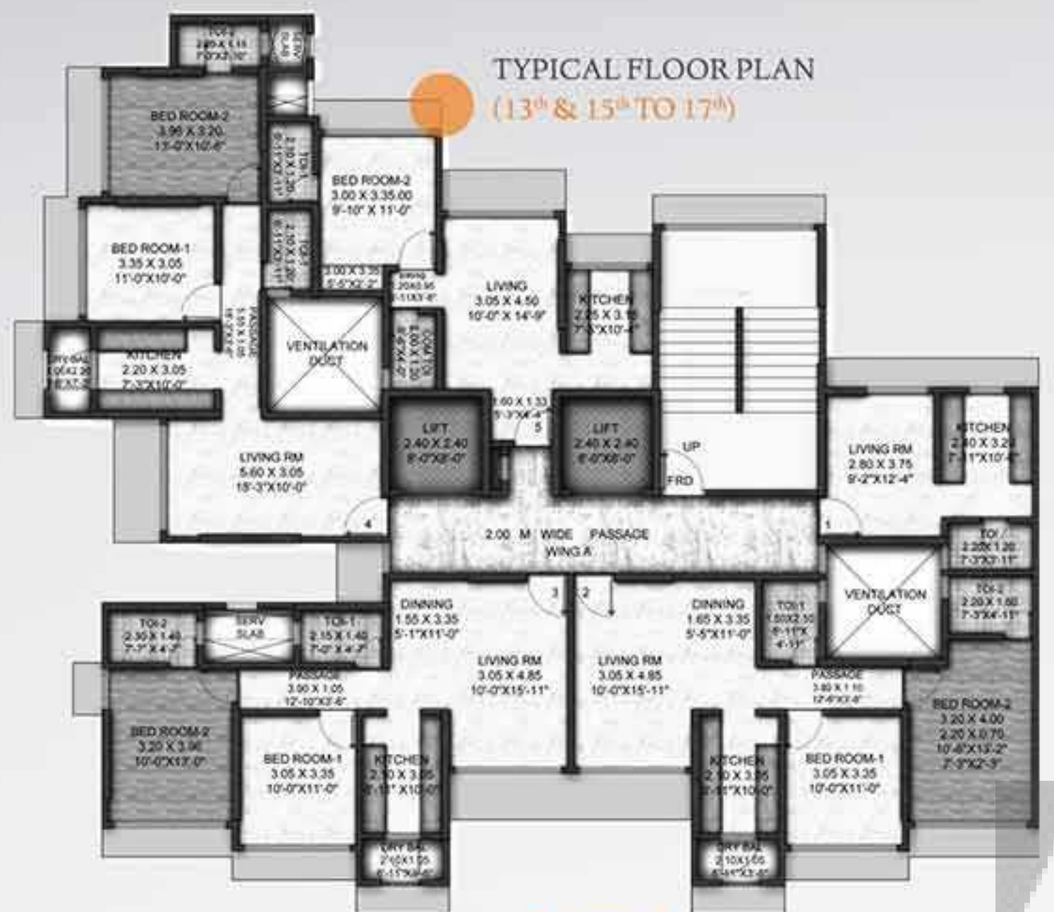
TYPICAL FLOOR PLAN (13 th & 15 th TO 17 th )