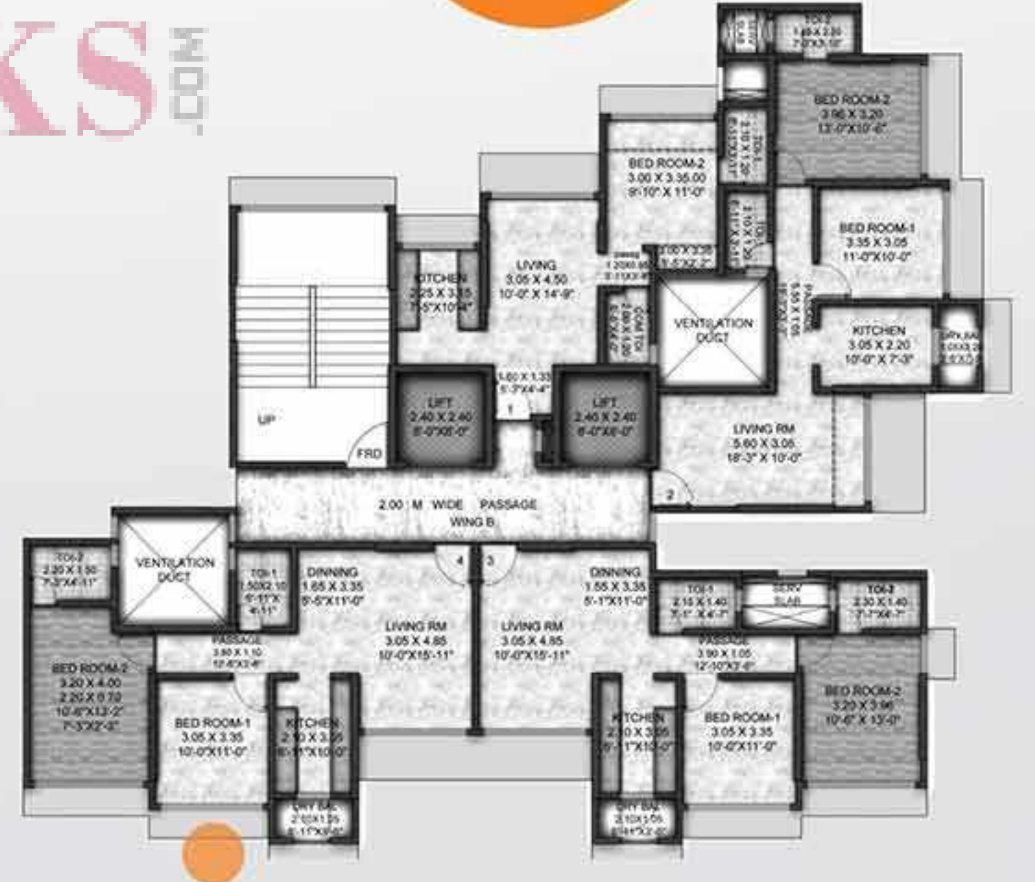
14 th FLOOR PLAN (Refuge Floor)