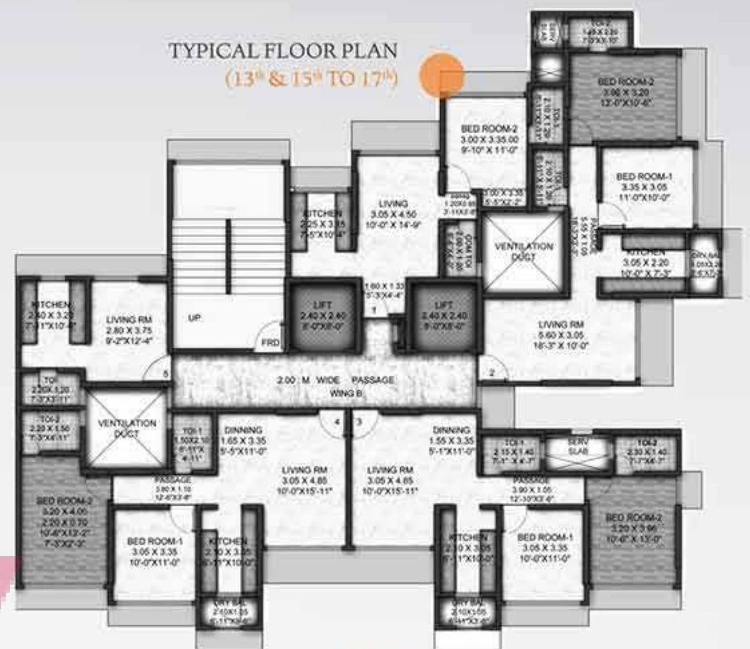
TYPICAL FLOOR PLAN (13 th & 15 th TO 17 th )