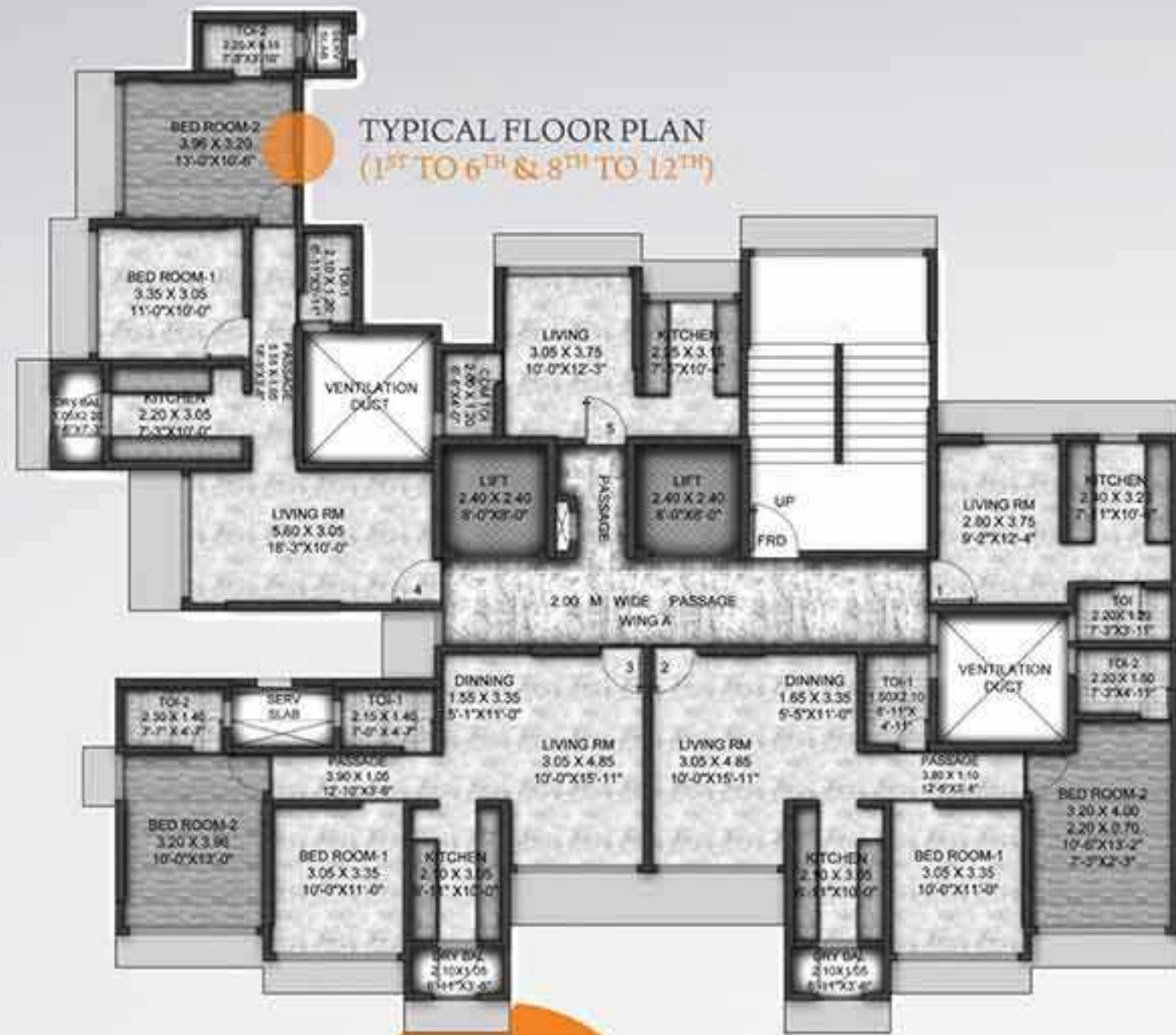
TYPICAL FLOOR PLAN (1 ST TO 6 TH & 8 TH TO 12 TH )