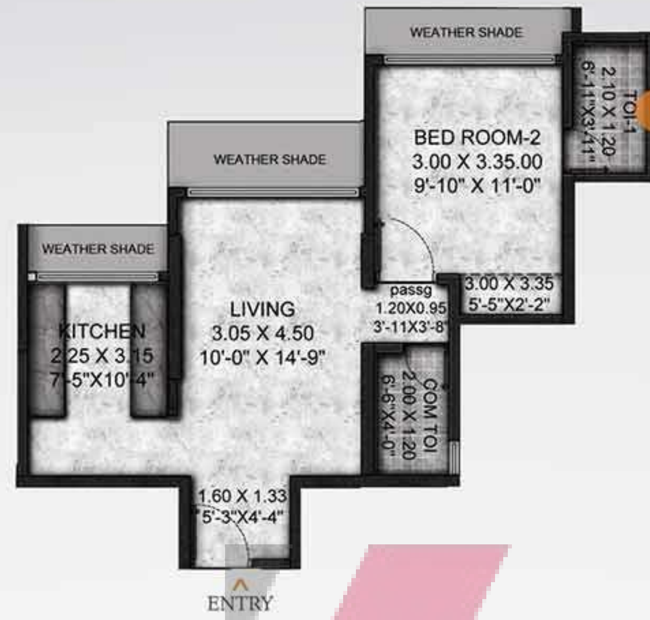
TYPICAL UNIT PLAN 1BHK CARPET AREA 41.06 SQ.MT / 442 SQ.FT