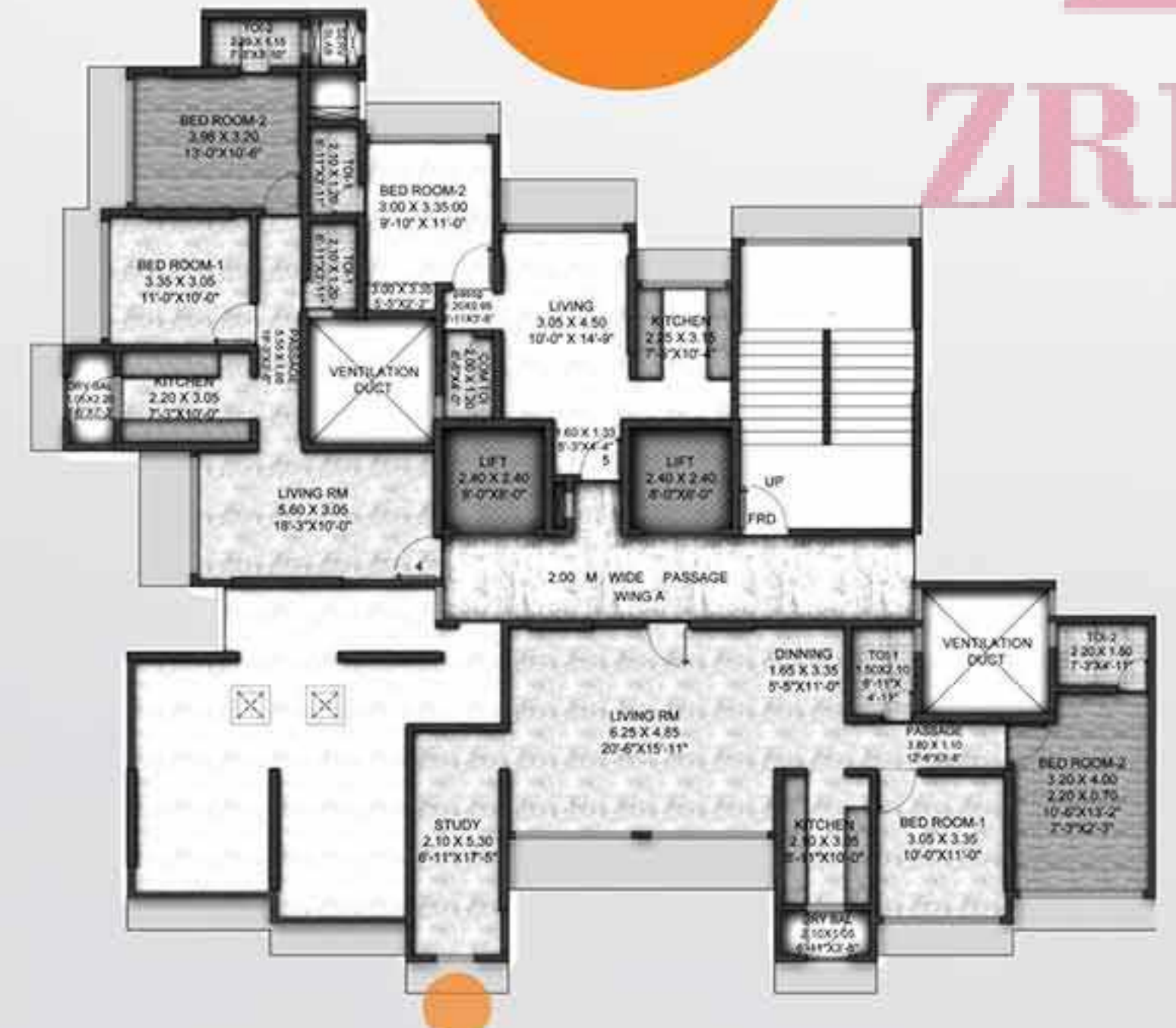
14 th FLOOR PLAN (Refuge Floor)