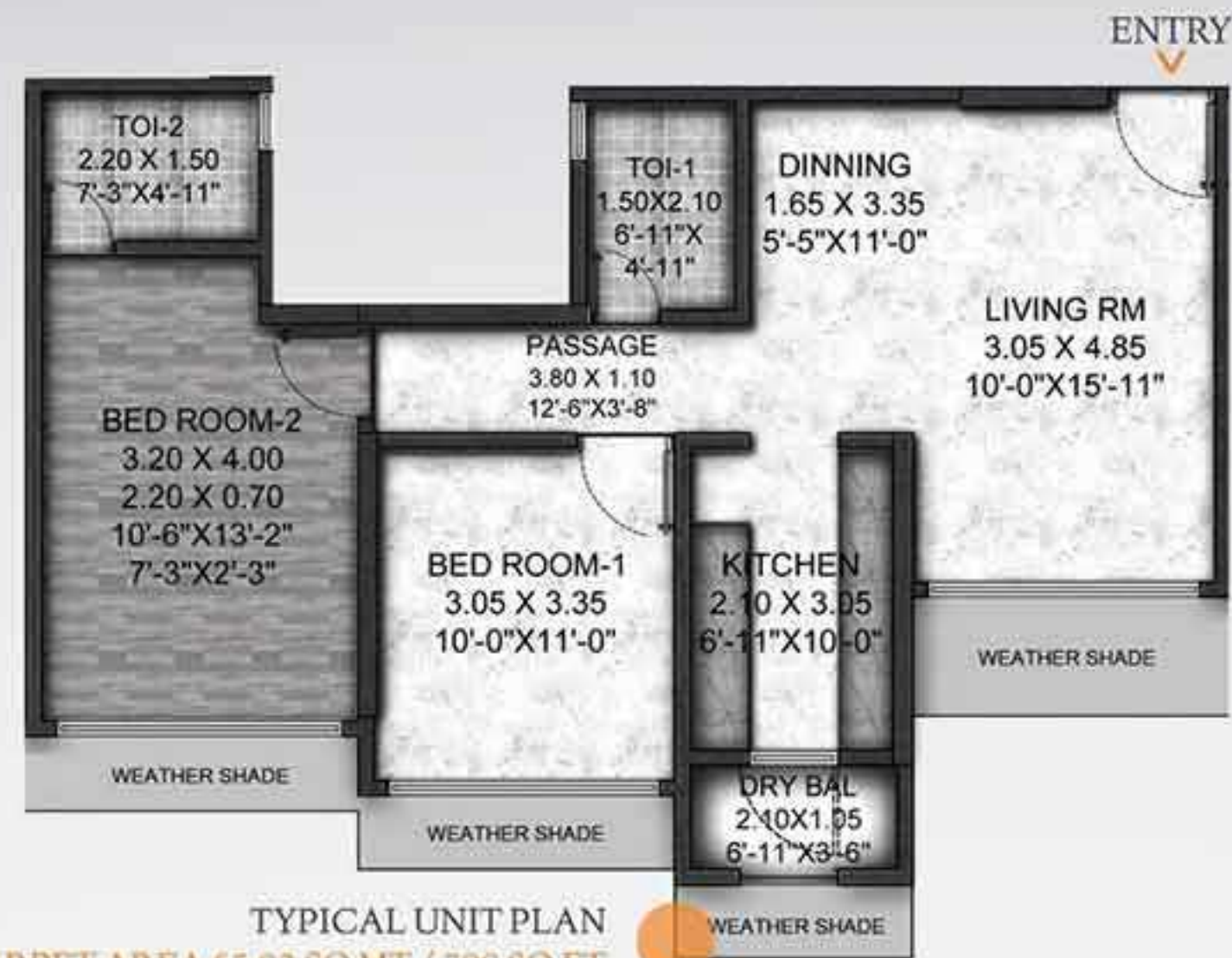
TYPICAL UNIT PLAN 2 BHK CARPET AREA 65.03 SQ.MT / 700 SQ.FT