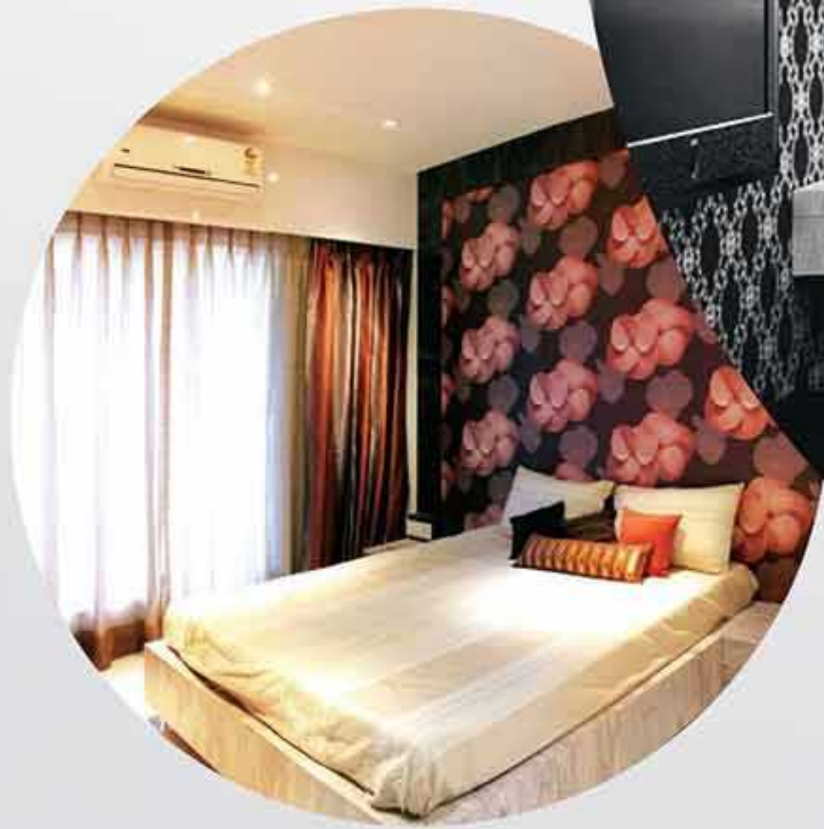
ACTUAL PHOTO OF THE BED ROOM

A PERFECT SPACE where you can unwind and rejuvenate after a long day at the work.