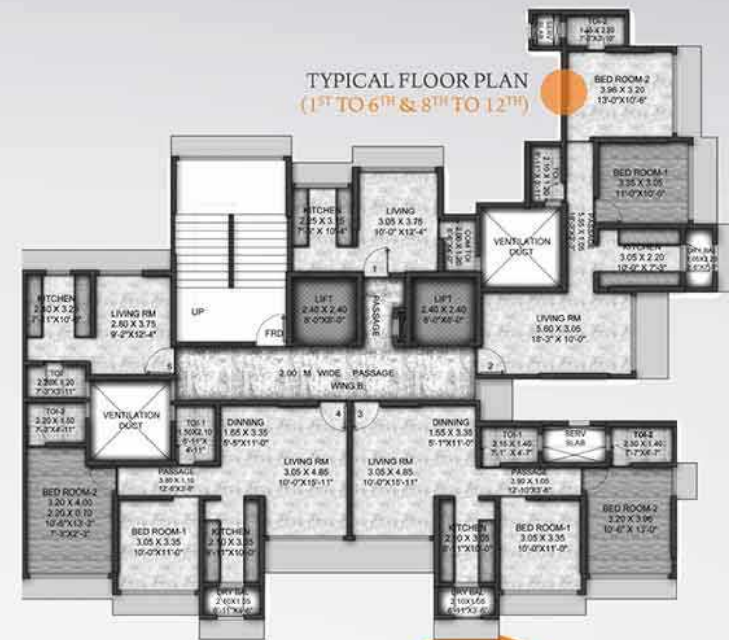
TYPICAL FLOOR PLAN (1 ST TO 6 TH & 8 TH TO 12 TH )