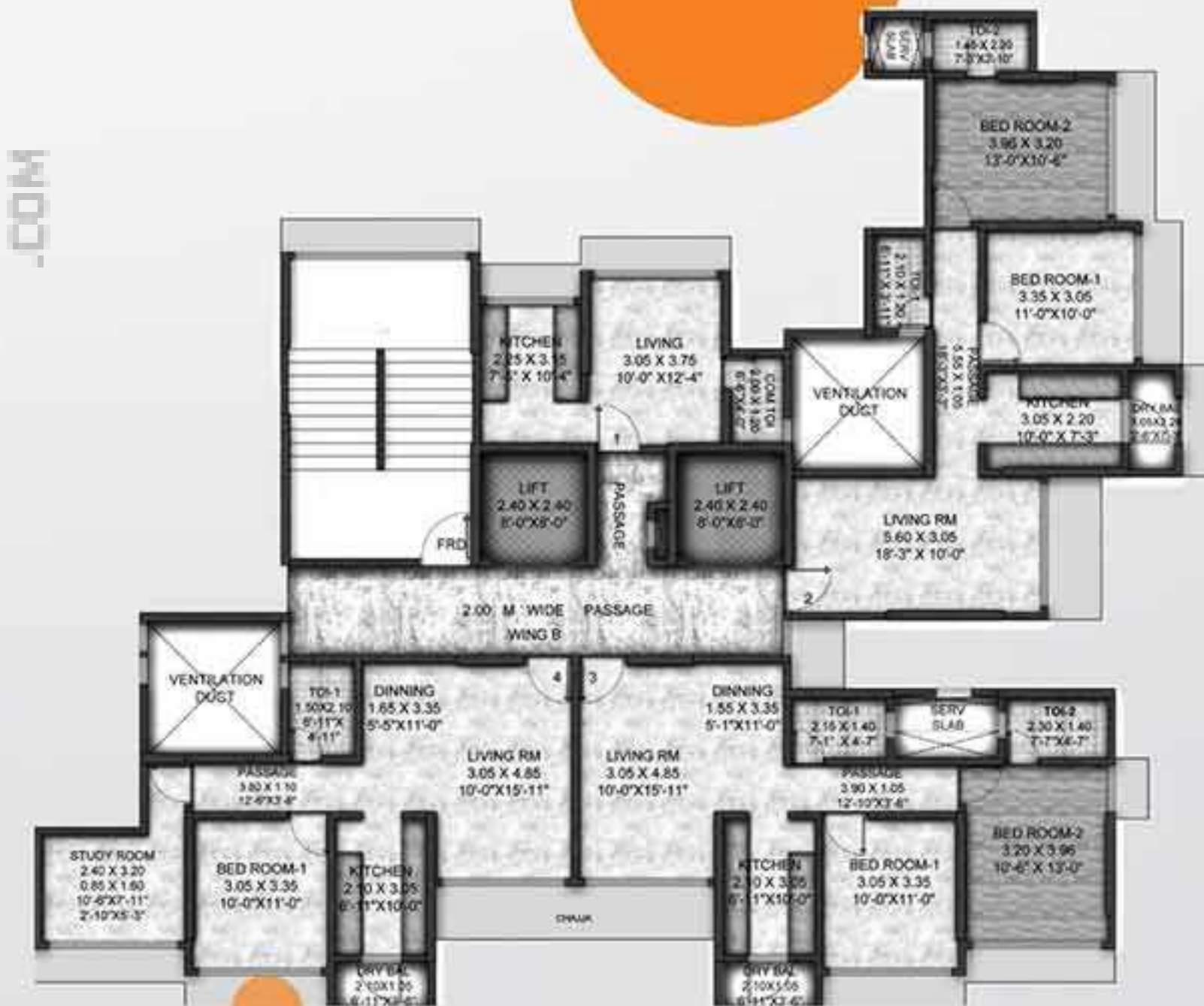
7 th FLOOR PLAN (Refuge Floor)