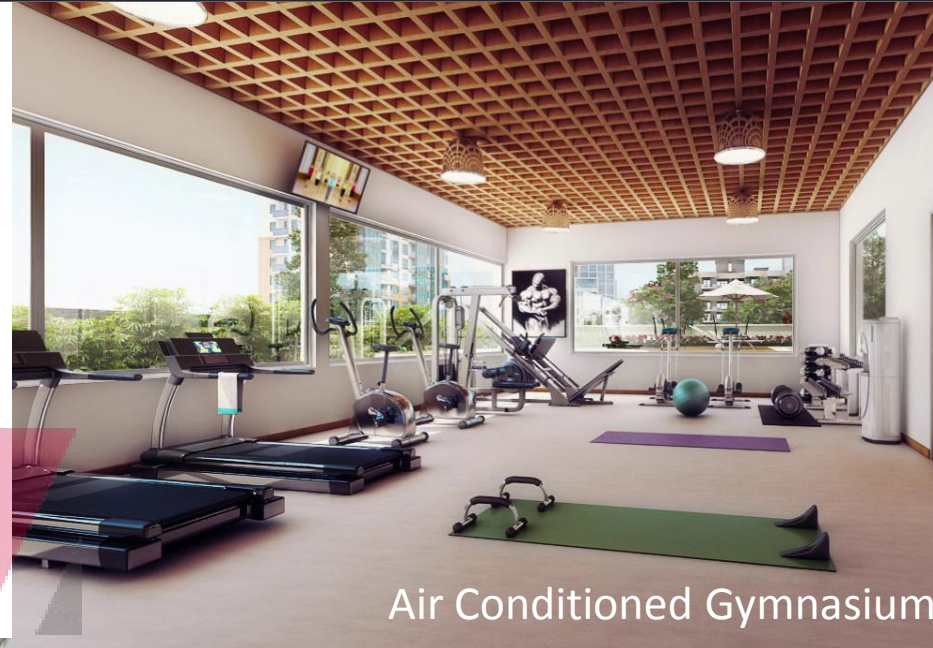
Air Conditioned Gymnasium