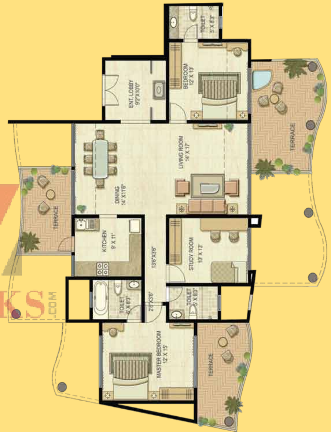
3 BHK Luxurious Apartment Oakland Floor plan