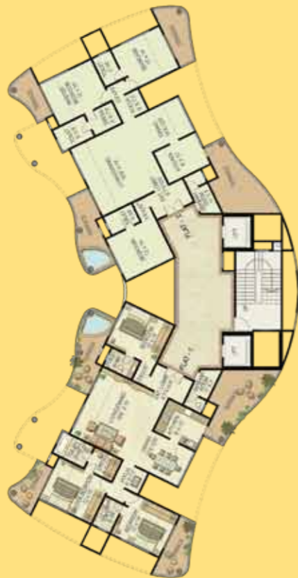
1 st , 3 rd , 5 th , 7 th , 9 th & 11 th floor