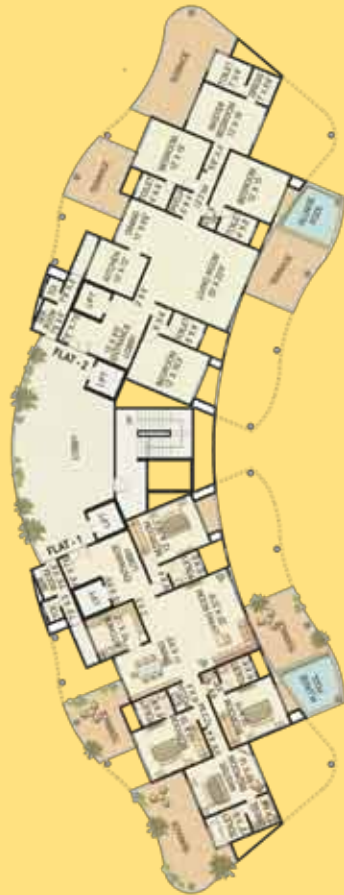
1 st , 3 rd , 5 th , 7 th , 9 th & 11 th floor