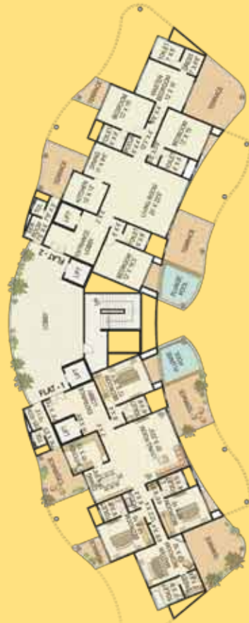
2 nd , 4 th , 6 th , 8 th , 10 th & 12 th floor