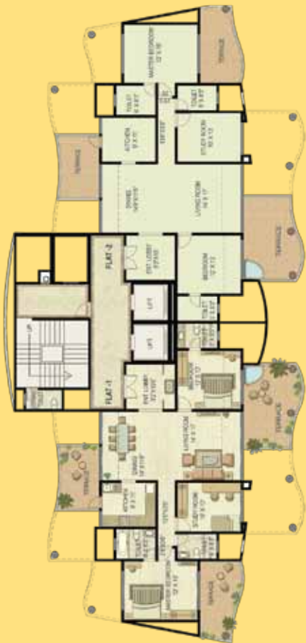
1st, 3rd 5th 7th & 9th floor