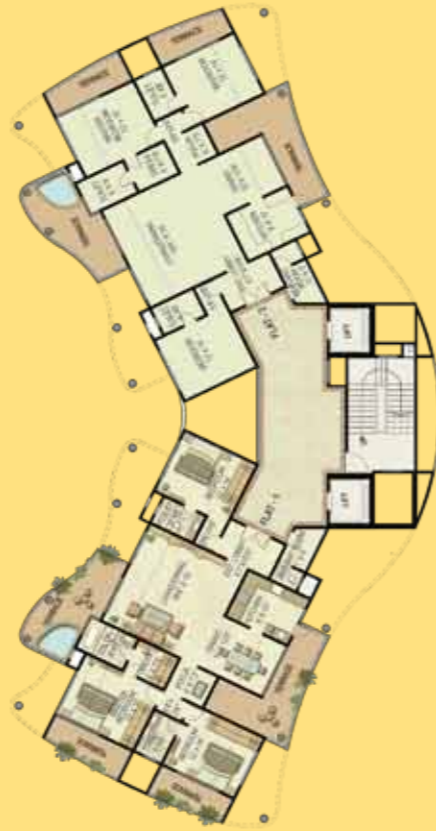
2 nd , 4 th , 6 th , 8 th , 10 th & 12 th floor