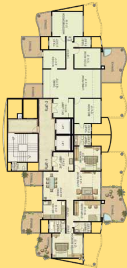
2nd, 4th 6th, 8th & 10th floor