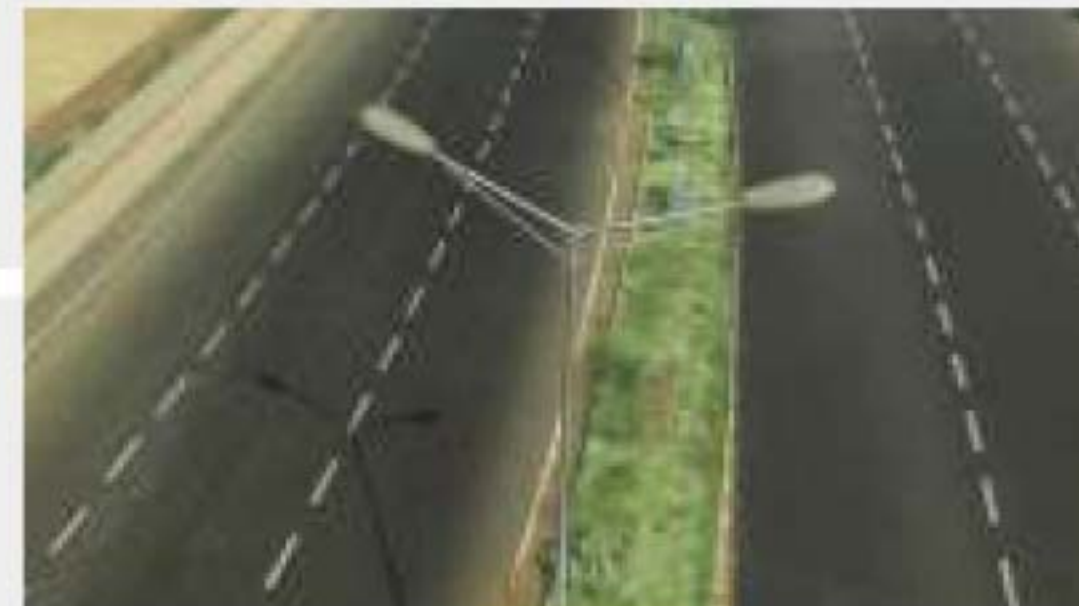
STREET LIGHTS INSTALLED