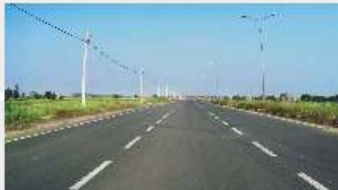
75M ROAD AND SECTOR ROADS READY