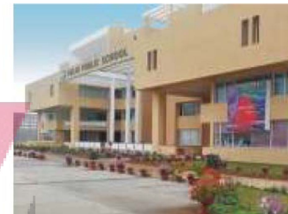
Delhi Public School