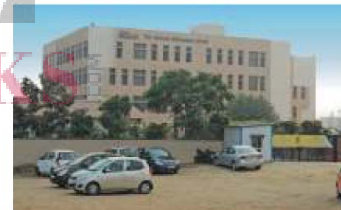
Sriram Millennium School