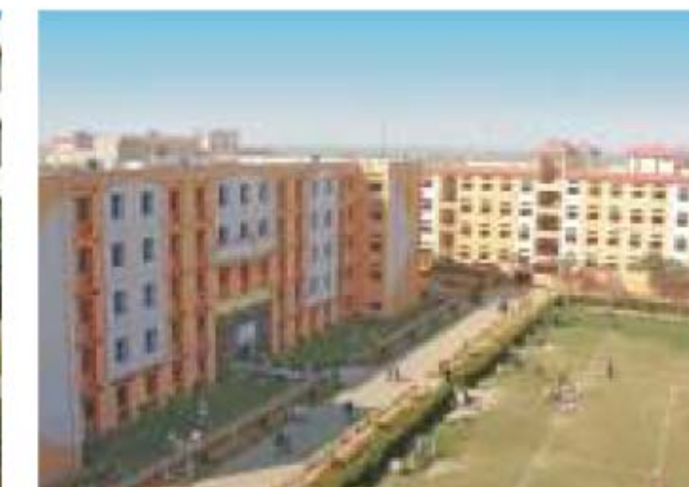
Lingaya's Institute of Management and Technology