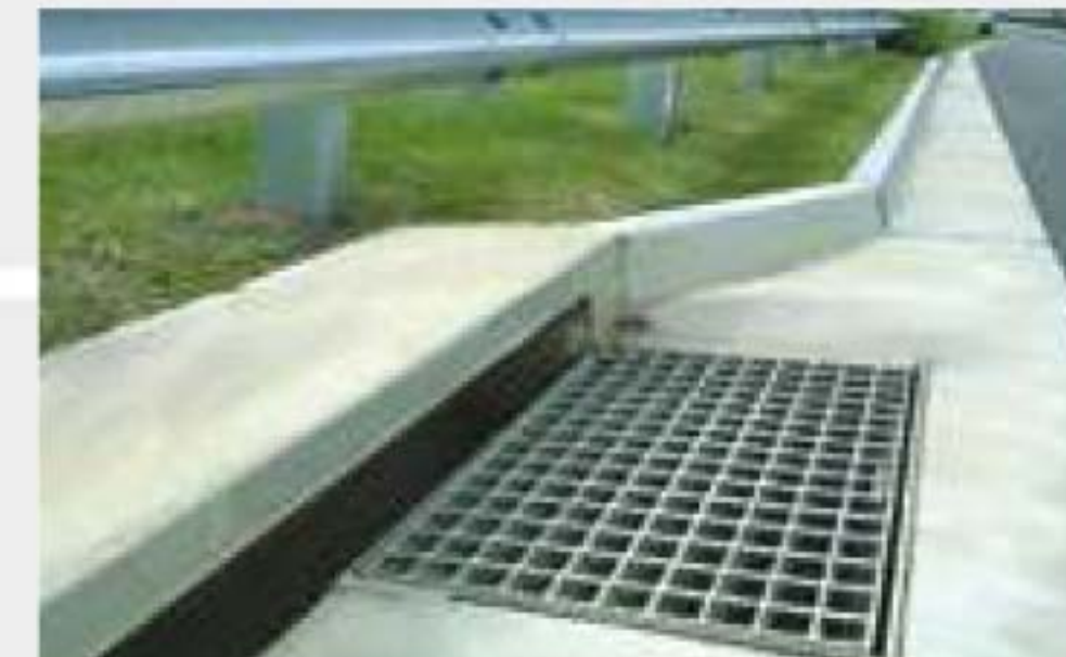
STORM WATER DRAINAGE & SEWERAGE LAID