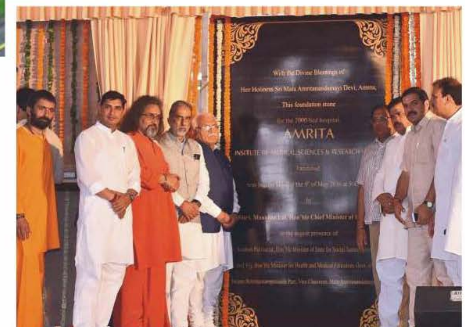
Mata Amritanandmayi Math Hospital, Faridabad

In addition, there is another under construction 100 bed hospital by AIMS (Asian Institute of Medical Sciences) in sector 88, Faridabad.