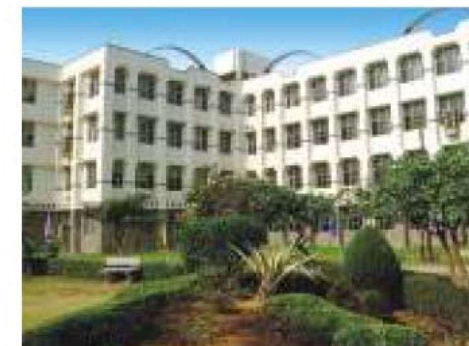
Sudha Rustagi Dental College