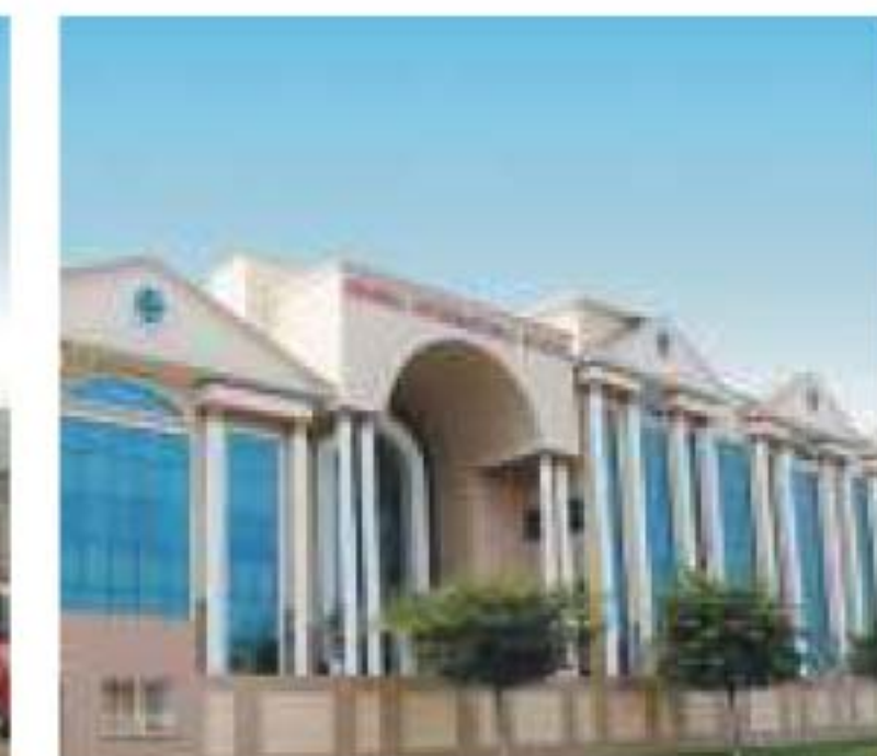
Aravali International School