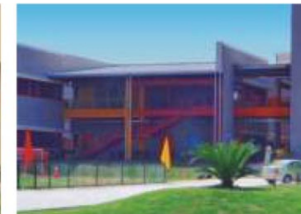
Shiv Nadar School