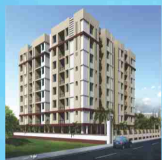
Coral Golf Green Near Air Force, Golf Course Scheme, Ratanade, Jodhpur