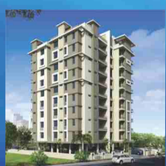
Coral Dhamu Patel Nagar, Bikaner