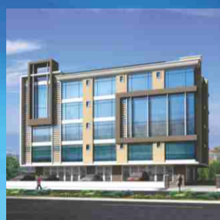
Coral Studio One Sehkar Marg, Lal Kothi, Jaipur