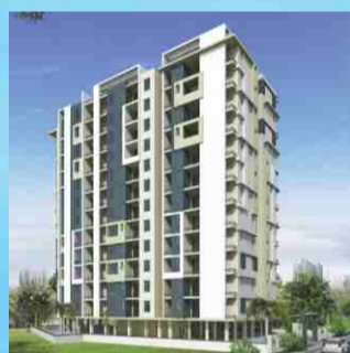
Coral Czar Budh Vihar, Alwar