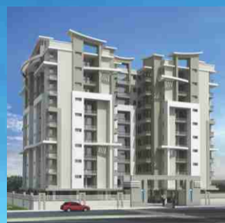
Coral Radha Krishna Green Triveni, Sikar Road, Jaipur