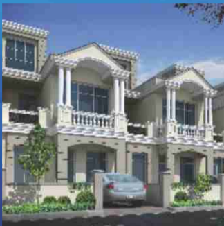
Coral Crimson Court Near SKIT, Jagatpura