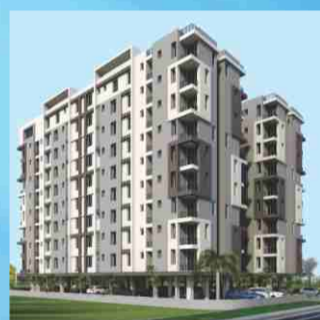
Coral Studio 2 Jagatpura, Jaipur