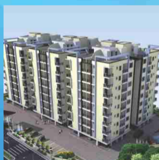
Coral Shubh Niwas New Navratan Complex, Bhuwana Road, Udaipur