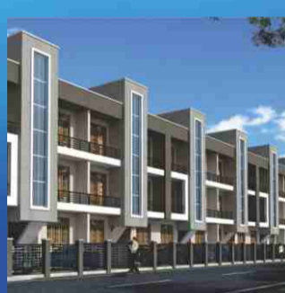
Coral Eshwar Old Shivbari Road, Bikaner