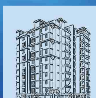
Coral Premium Residential Apartments Pune