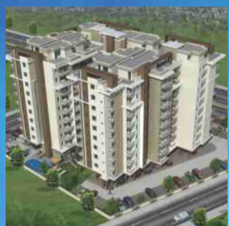
Coral Arihant Heights Patrakar Colony, Near Mansarovar, Jaipur