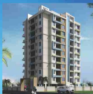
Coral Evoq Near Gyan Vihar, Jagatpura, Jaipur