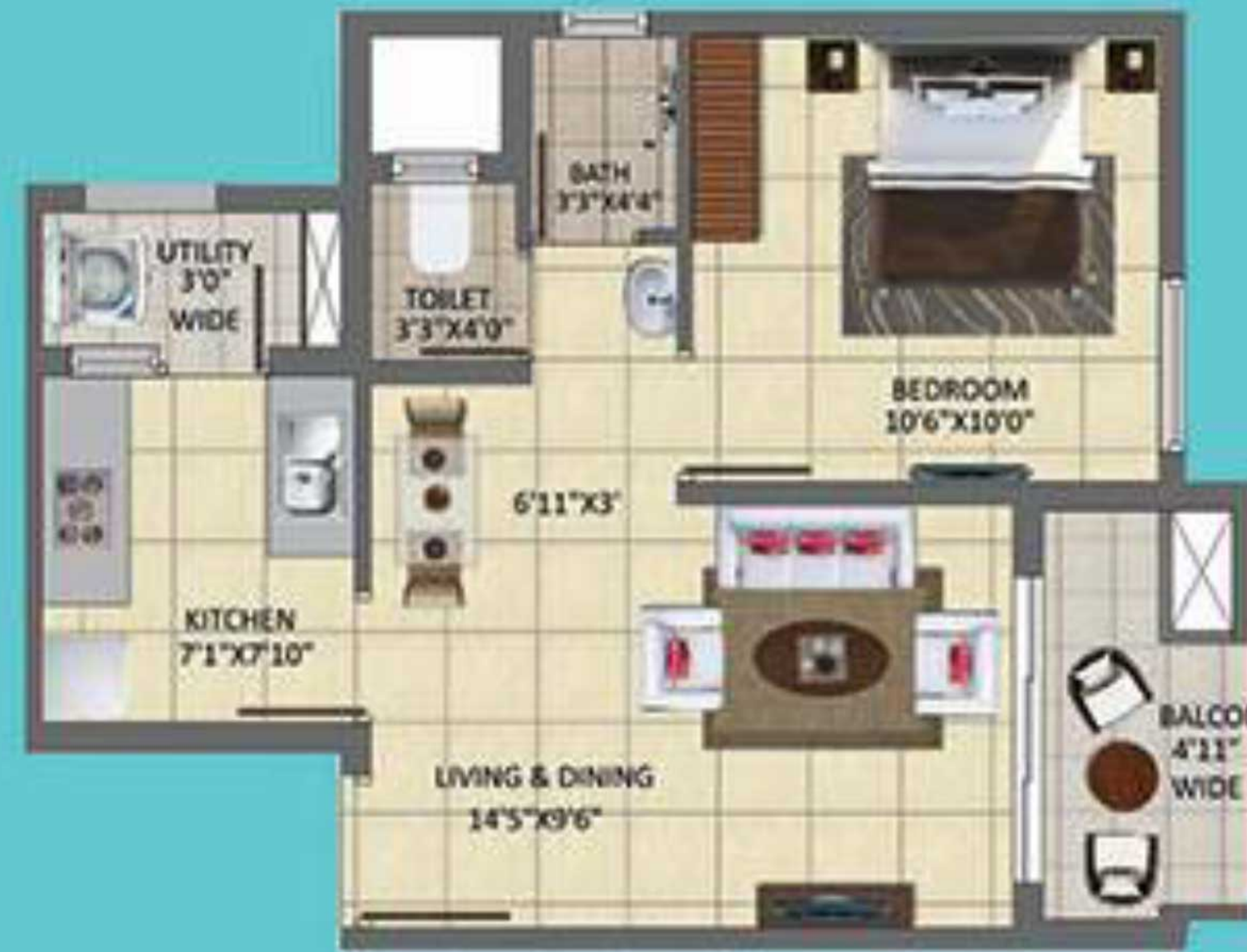
1 BHK-TYPE 1 Saleable Area: 612 sqft