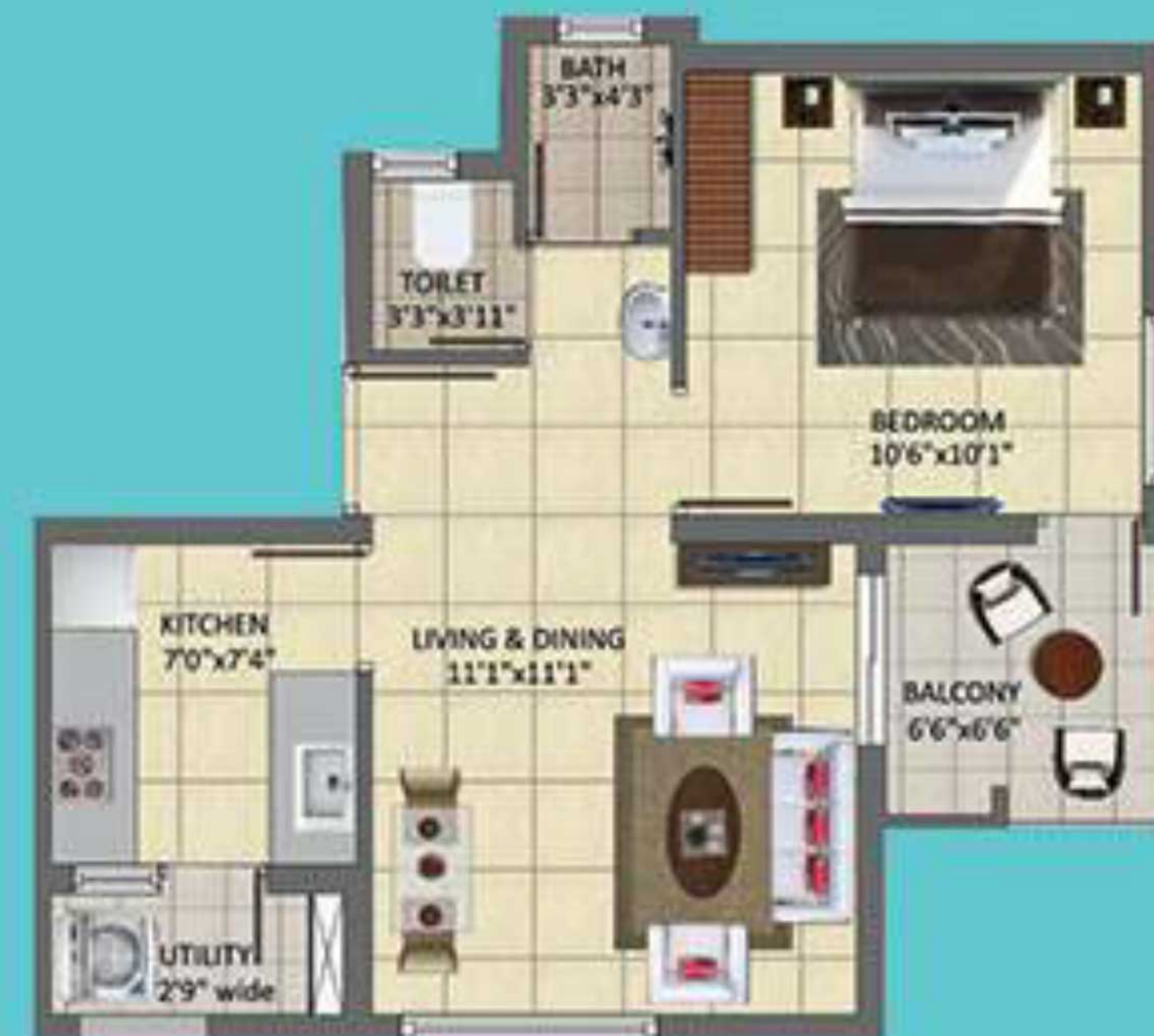
1 BHK-TYPE 3 Saleable Area: 603 sqft