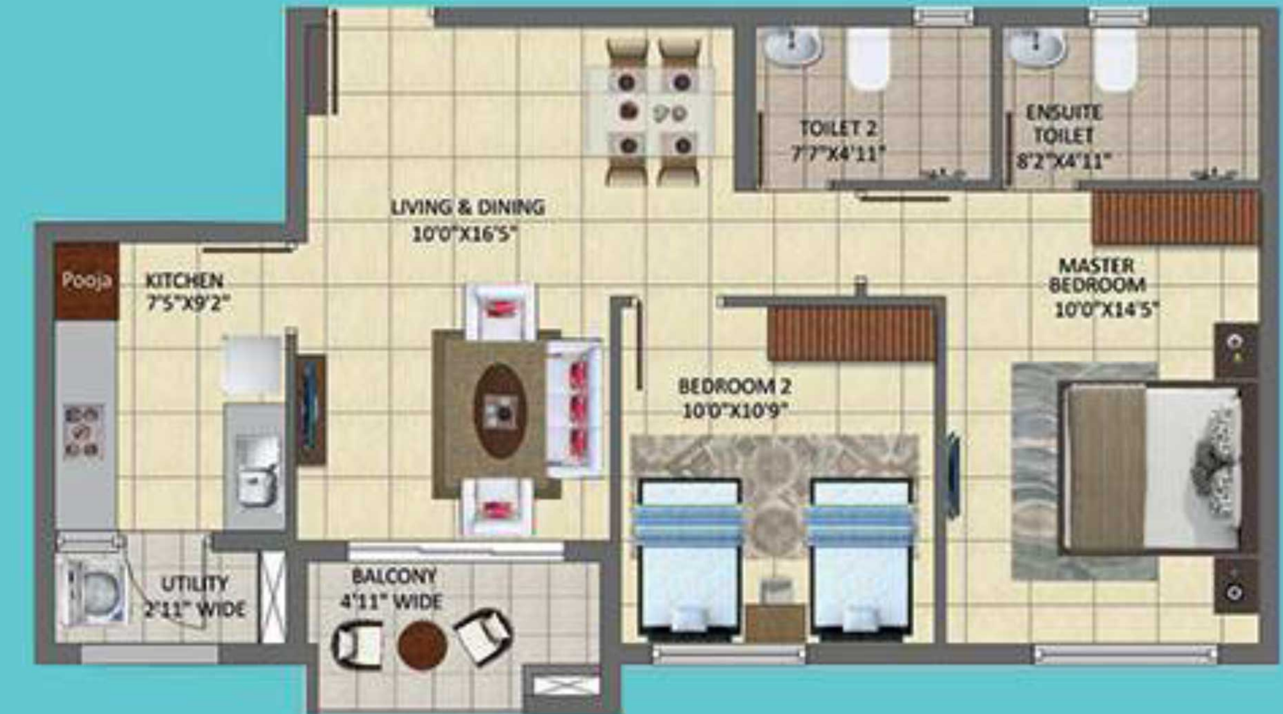
2 BHK SMALL Saleable Area: 999 sqft