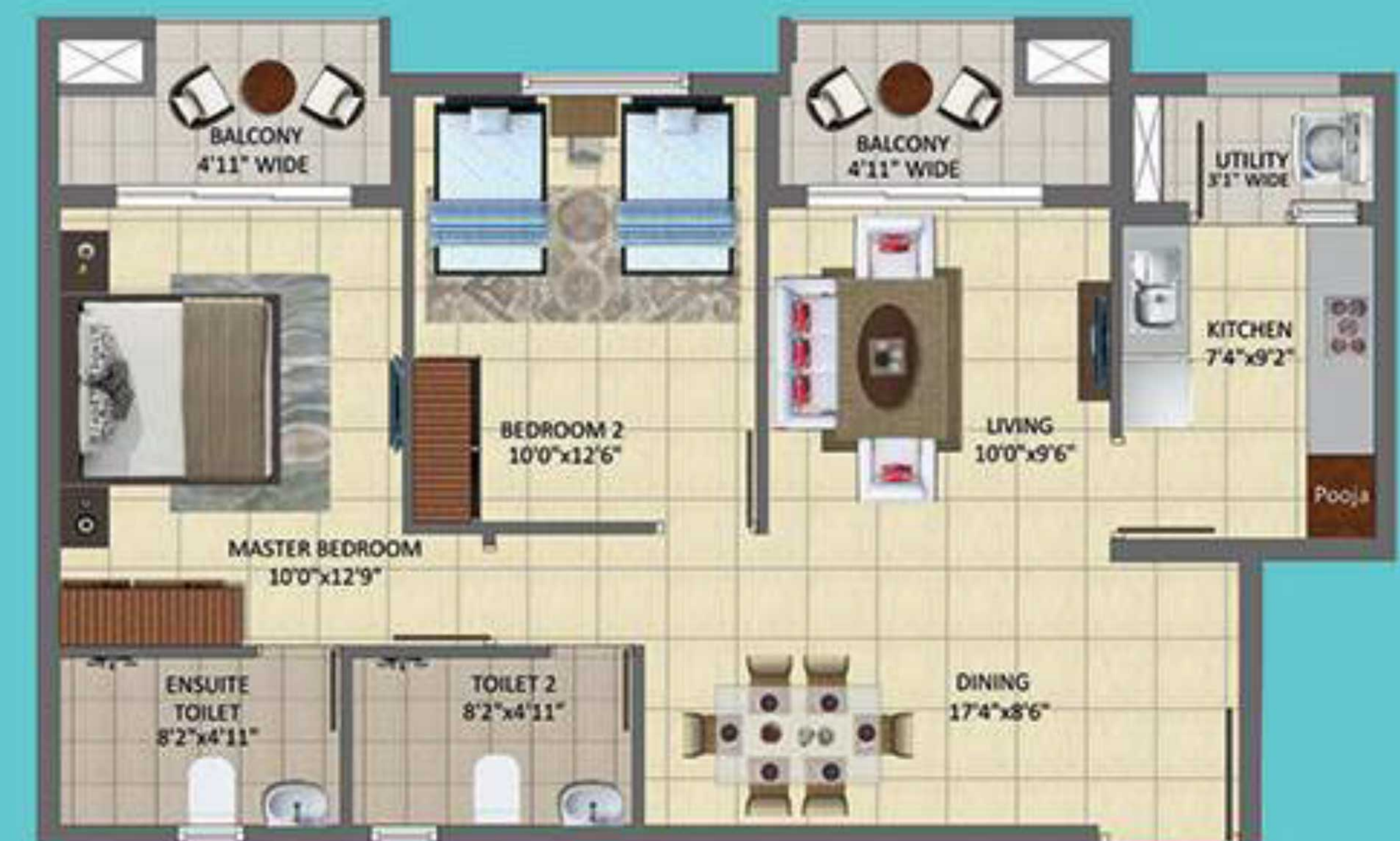
2 BHK LARGE Saleable Area: 1152 sqft