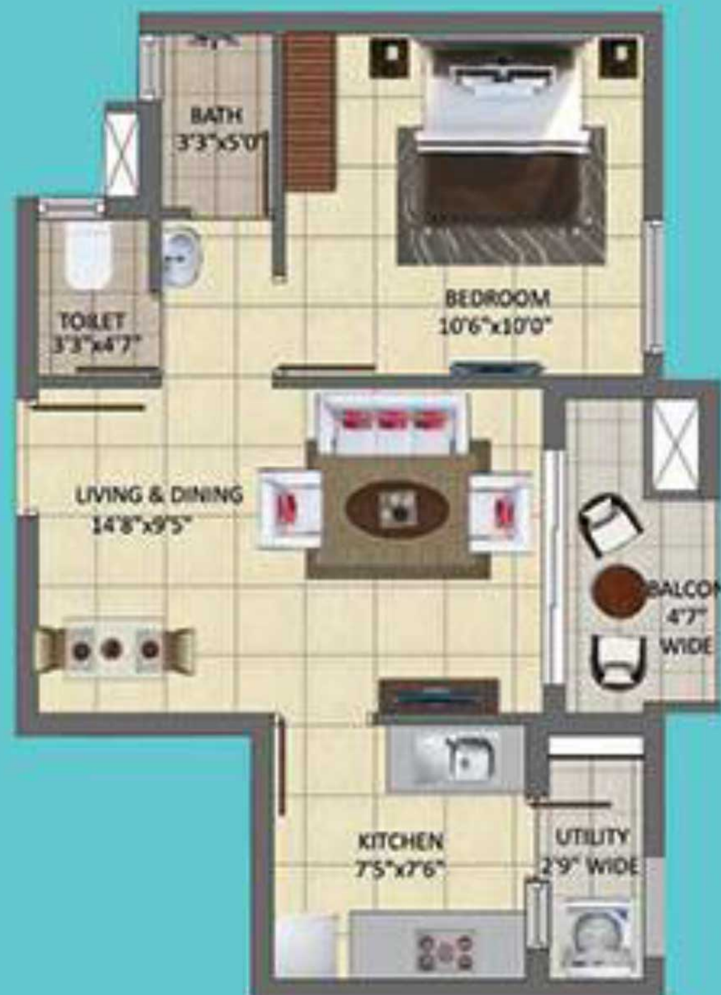
1 BHK-TYPE 2 Saleable Area: 603 sqft