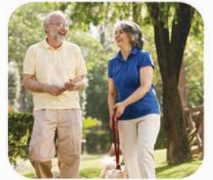
Senior Living Community