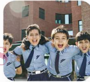
National Public School