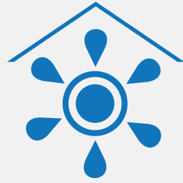
Comercial Hub cum Residential Area

One of the select cities chosen in the list of Smart Cities, Thane is equipped with excellent Rail & Road connectivity; along with exceptional Infrastructure. It is one of the few places to mirror a perfect work-life balance, and hence is the top choice of investors for commercial as well as residential spaces.