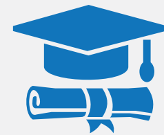
Schools & Colleges