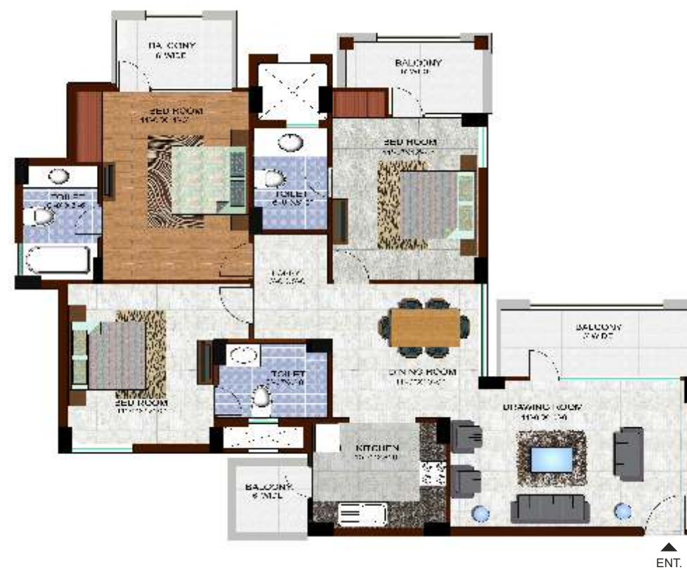
3 Bedroom 1675 sq. ft.