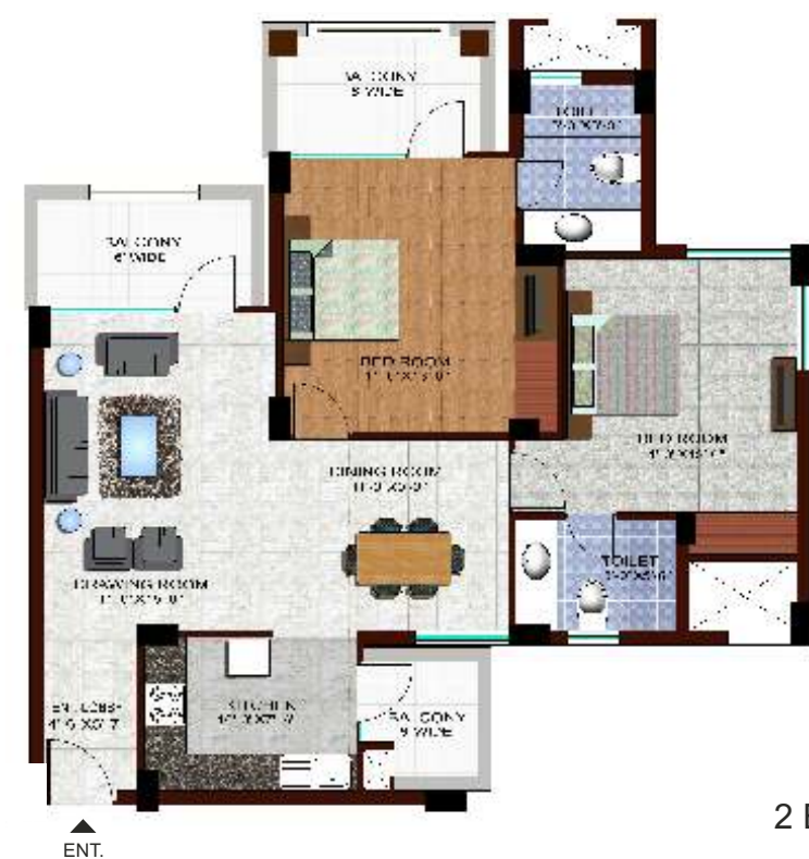
2 Bedroom 1310 sq. ft.