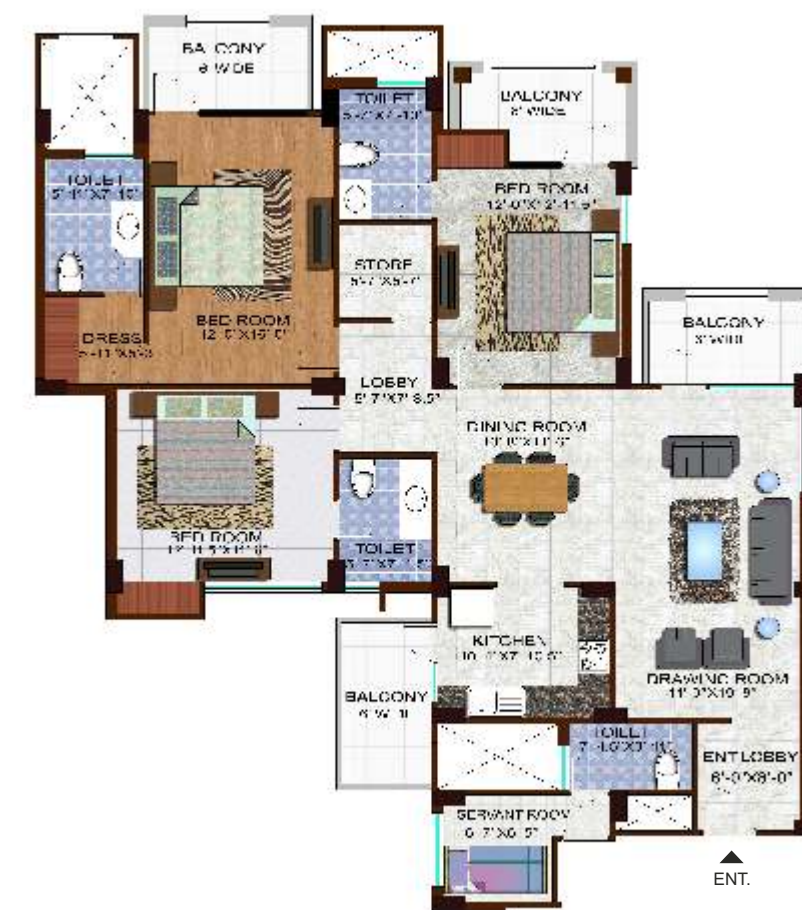
3 Bedroom 1990 sq. ft.