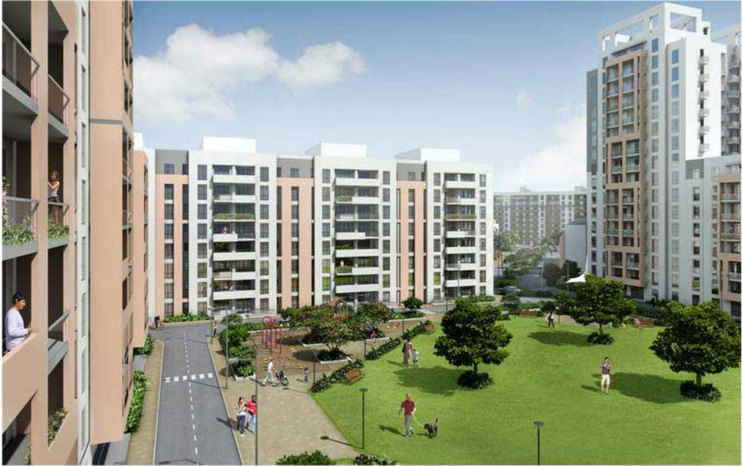
Central Park View