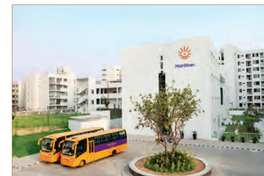
MATRIKIRAN · Sohna Road

URBAN WOODS Vatika Infotech City, Jaipur