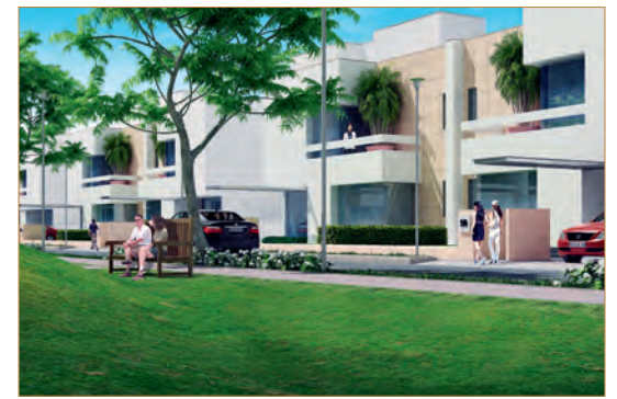
SIGNATURE VILLAS · Vatika India Next