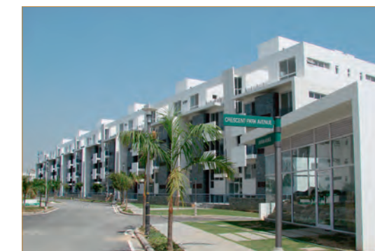
VATIKA CITY · Gurgaon