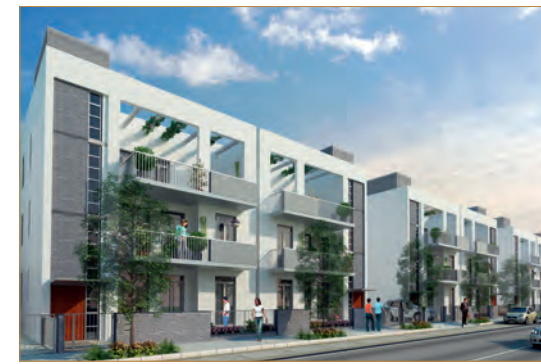
INXT FLOORS · Vatika India Next