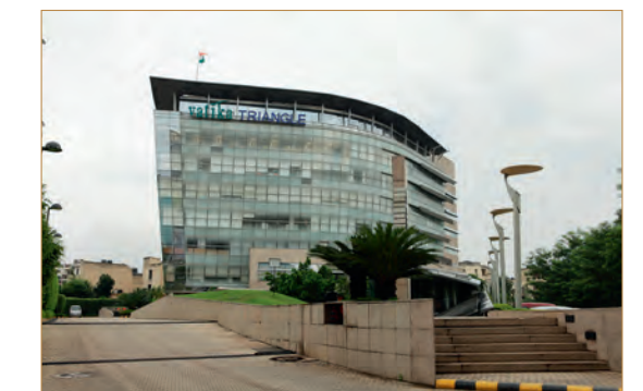
VATIKA TRIANGLE · Gurgaon