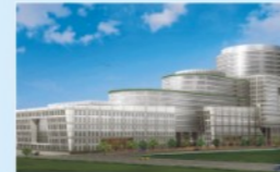
DLF Building 10, Gurgaon