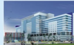
DLF IT SEZ @ Sikhera, Gurgaon