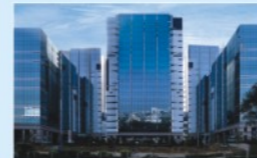
DLF Cyber Green, Gurgaon

The information contained herein is submitted subject to errors and changes/withdrawals at the sole discretion of the company.