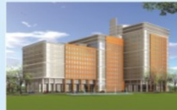
DLF Building 6, Gurgaon