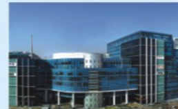
DLF Infinity Tower, Gurgaon