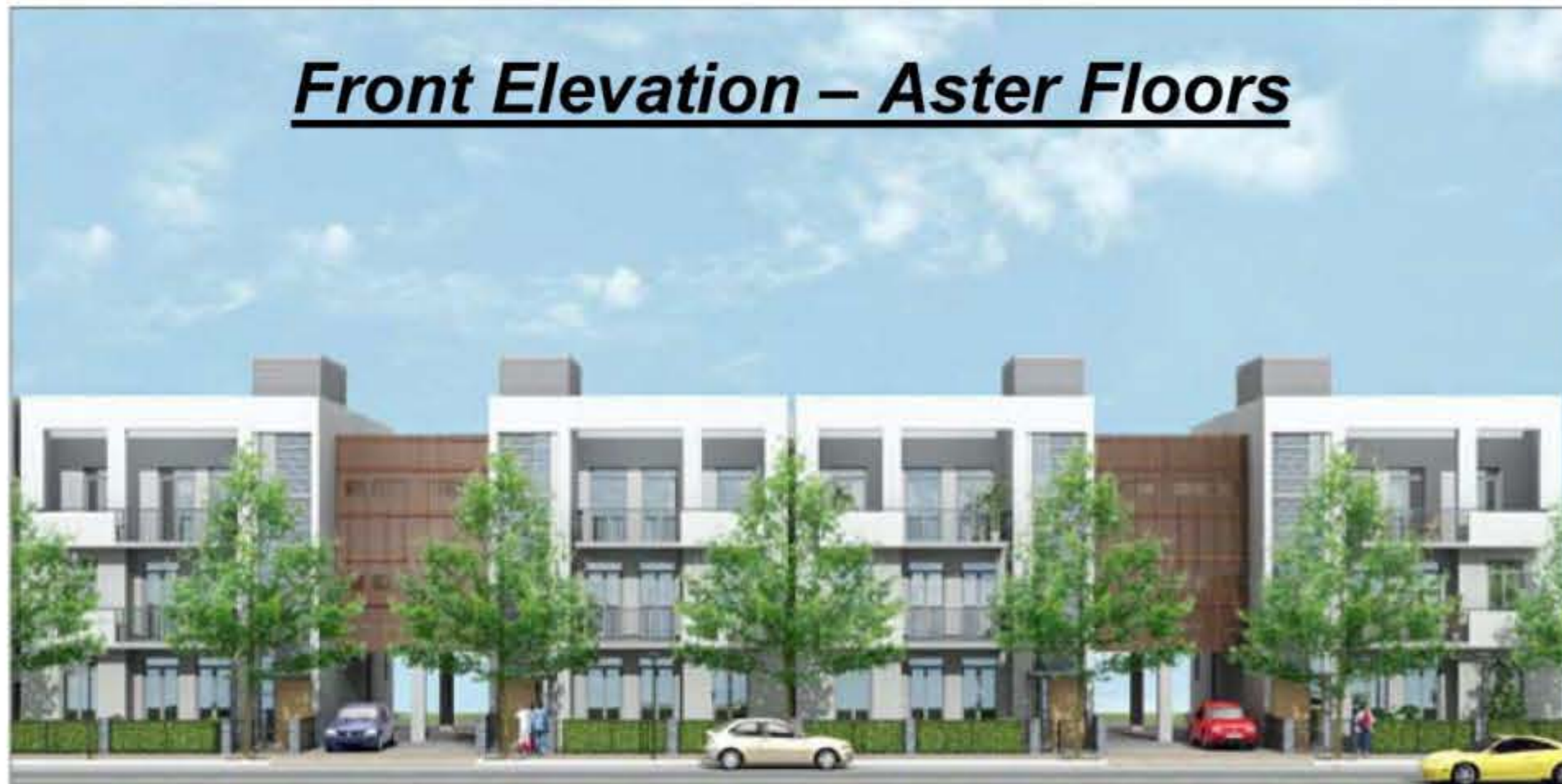
Front Elevation – Aster Floors