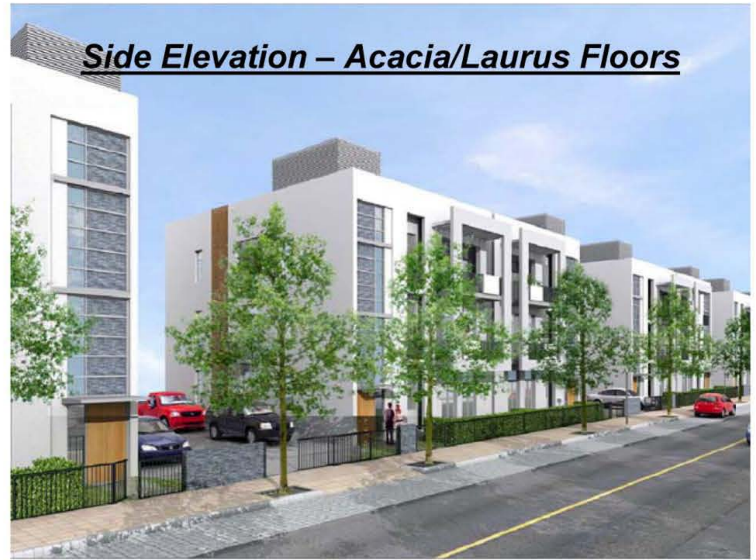
Side Elevation – Acacia/Laurus Floors