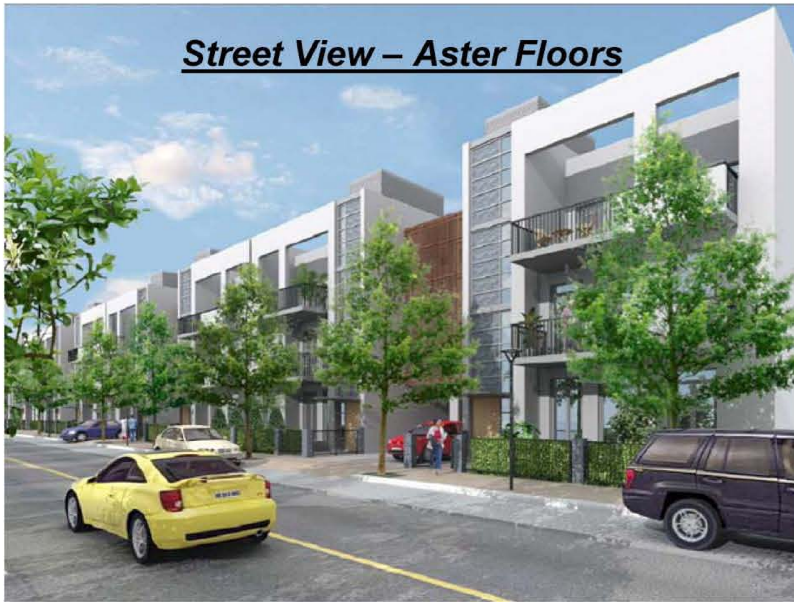
Street View – Aster Floors