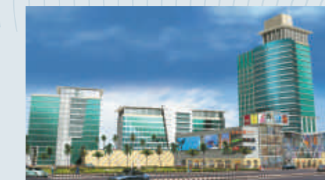
▲ DLF IT Park @ Kolkata