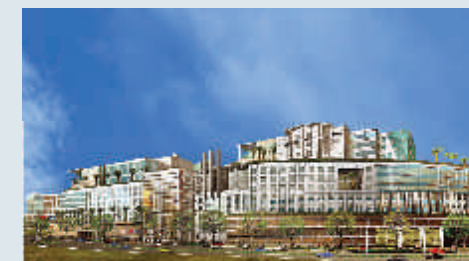
▲ DLF Cyber City @ Hyderabad