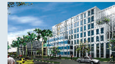
▲ DLF IT Park @ Chennai

With over six decades of excellence, DLF is a name synonymous with global standards and new generation workspaces for new generation work styles. The Group has the distinction of developing commercial projects and technology parks that are at par with the best in the world.