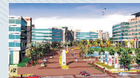
▲ DLF Akruiti IT Park @ Pune