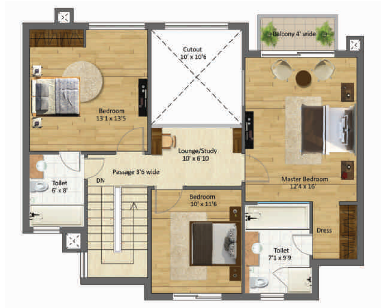
Upper Level Plan