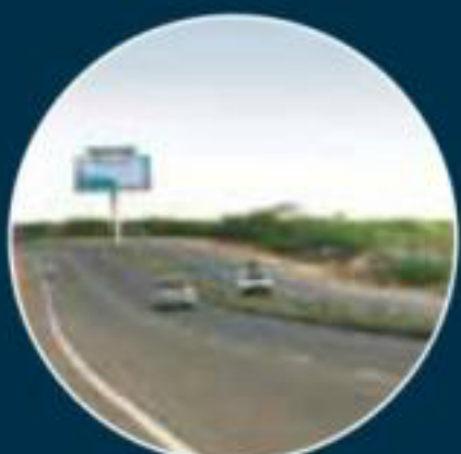
GURGAON-FARIDABAD EXPRESSWAY (Gurgaon-Faridabad in 40 mins*)