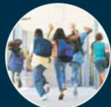
SCHOOLS IN SESSION