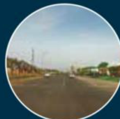
WELL DEVELOPED SECTOR ROADS FOR INTERNAL CONNECTIVITY