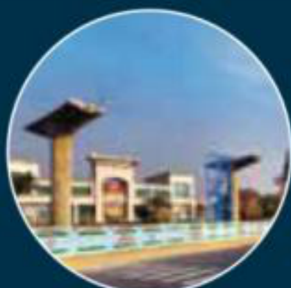
METRO PHASE-III IN SECTOR-12 WILL BE OPERATIONAL BY 2014