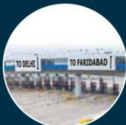
DELHI-FARIDABAD EXPRESSWAY (Delhi-Faridabad in 30 mins*)