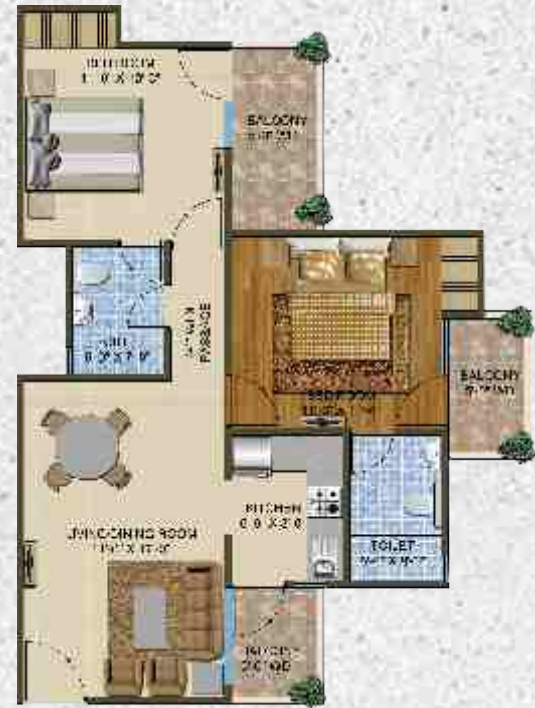
2 BHK + 2 TOILET SUPER AREA = 1020 SQ. FT.