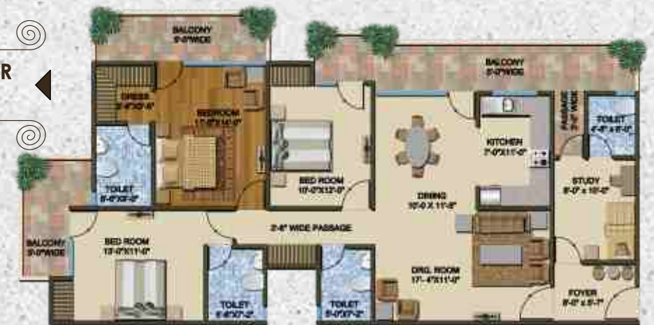
3 BHK + STUDY + DIN. + FOYER SUPER AREA = 2170 SQ. FT.