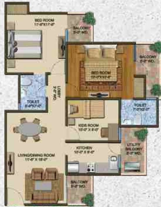
2 BHK + 2 TOILET + KIDS ROOM SUPER AREA = 1260 SQ. FT.