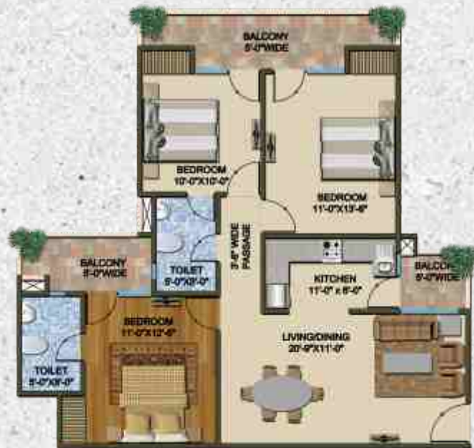
3 BHK + 2 TOILET SUPER AREA = 1425 SQ. FT.