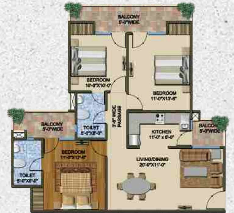
3 BHK + 2 TOILET SUPER AREA = 1900 SQ. FT.