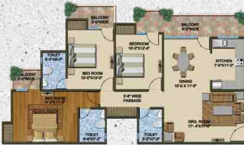
3 BHK + 3 TOILET + DIN. SUPER AREA = 1705 SQ. FT.