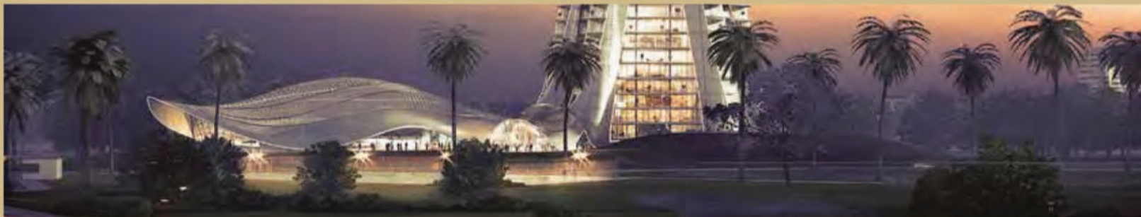
The Exclusive Tennis academy