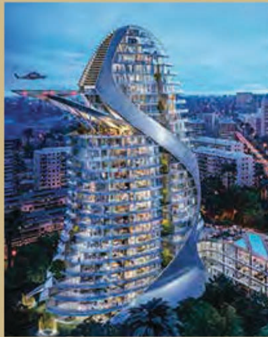
Michael Schumacher World Tower