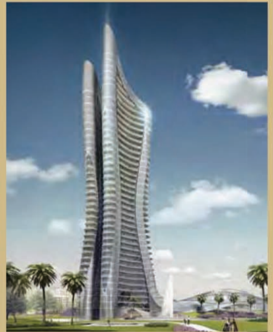
Ballet by Sharapova