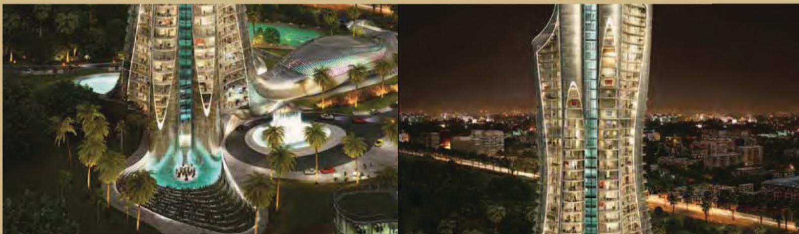
The Sharapova amphitheatre