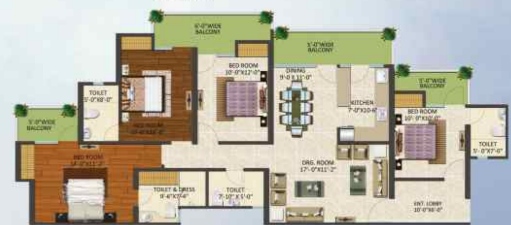
Super Area - 2125 sq. ft.