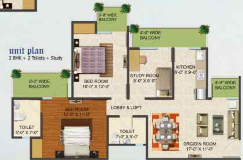
Super Area - 1255 sq. ft.