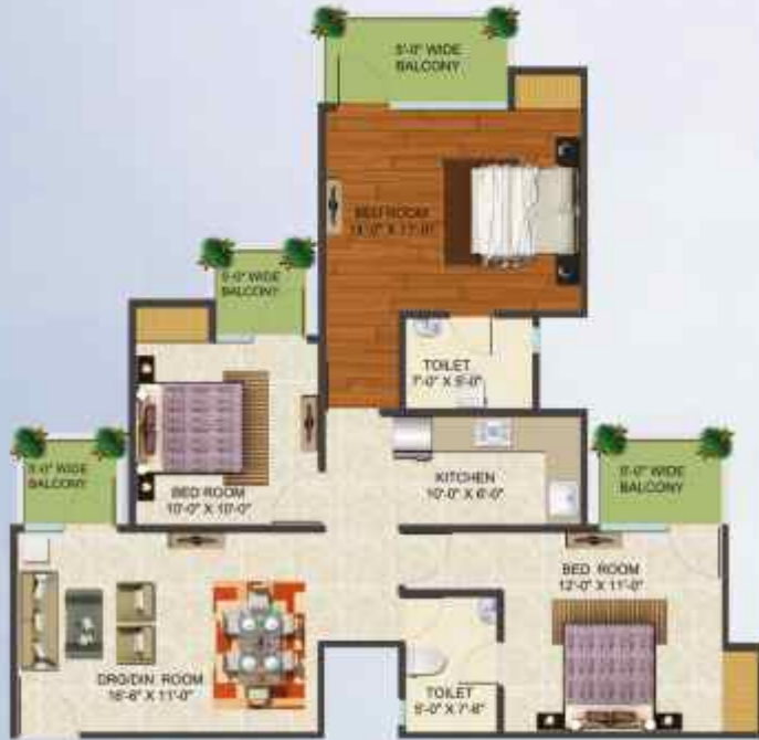
Super Area - 1440 sq. ft.