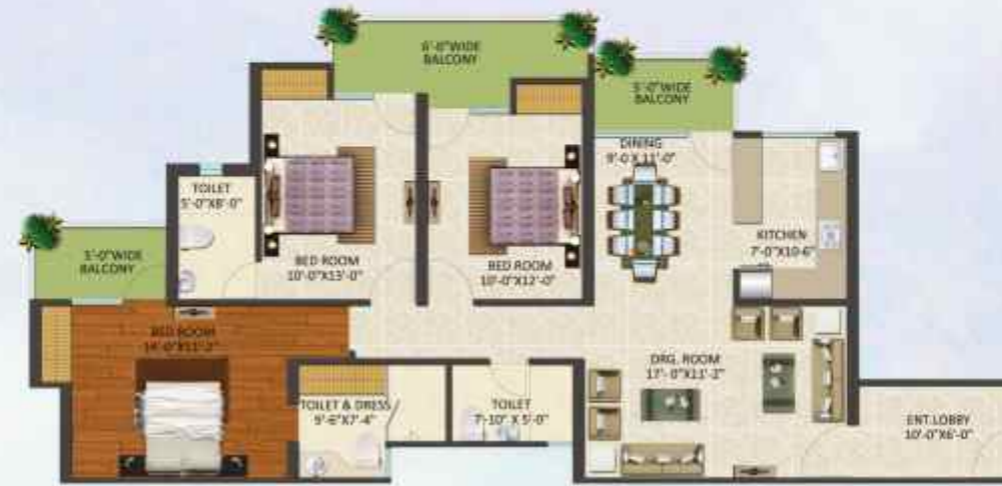
Super Area - 1820 sq. ft.