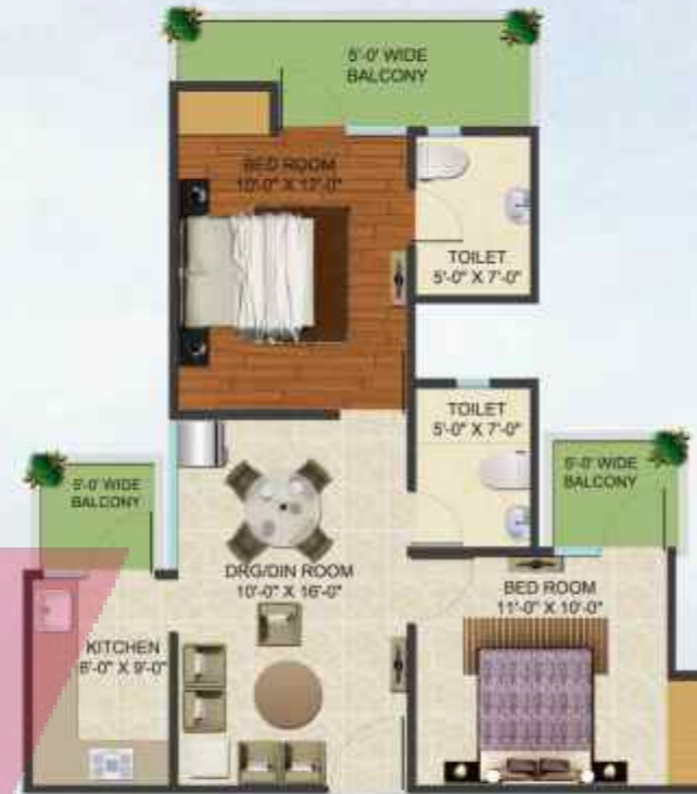
Super Area - 1000 sq. ft.