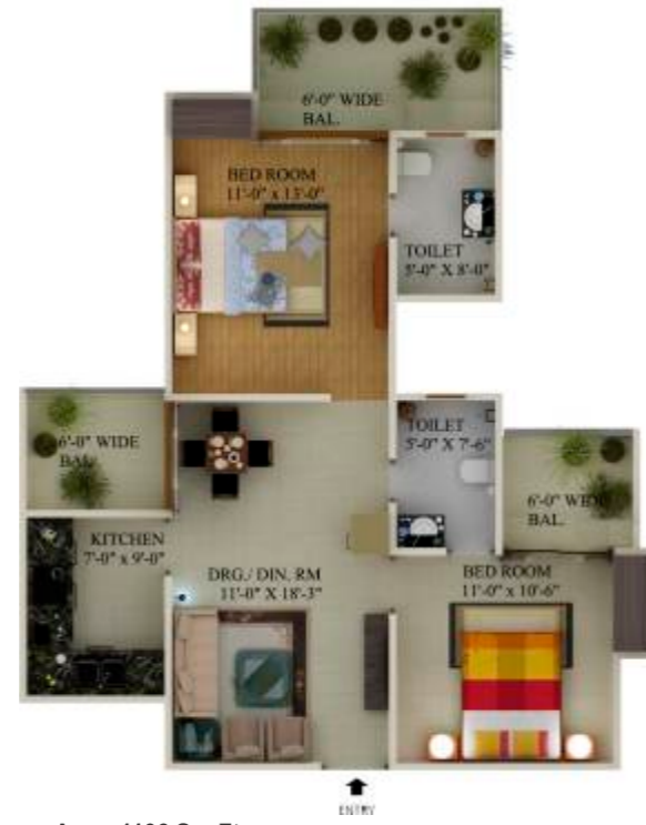
Area- 1106 Sq. Ft. 2 Bedroom, 2 Toilet, Kitchen, Dining. Drawing, 3 Balconies.