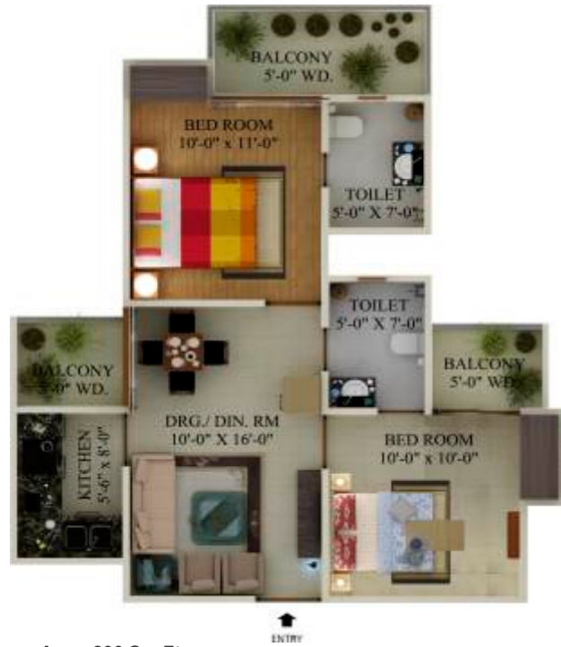
Area- 890 Sq. Ft. 2 Bedroom, 2 Toilet, Kitchen, Dining. Drawing, 3 Balconies.