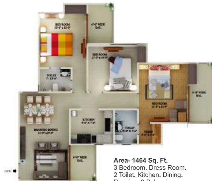
Area- 1464 Sq. Ft. 3 Bedroom, Dress Room. 2 Toilet, Kitchen, Dining. Drawing, 3 Balconies.