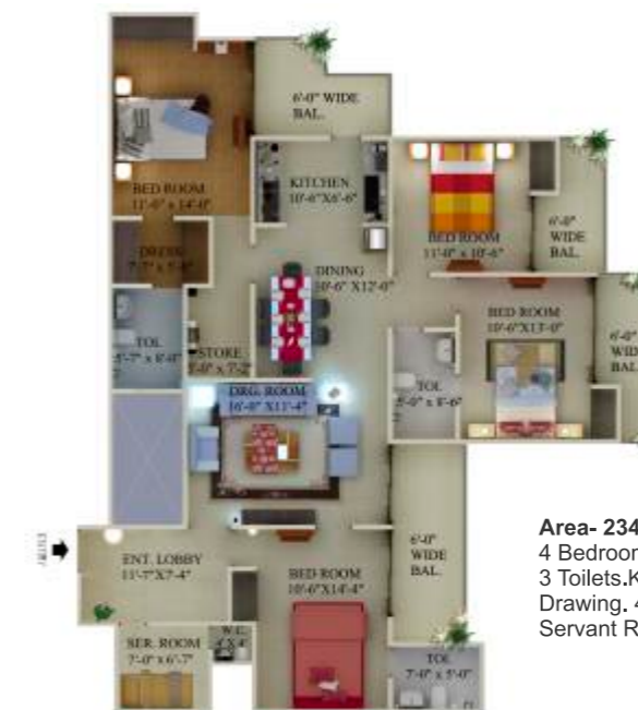
Area- 2344 Sq. Ft. 4 Bedroom, Dress Room 3 Toilets, Kitchen, Dining. Drawing, 4 Balconies. Servant Room