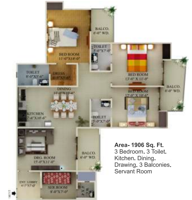
Area- 1906 Sq. Ft. 3 Bedroom, 3 Toilet. Kitchen, Dining. Drawing, 3 Balconies. Servant Room