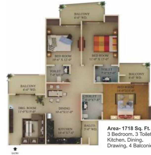
Area- 1718 Sq. Ft. 3 Bedroom, 3 Toilet. Kitchen, Dining. Drawing, 4 Balconies.