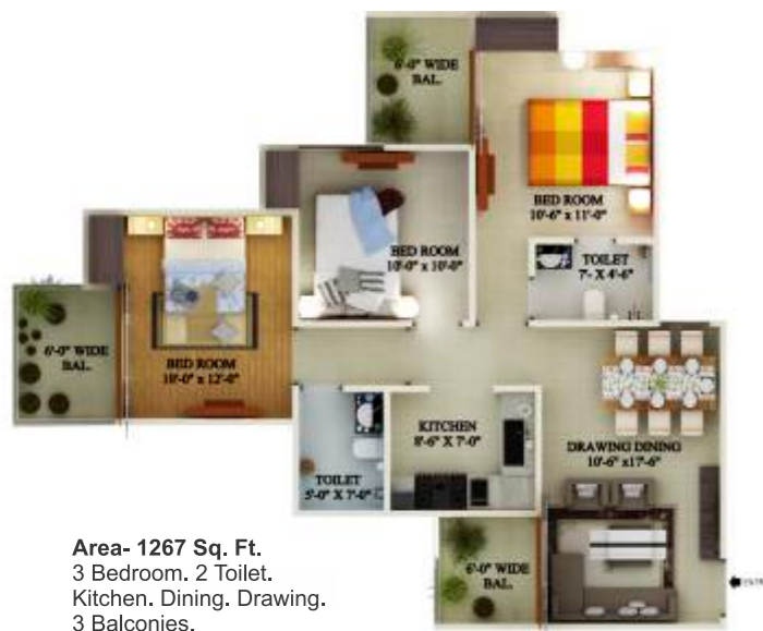
Area- 1267 Sq. Ft. 3 Bedroom, 2 Toilet. Kitchen, Dining, Drawing, 3 Balconies.