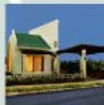
Sydney City, NSW, New Zealand