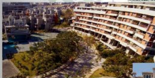
The Woods, Wakoli, Pune