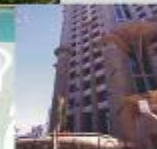
Mahindra Skyline, Mumbai