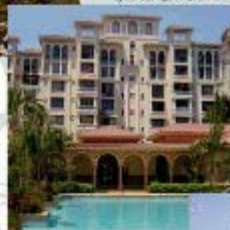
Mahindra Gardens, Mumbai