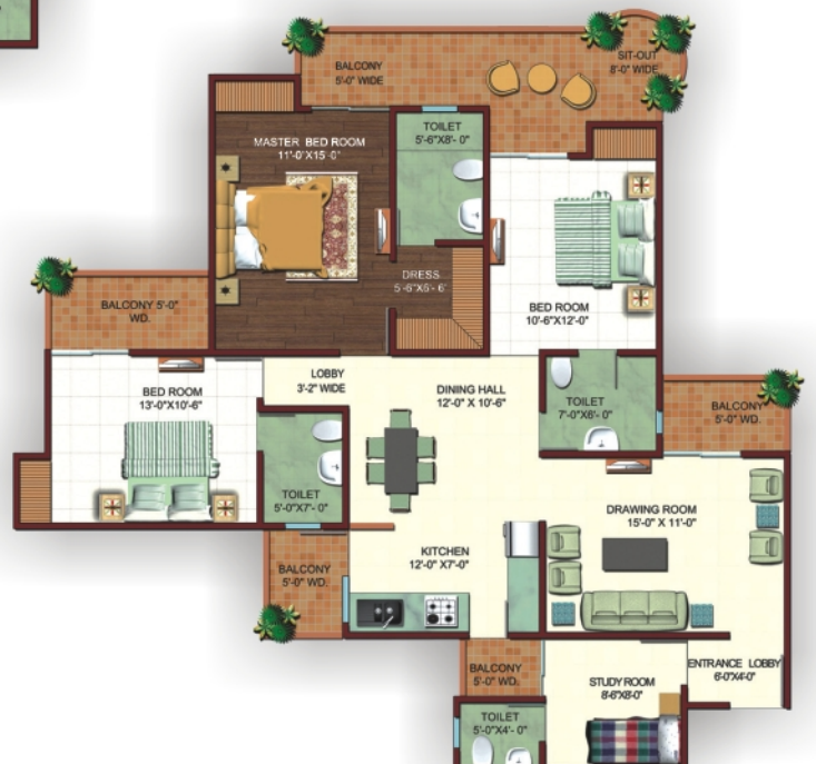
TYPE-7 3 BHK + Study + 4 Toilet + Dress/ Store + Entrance Lobby Super Area - 1995 sq. ft. Built-up Area – 1557 sq. ft. In Tower J