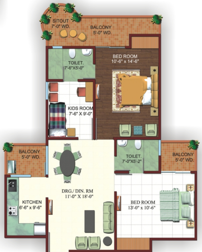
TYPE-2 2 BHK + 2 Toilet + Kids Room Super Area – 1255 sq. ft. Built-up Area – 979 sq. ft. In Tower D/ G/ H