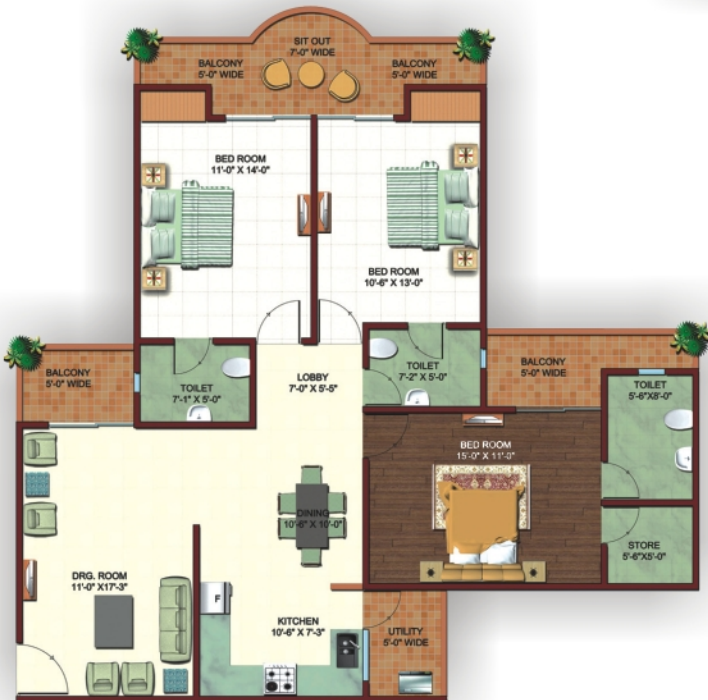
TYPE-6 3 BHK + 3 Toilet + Store Super Area – 1795 sq. ft. Built-up Area – 1400 sq. ft. In Tower J/ K