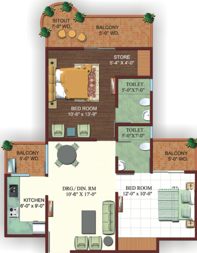
TYPE-1 2 BHK + 2 Toilet + Store Super Area – 1095 sq. ft. Built-up Area – 854 sq. ft. In Tower A/ B/ C