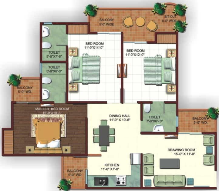
TYPE-4 3 BHK + 3 Toilet Super Area – 1650 sq. ft. Built-up Area – 1287 sq. ft. In Tower K