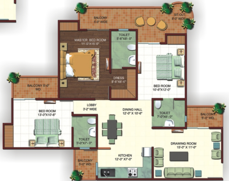
TYPE-5 3 BHK + 3 Toilet + Dress Super Area – 1795 sq. ft. Built-up Area – 1400 sq. ft. In Tower J