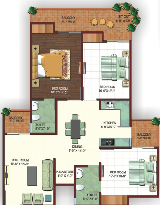
TYPE-3 3 BHK + 2 Toilet + Puja/ Store Super Area – 1475 sq. ft. Built-up Area – 1150 sq. ft. In Tower E/ F/ I