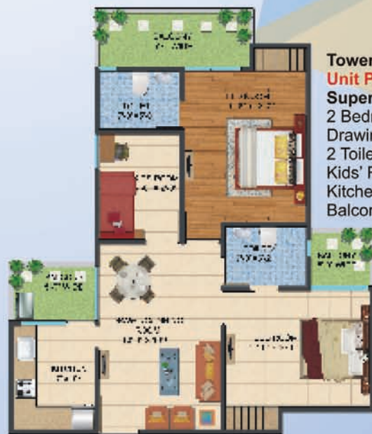
Tower-D, E, F, G, I Unit Plan Super Area= 1140 Sq.ft. 2 Bedroom Drawing/Dining 2 Toilet Kids' Room Kitchen Balcony