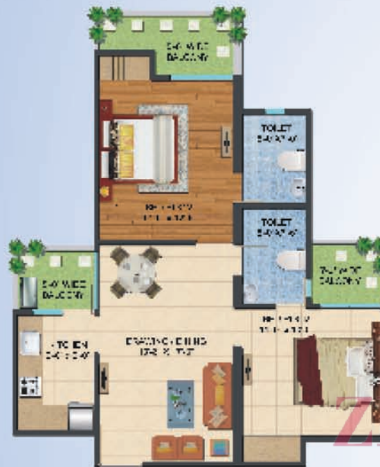
Tower-A Unit Plan Super Area= 995 Sq.ft. 2 Bedroom Drawing/Dining 2 Toilet Kitchen Balcony