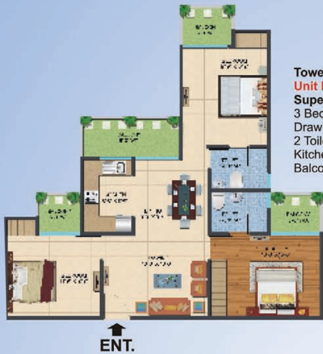
Tower-H, J Unit Plan Super Area= 1195 Sq.ft. 3 Bedroom Drawing/Dining 2 Toilet Kitchen Balcony