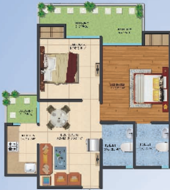
Tower-B Unit Plan Super Area= 875 Sq.ft. 2 Bedroom Drawing/Dining 2 Toilet Kitchen Balcony