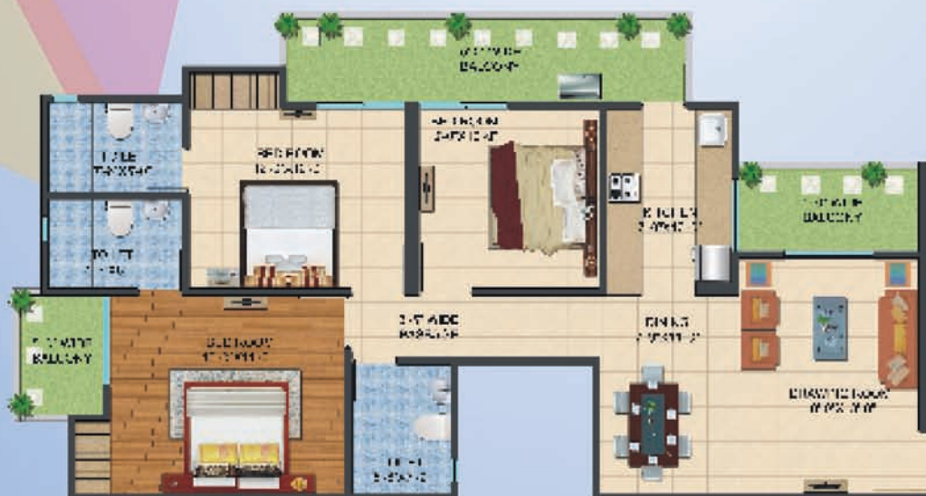
Tower-D, G Unit Plan Super Area= 1500 Sq.ft. 3 Bedroom Drawing/Dining 3 Toilet Kitchen Balcony