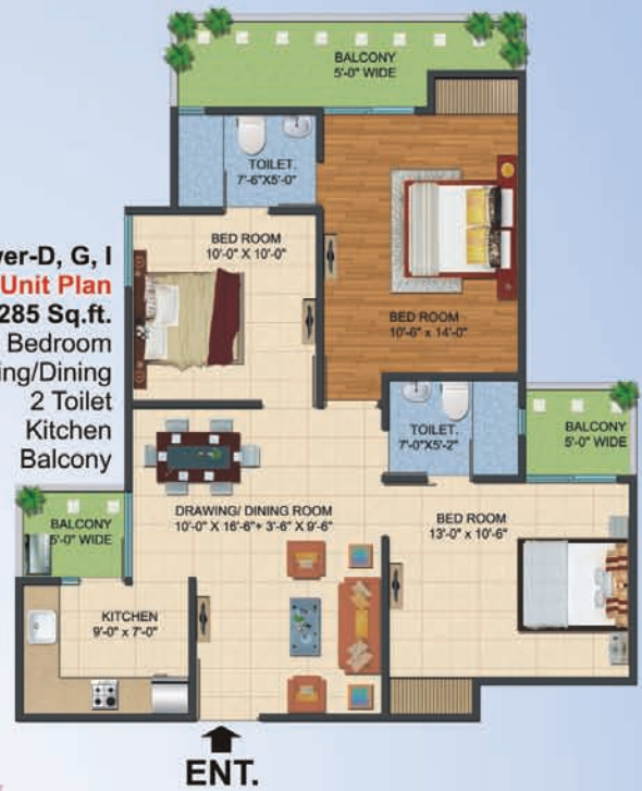
Tower-D, G, I Unit Plan Super Area= 1285 Sq.ft. 3 Bedroom Drawing/Dining 2 Toilet Kitchen Balcony