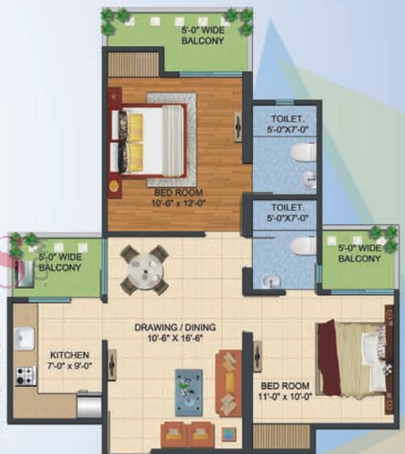
Tower-E, F Unit Plan Super Area= 995 Sq.ft. (Type-2) 2 Bedroom Drawing/Dining 2 Toilet Kitchen Balcony