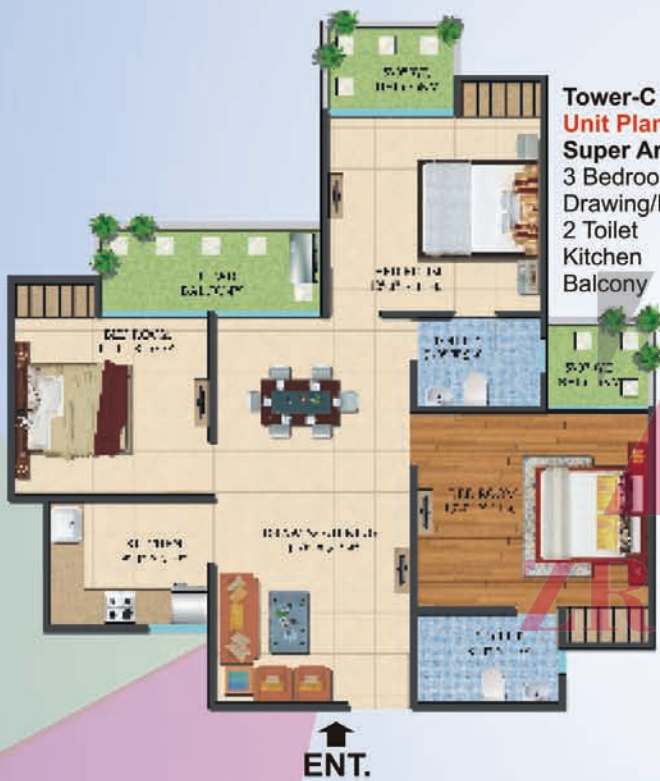
Tower-C Unit Plan Super Area= 1295 Sq.ft. 3 Bedroom Drawing/Dining 2 Toilet Kitchen Balcony