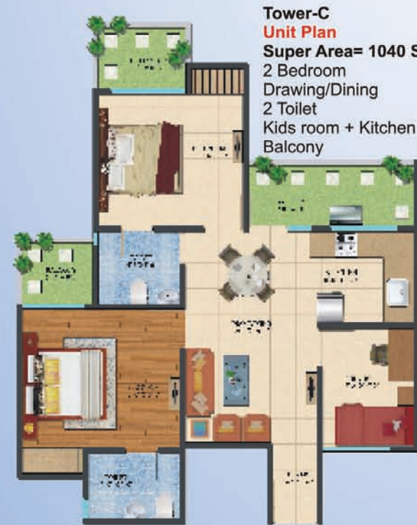
Tower-C Unit Plan Super Area= 1040 Sq.ft. 2 Bedroom Drawing/Dining 2 Toilet Kids room + Kitchen Balcony