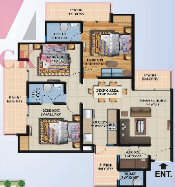
Tower-H, J Unit Plan Super Area 1495 Sq.ft. 3 Bedroom Drawing/Dining 3 Toilet Kitchen Balcony