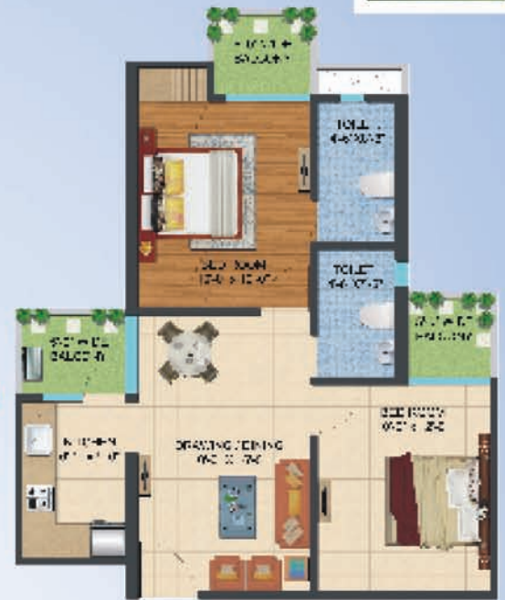
Tower-Q Unit Plan Super Area= 880 Sq.ft. 2 Bedroom Drawing/Dining 2 Toilet Kitchen Balcony