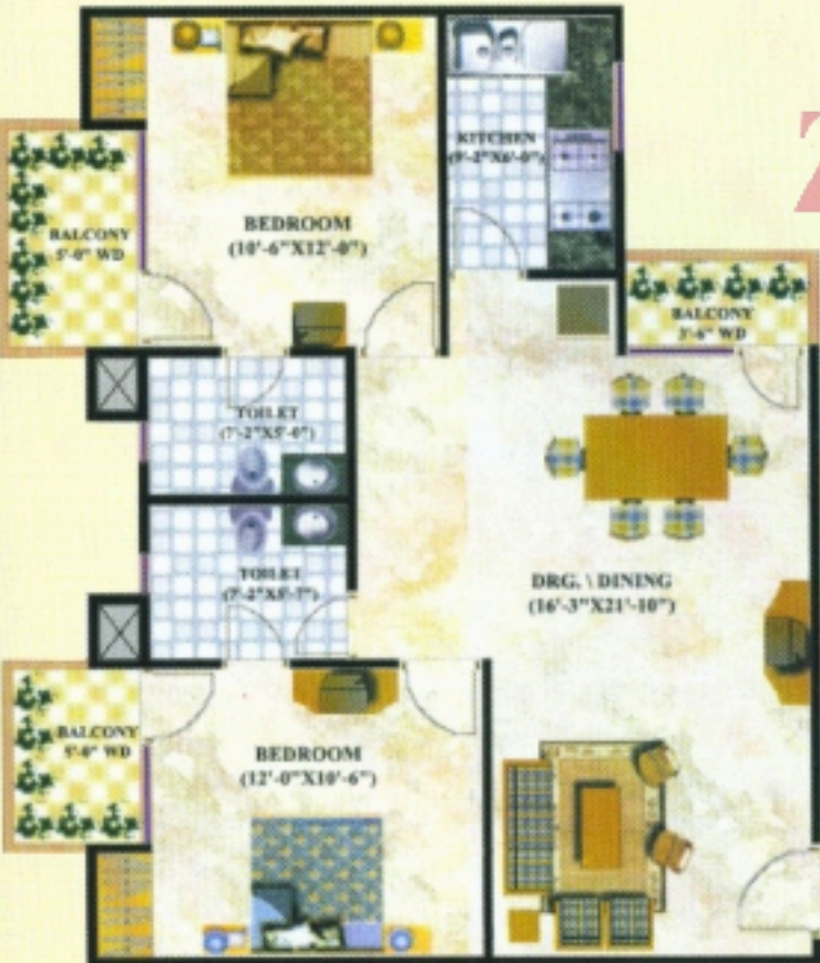
Flat No. 9 Super Area : 1081 sq.ft.