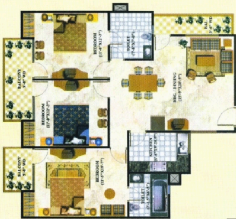
Flat No. 1 Super Area : 1400 sq.ft.