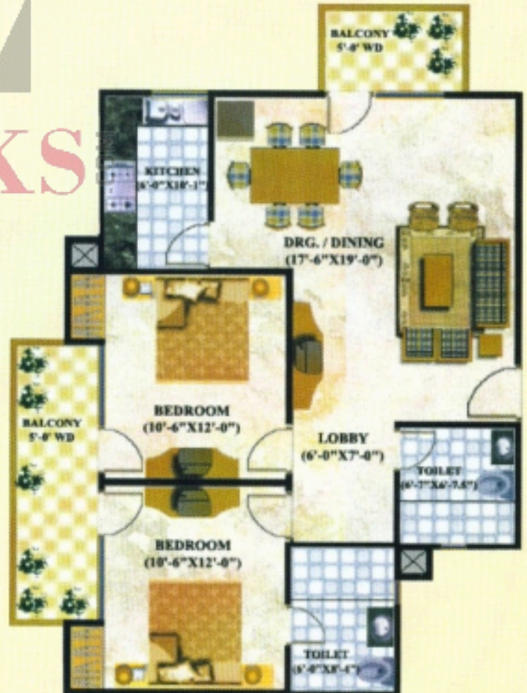
Flat No. 11 Super Area : 1148 sq.ft.