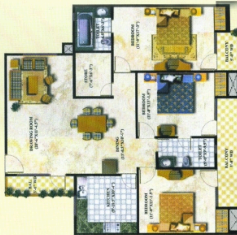
Flat No. 5 Super Area : 1713 sq.ft.