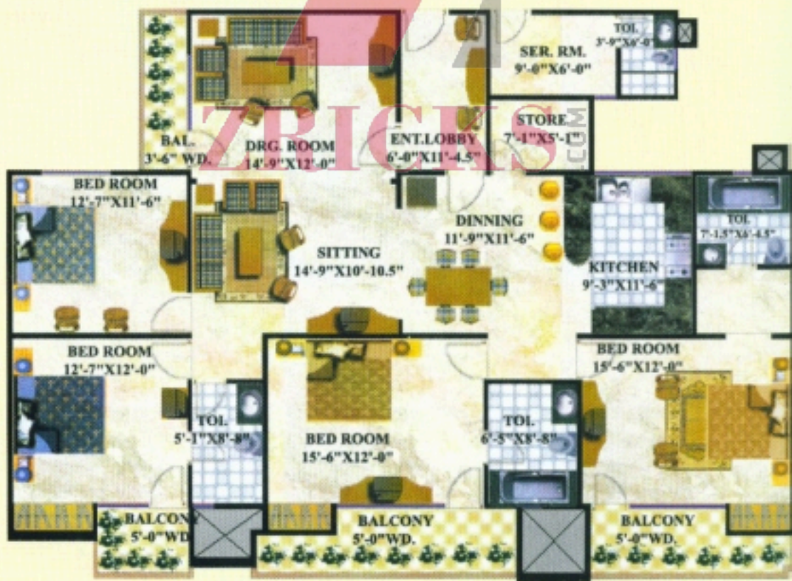
Flat No. 6 Super Area : 2477 sq.ft.