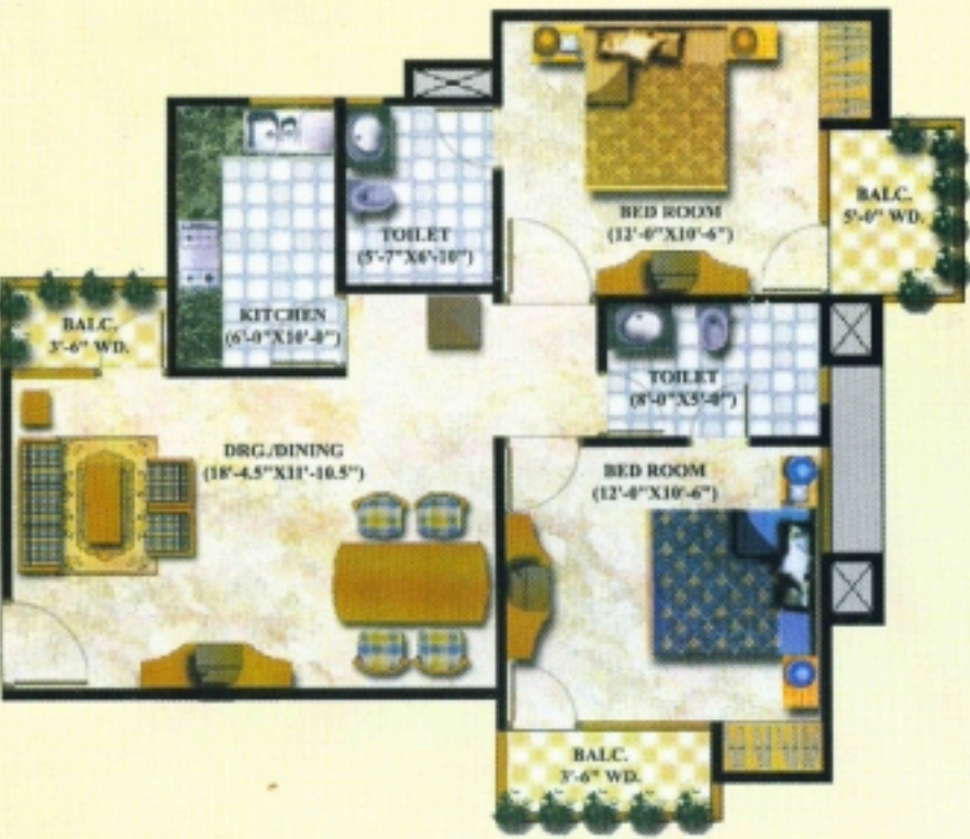
Flat No. 16 Super Area : 986 sq.ft.