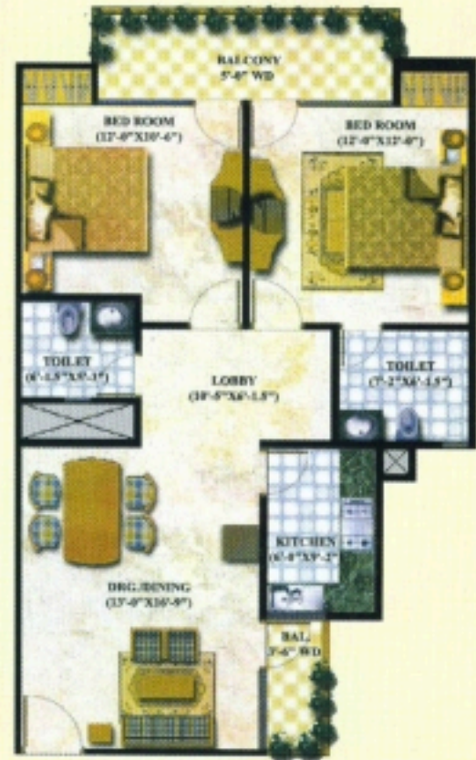
Flat No. 12 Super Area : 1081 sq.ft.