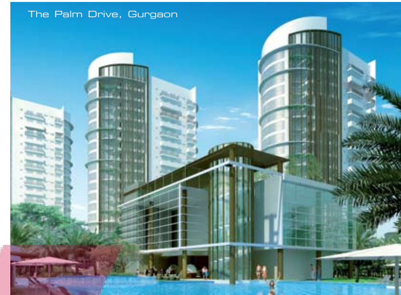
The Palm Drive, Gurgaon

India's premier real estate and infrastructure development company, Emaar MGF has brought in one of the largest FDI in the Indian real estate sector and is engaged in pan-India projects in the Residential, Commercial; IT Parks & SEZs, Retail, Hospitality, Healthcare and Education sectors.