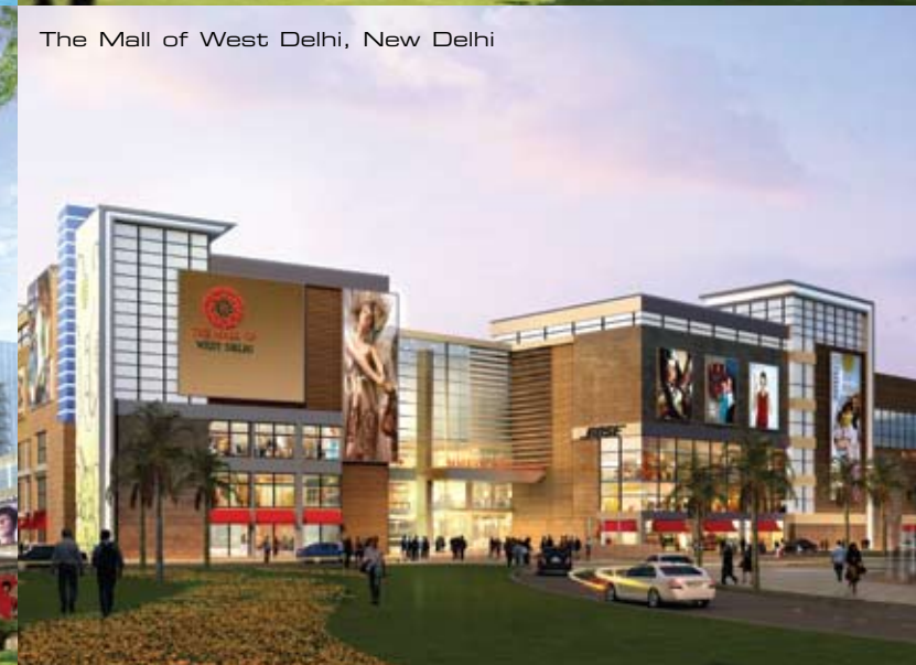
The Mall of West Delhi, New Delhi