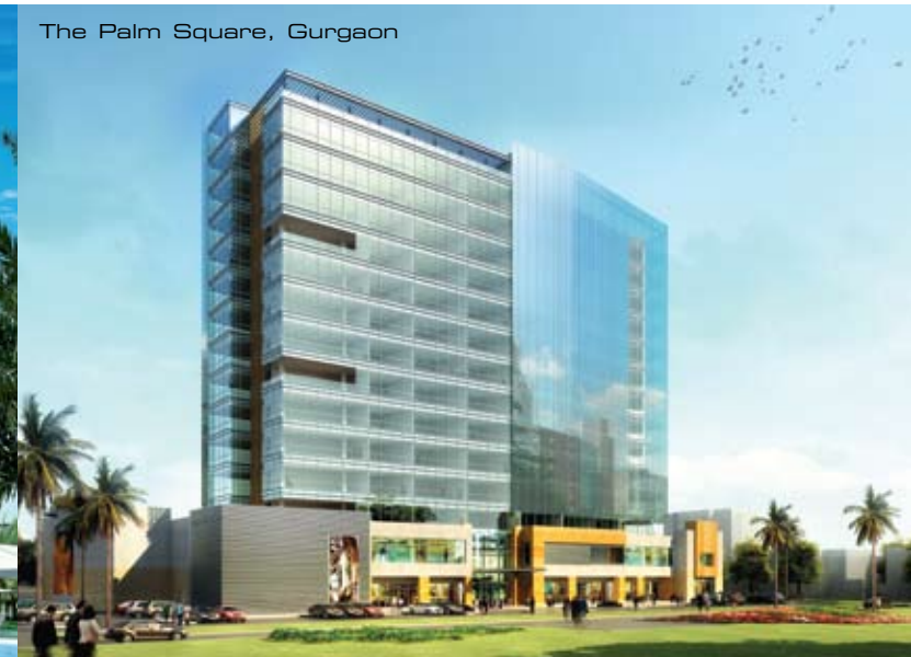
The Palm Square, Gurgaon