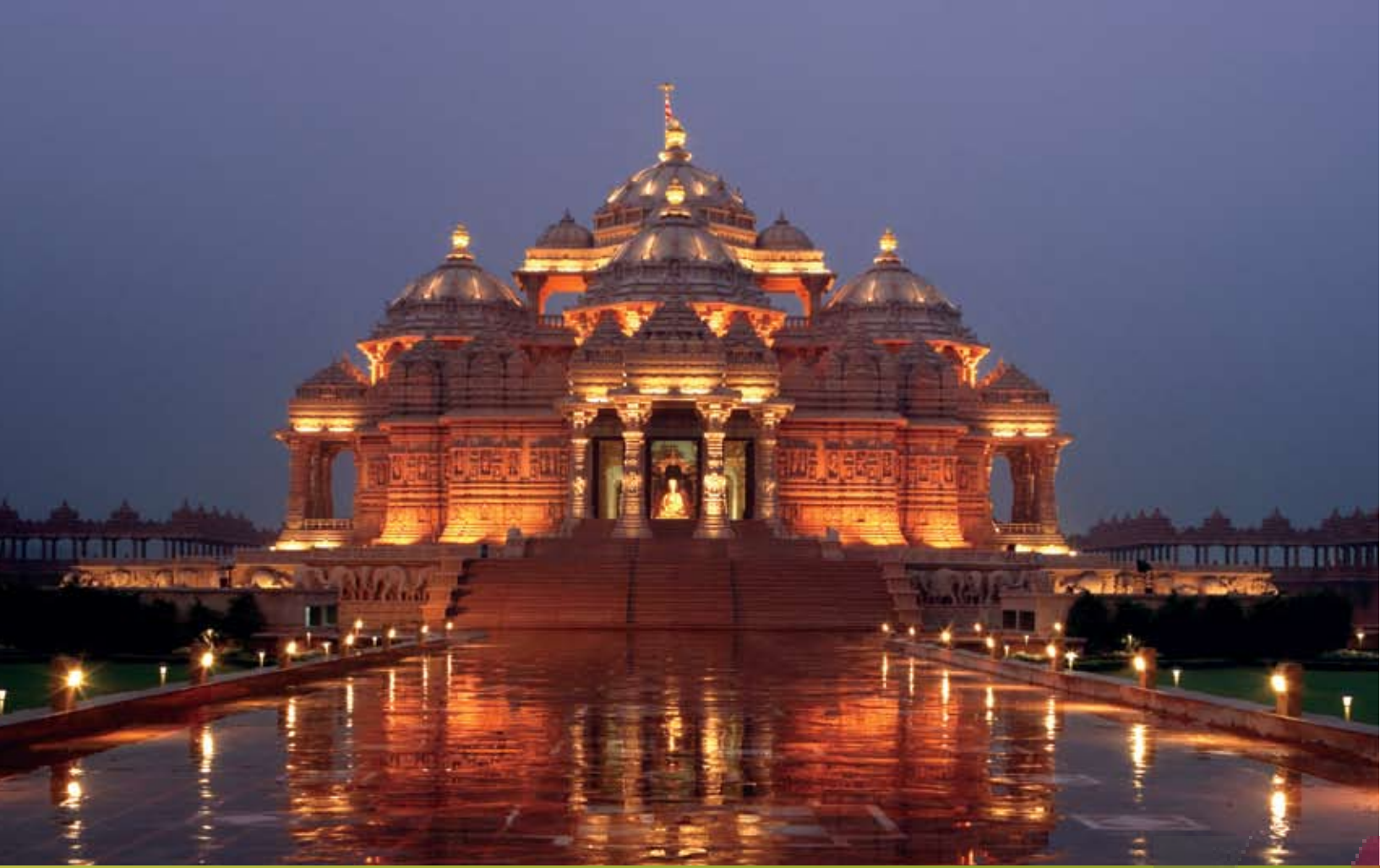
Akshardham Temple, Delhi