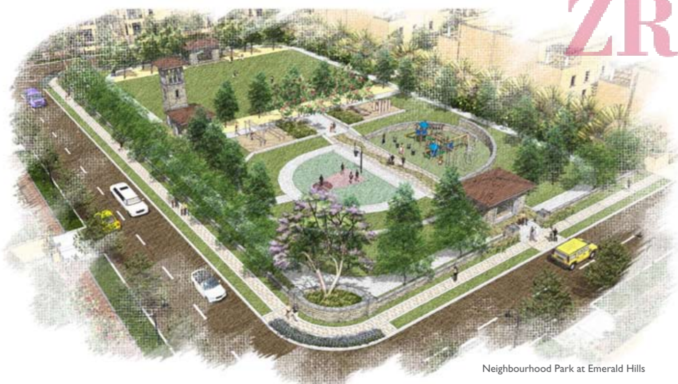
Neighbourhood Park at Emerald Hills

1 sq. mtr. = 1.196 sq. yds. & 1 sq. mtr. = 10.76 sq. ft. In the interest of maintaining high standards, all floor plans, layout plans, areas, dimensions and specifications are indicative and are subject to change as decided by the company or by any competent authority. Soft furnishing, cupboards, furniture and gadgets are not part of the offering.