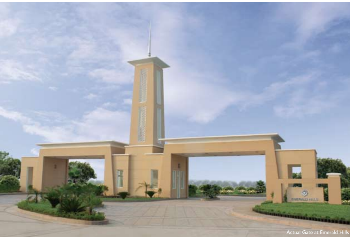
Actual Gate at Emerald Hills

Presenting 'Exclusive Plots' at Emerald Hills. Because an exclusive lifestyle needs an exclusive address.