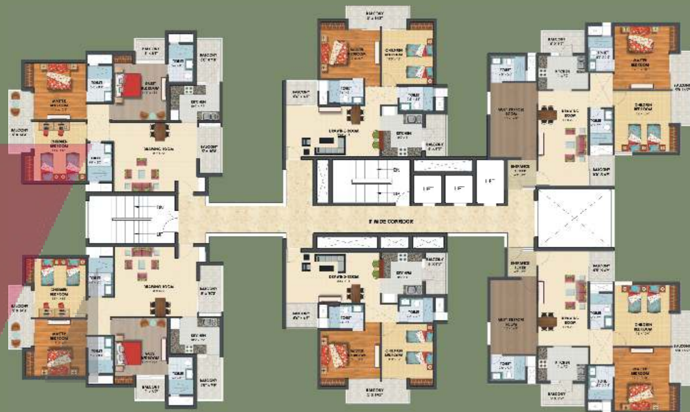
Cluster Plan - G