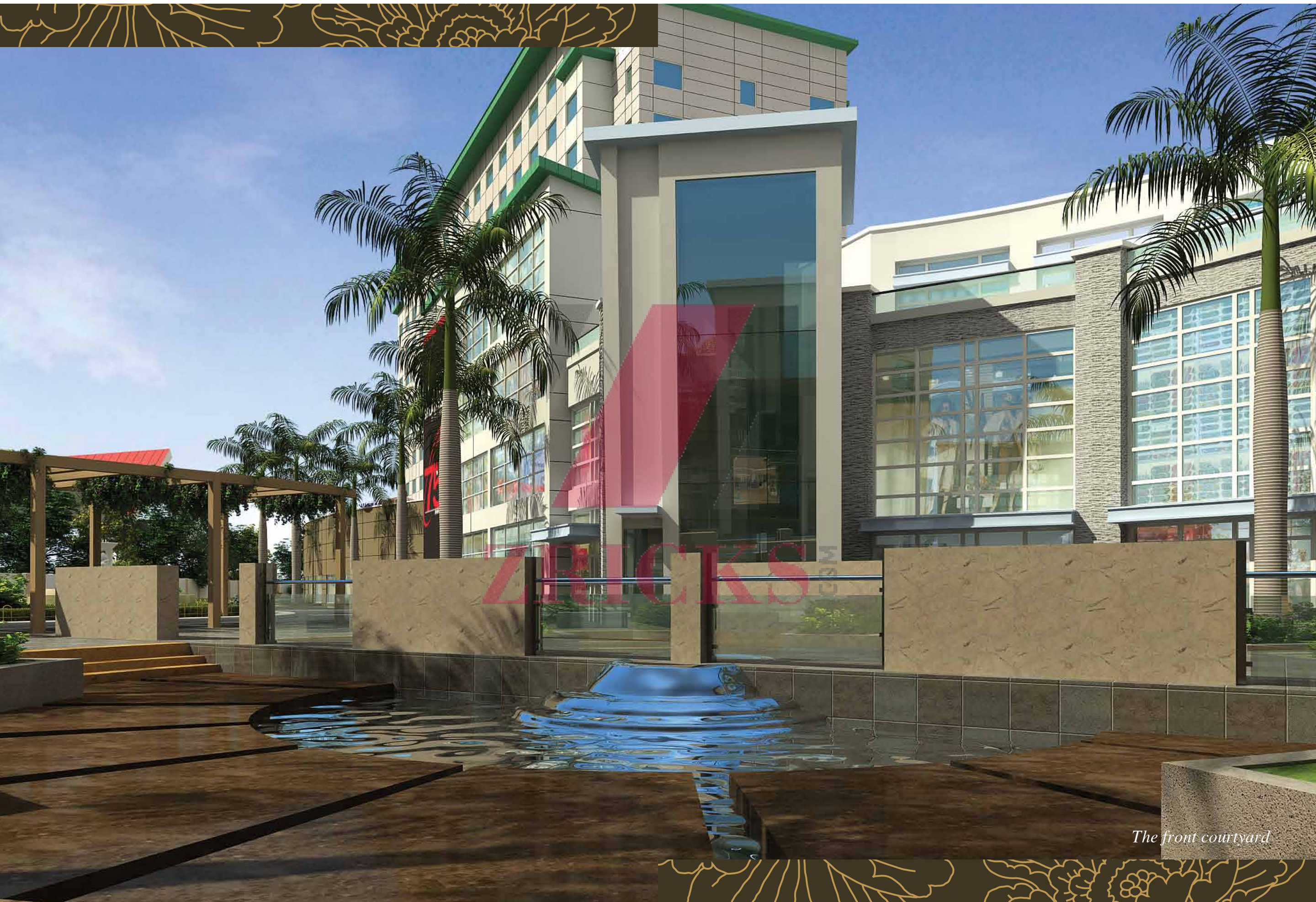
The front courtyard