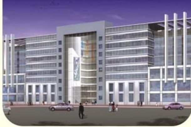
Amrapali IMT Manesar, Gurgaon