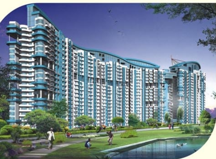
Amrapali Platinum, Noida

In the last couple of years Amrapali Groups has contributed in the phenomenal growth of real estate and infrastructure industry with many turnkey solutions through multifaceted residential complexes. Amrapali Group has been associated with the legendary Architect Hafeez Contractor for its project designing process. This has resulted in the transformation of its projects - Amrapali Green, Amrapali Royal, Amrapali Village, Amrapali Awadh, Amrapali Vaishali & Amrapali Exotica Apartments into landmarks.