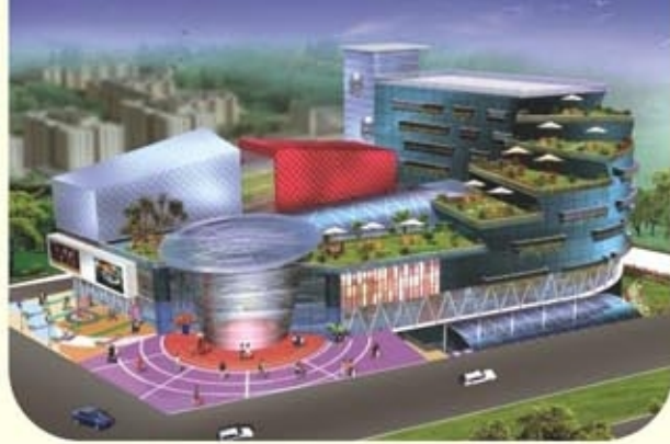
Amrapali Mall, Vrindavan