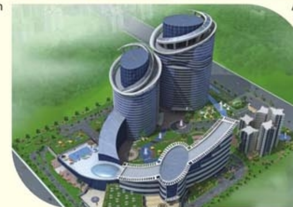
Amrapali Tech-Park, Greater Noida