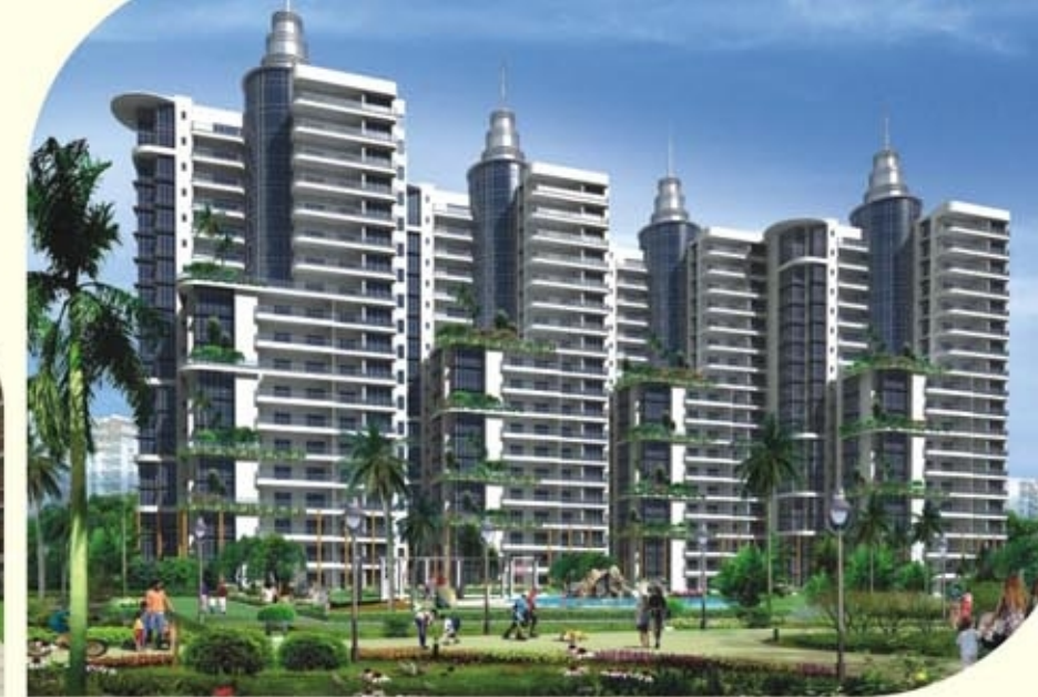
Amrapali Eden Park, Noida