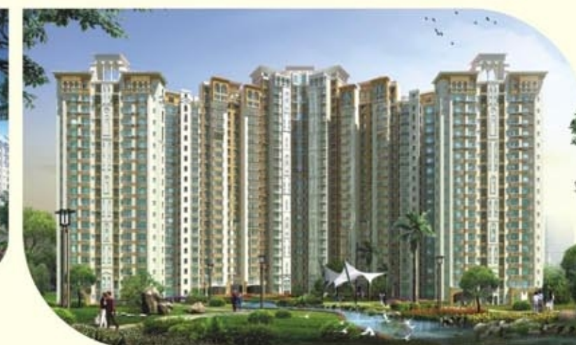
Amrapali Sapphire, Noida

20 Cities 30 Projects SPREADING SMILES ACROSS INDIA