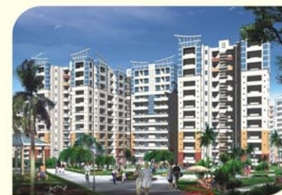
Amrapali Village, Indirapuram