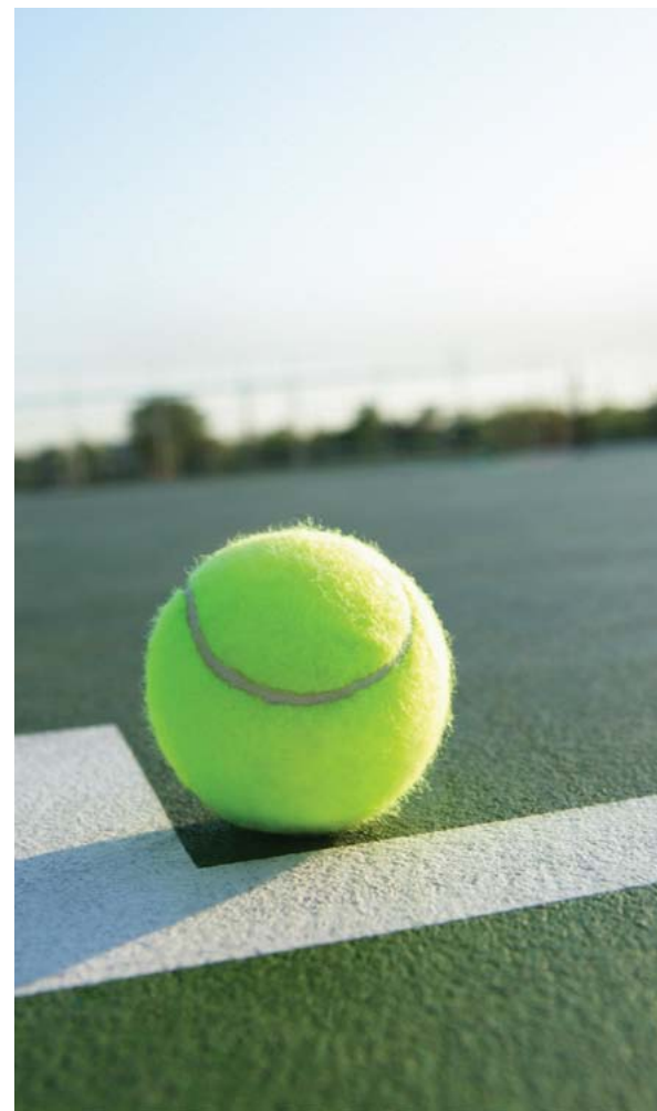
Sports facilities with Tennis Courts, Half court basketball, Table tennis & Badminton courts