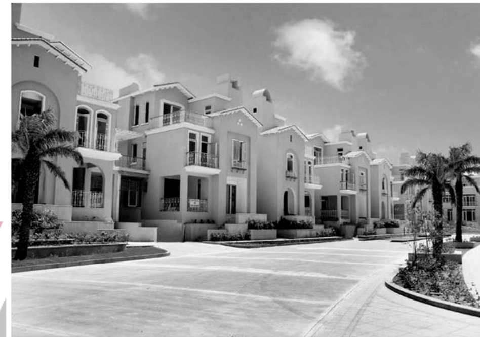
THE PALM SPRINGS, GURGAON