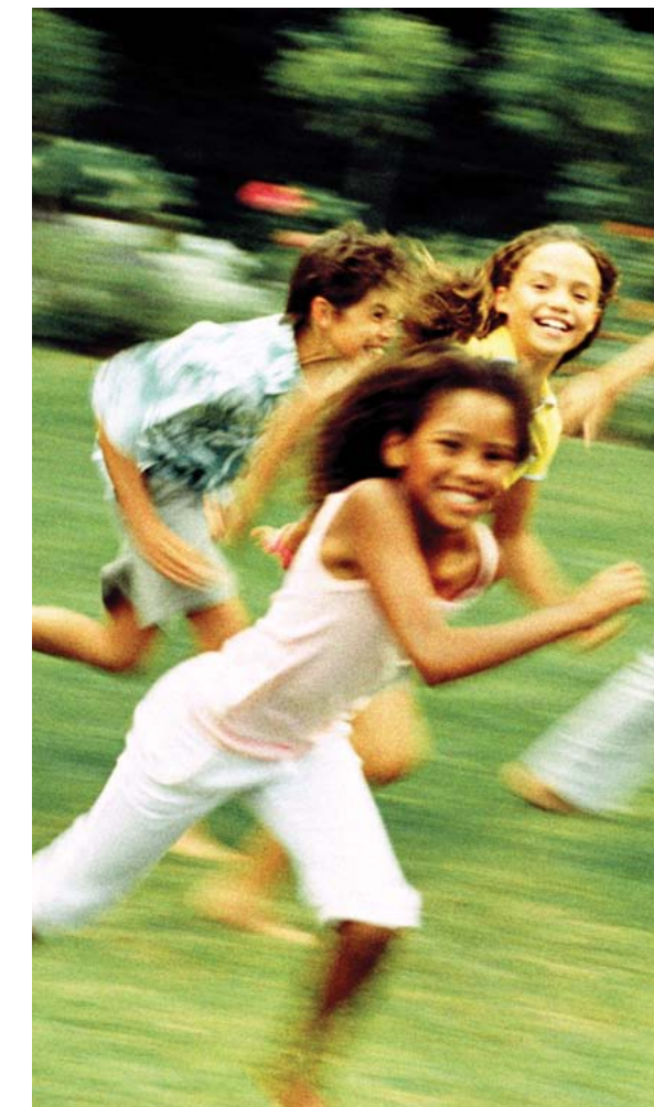
Children's play area