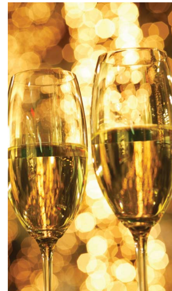
Club with lounge, Recreation room, Multi Community hall / function lounge