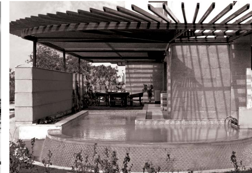
THE PRANAYAM, FARIDABAD