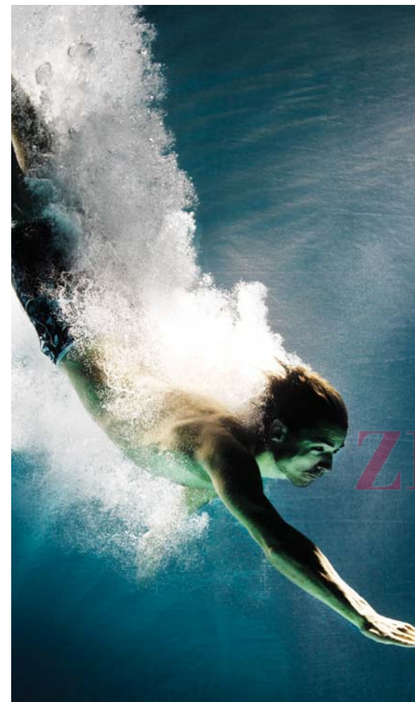
Expansive. L - shaped pool & kids' pool.