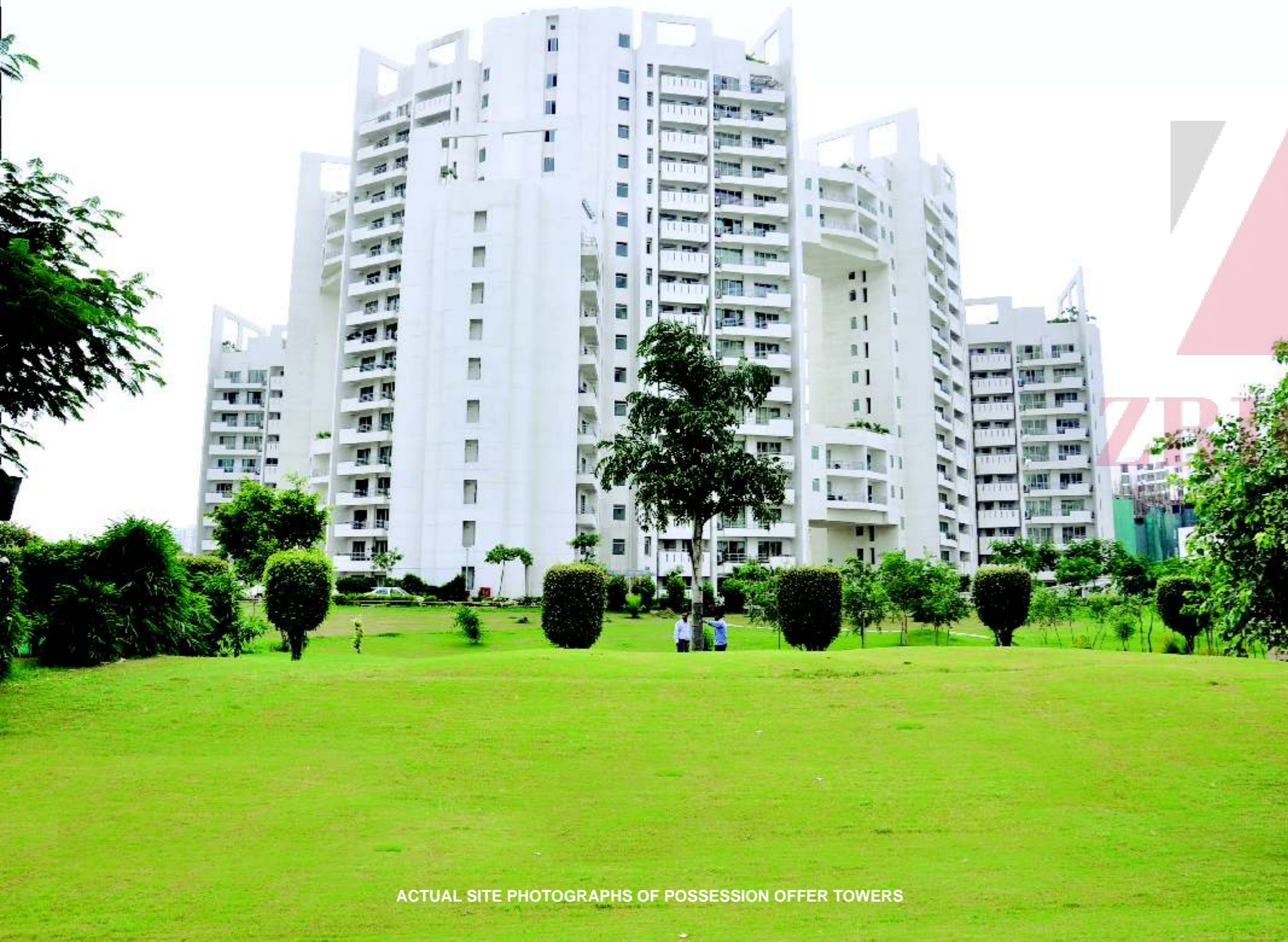
ACTUAL SITE PHOTOGRAPHS OF POSSESSION OFFER TOWERS