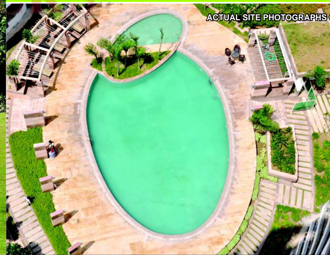
ACTUAL SITE PHOTOGRAPHS OF POSSESSION OFFER TOWERS