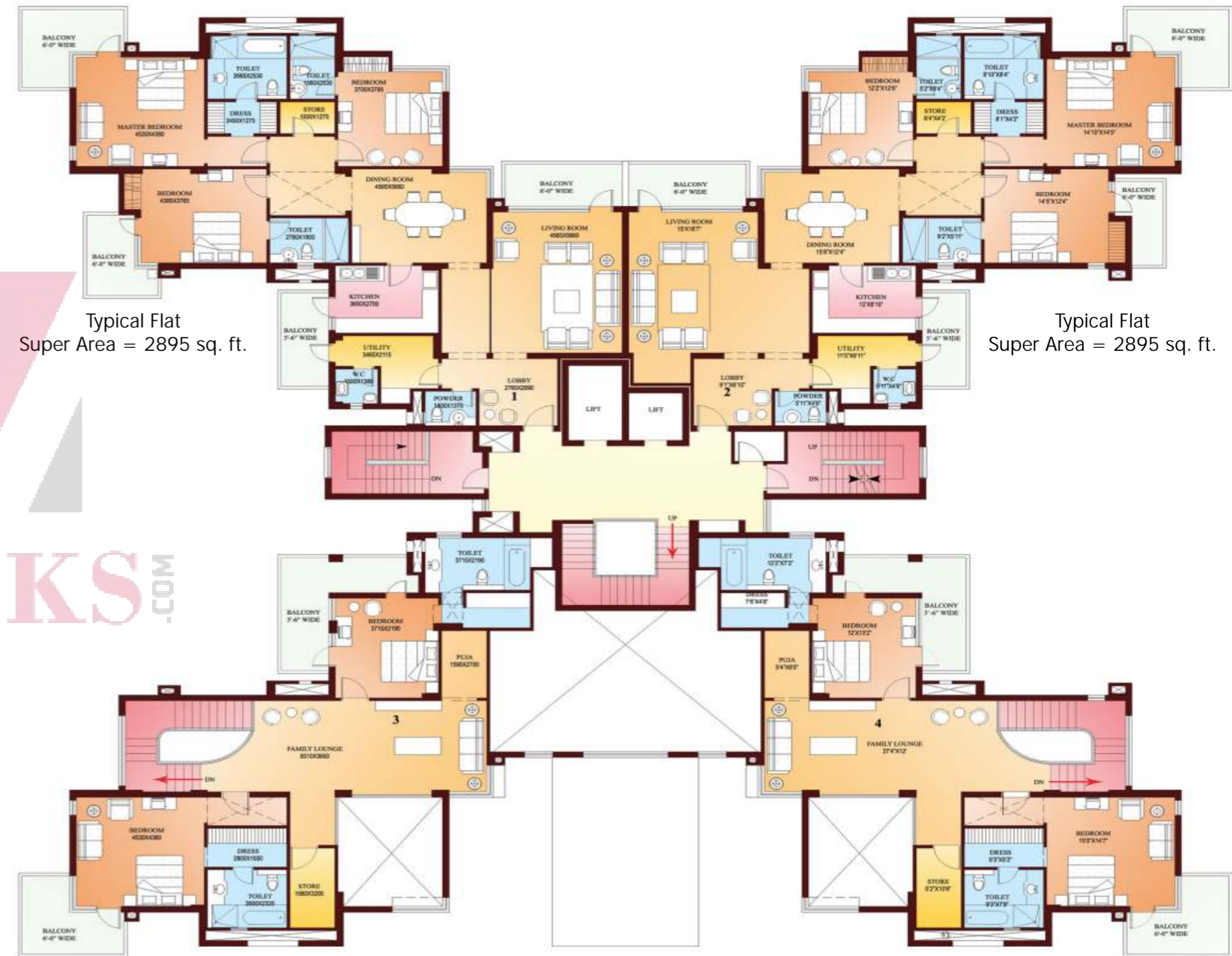
Typical Flat Super Area = 2895 sq. ft.