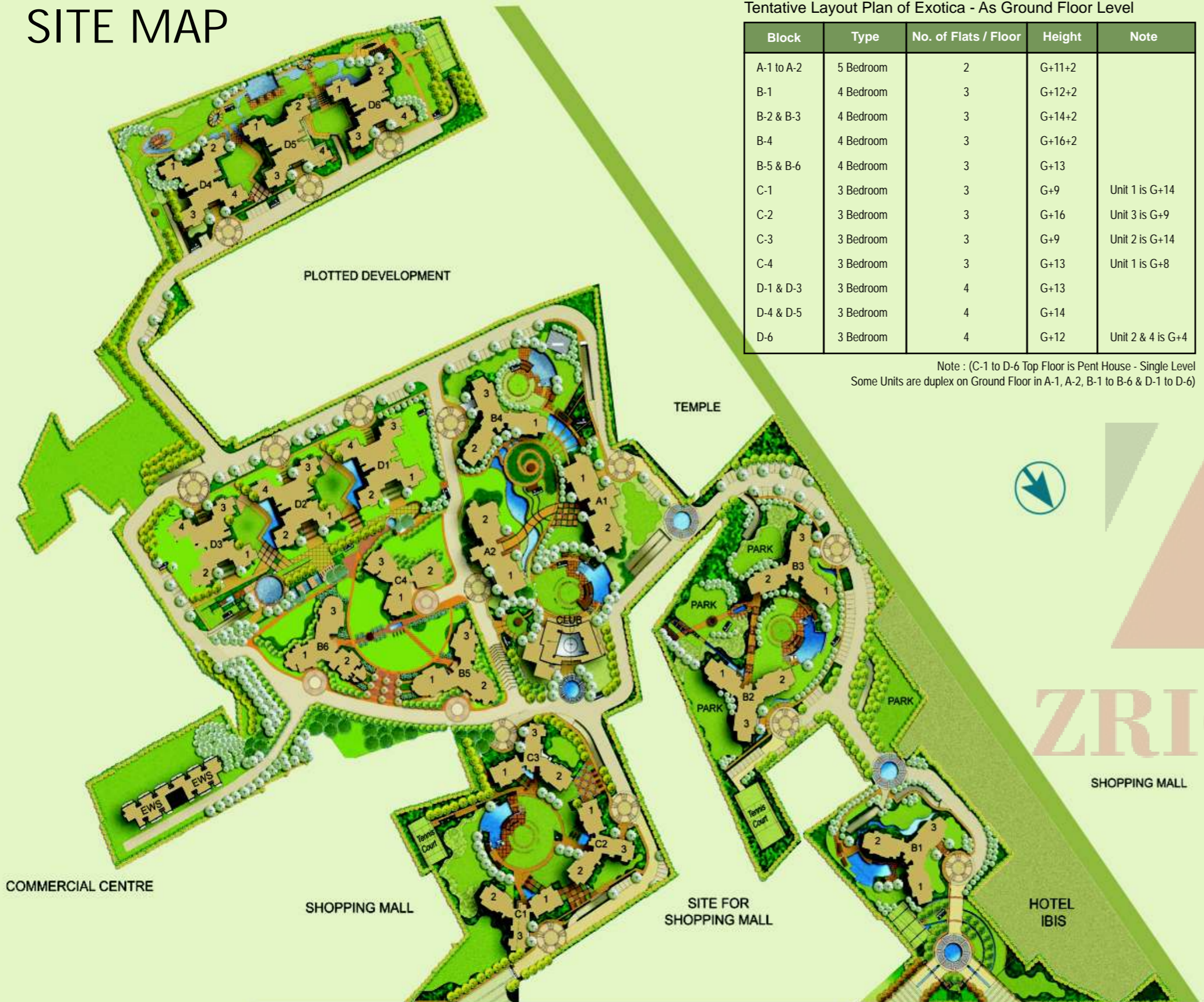
Tentative Layout Plan of Exotica - As Ground Floor Level