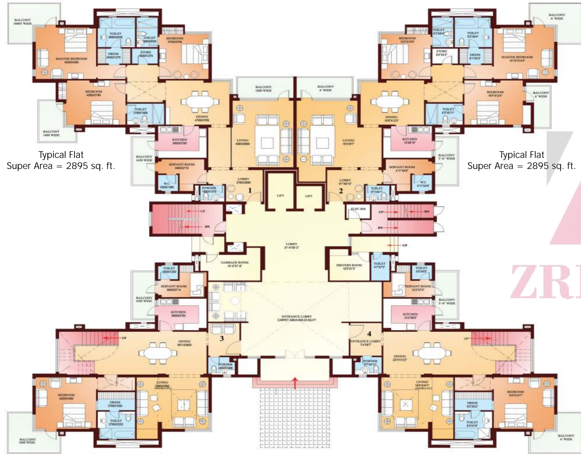
Typical Flat Super Area = 2895 sq. ft.