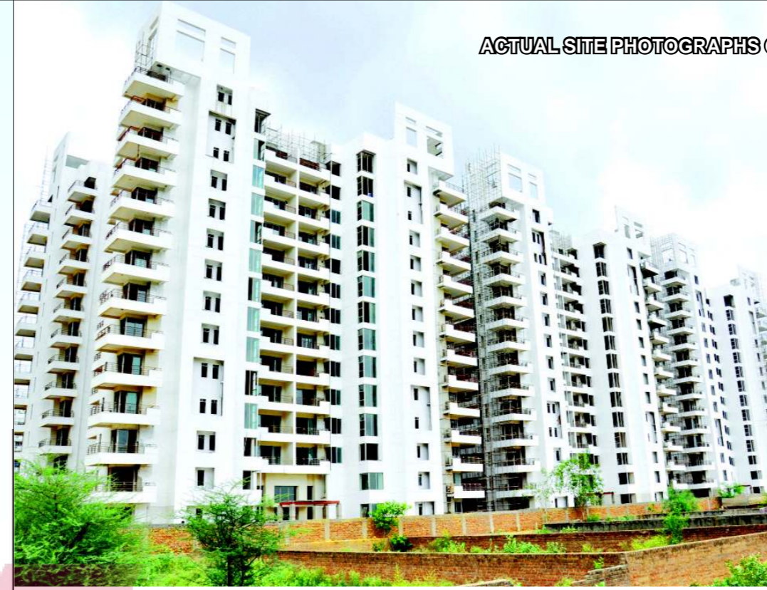
ACTUAL SITE PHOTOGRAPHS OF POSSESSION OFFER TOWERS