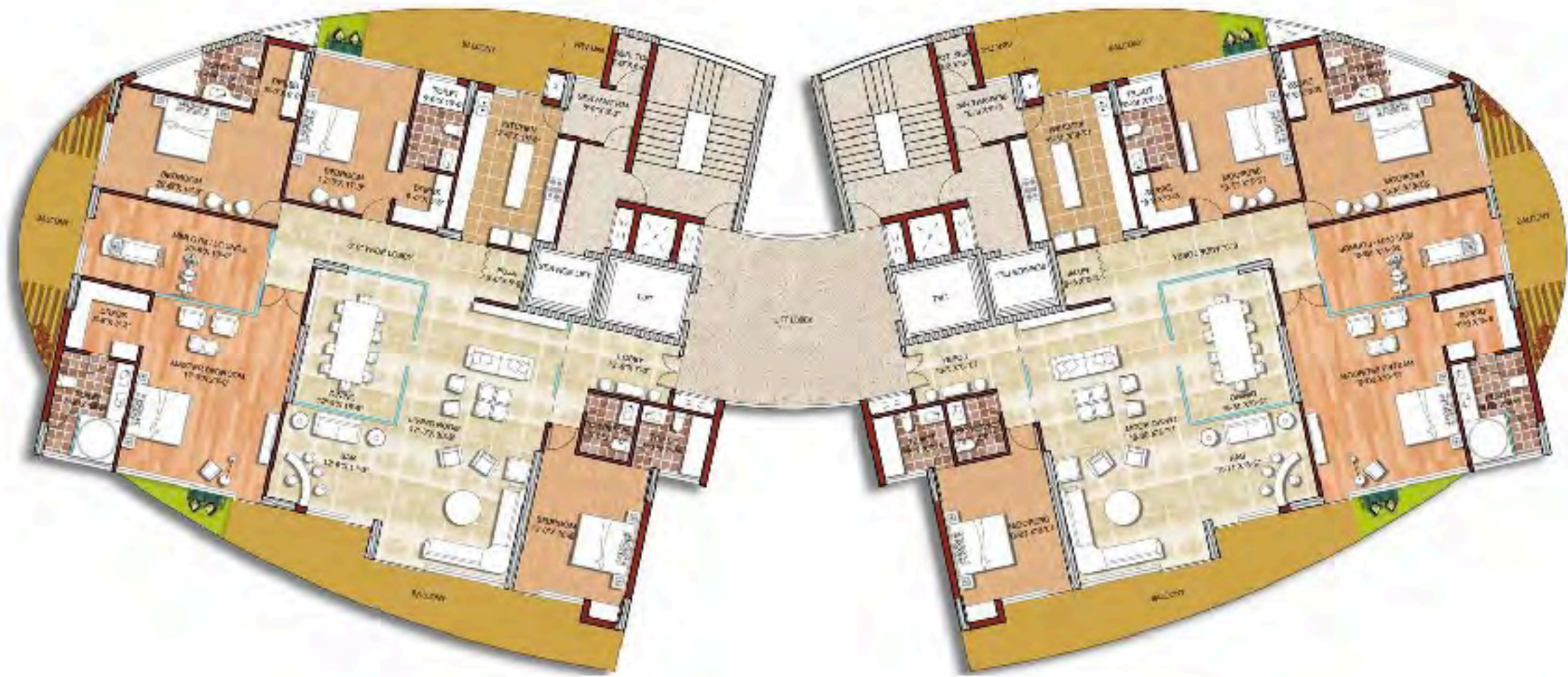
4 BHK APARTMENT PLAN 5450 SQ. FT.- 36 APARTMENTS IN EACH TOWER