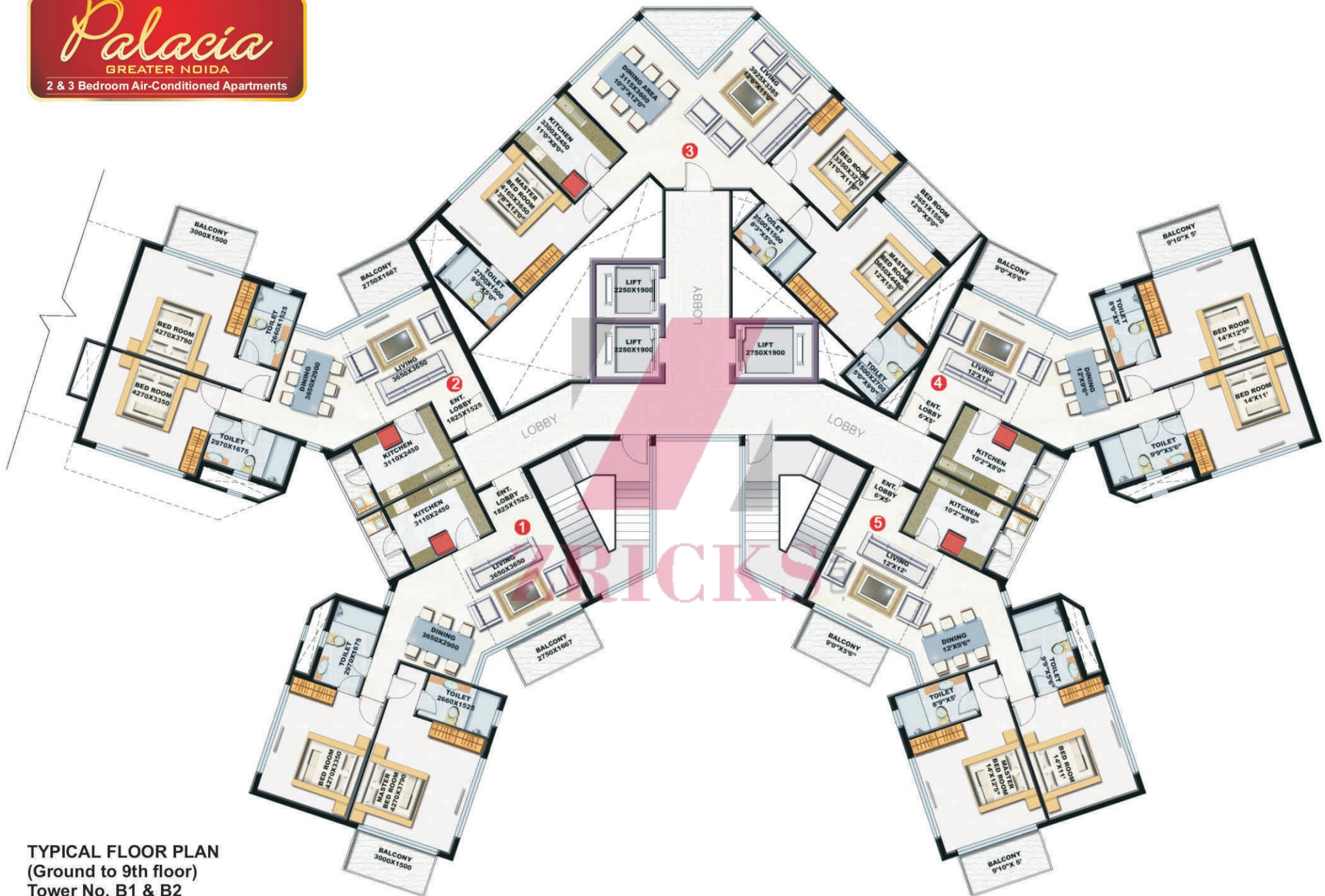
TYPICAL FLOOR PLAN (Ground to 9th floor) Tower No. B1 & B2 Accomodation : 2 Bedroom & 3 Bedroom Area : 2 Bedroom - 1320 sq. ft. 3 Bedroom - 1710 sq. ft.