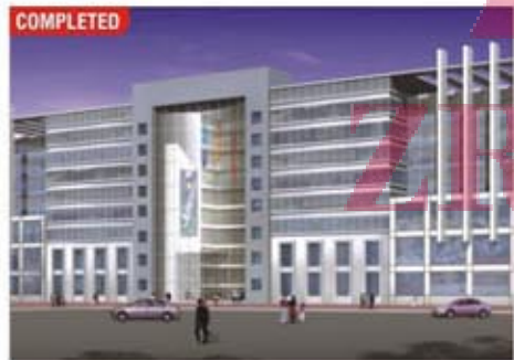
Amrapali IMT Manesar, Gurgaon