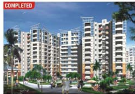
Amrapali Village, Indirapuram