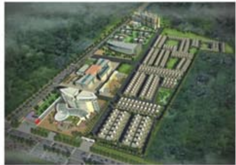
Amrapali Vananchal City - Bhilai