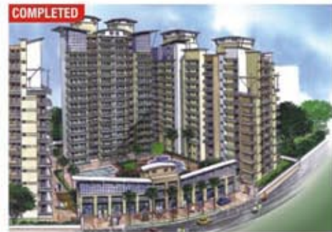
Amrapali Green, Indirapuram