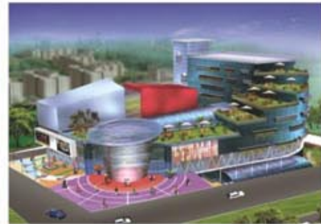
Amrapali Mall, Vrindavan