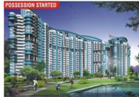
Amrapali Platinum, Noida