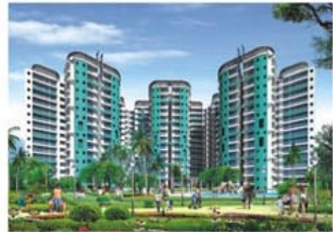
Amrapali Zodiac - Noida