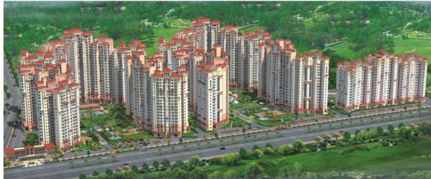
Amrapali Sapphire - Noida