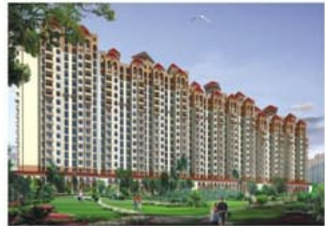
Amrapali Silicon City - Noida