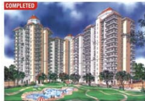
Amrapali Royal, Indirapuram