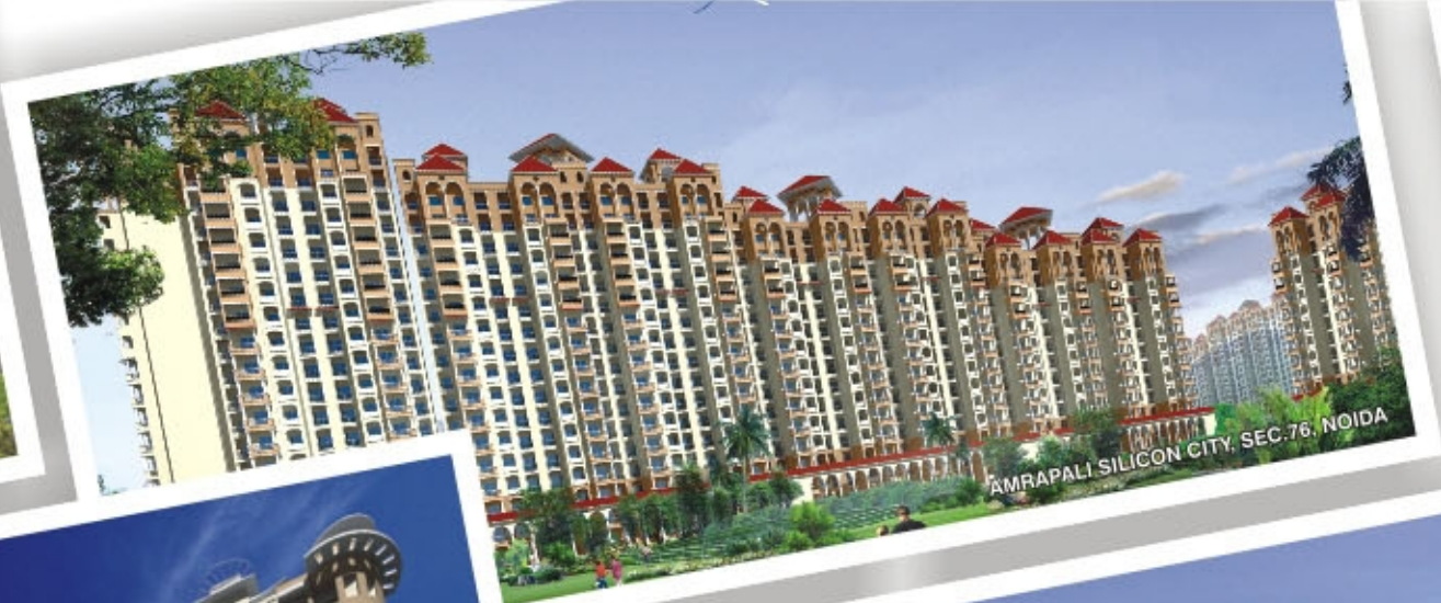
AMRAPALI SILICON CITY, SEC. 76, NOIDA