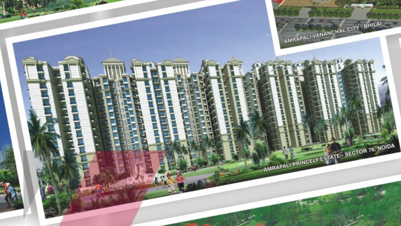
AMRAPALI PRINCELY ESTATE - SECTOR 76, NOIDA