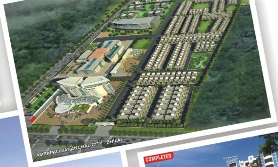
AMRAPALI VANANCHAL CITY - BHILAI