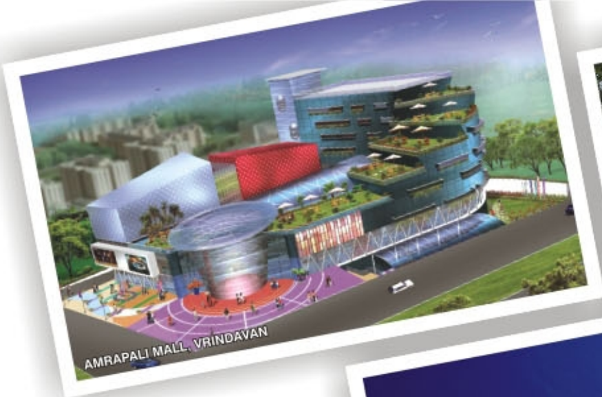
AMRAPALI MALL, VRINDAVAN