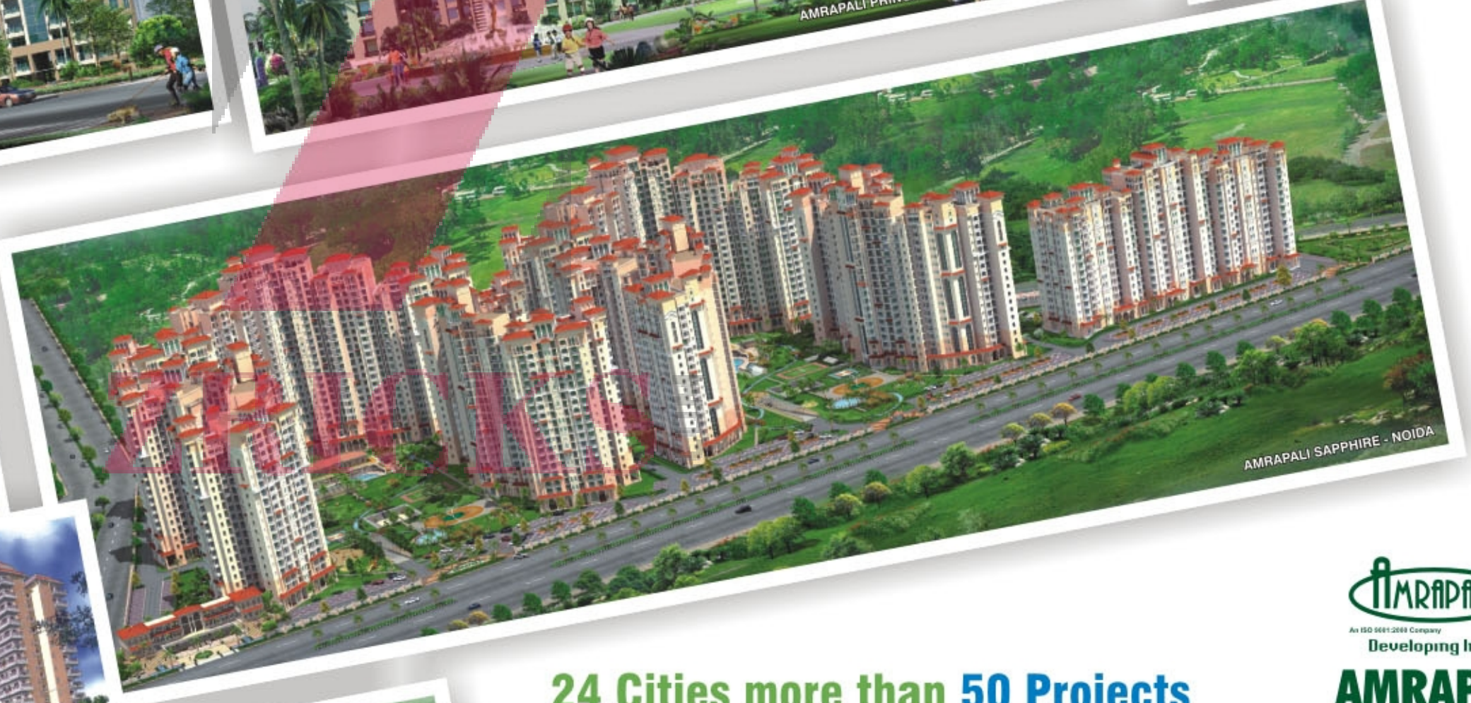
AMRAPALI SAPPHIRE - NOIDA