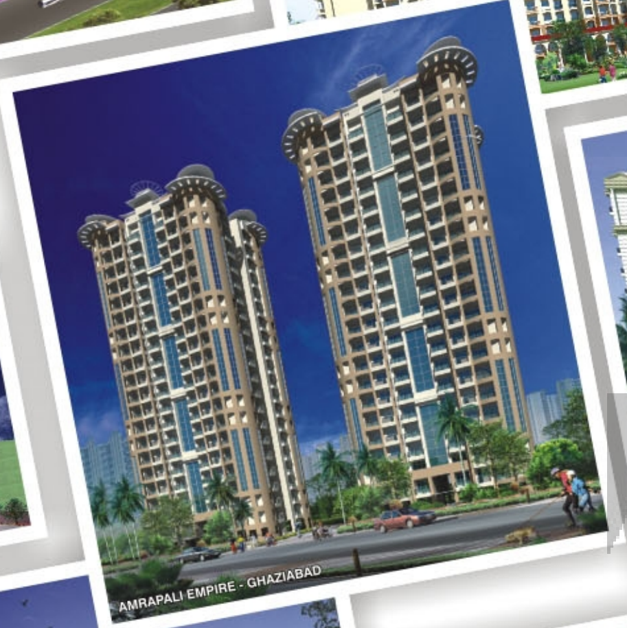
AMRAPALI EMPIRE - GHAZIABAD