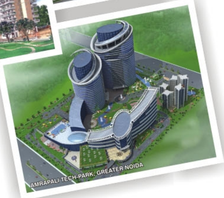
AMRAPALI TECH-PARK, GREATER NOIDA