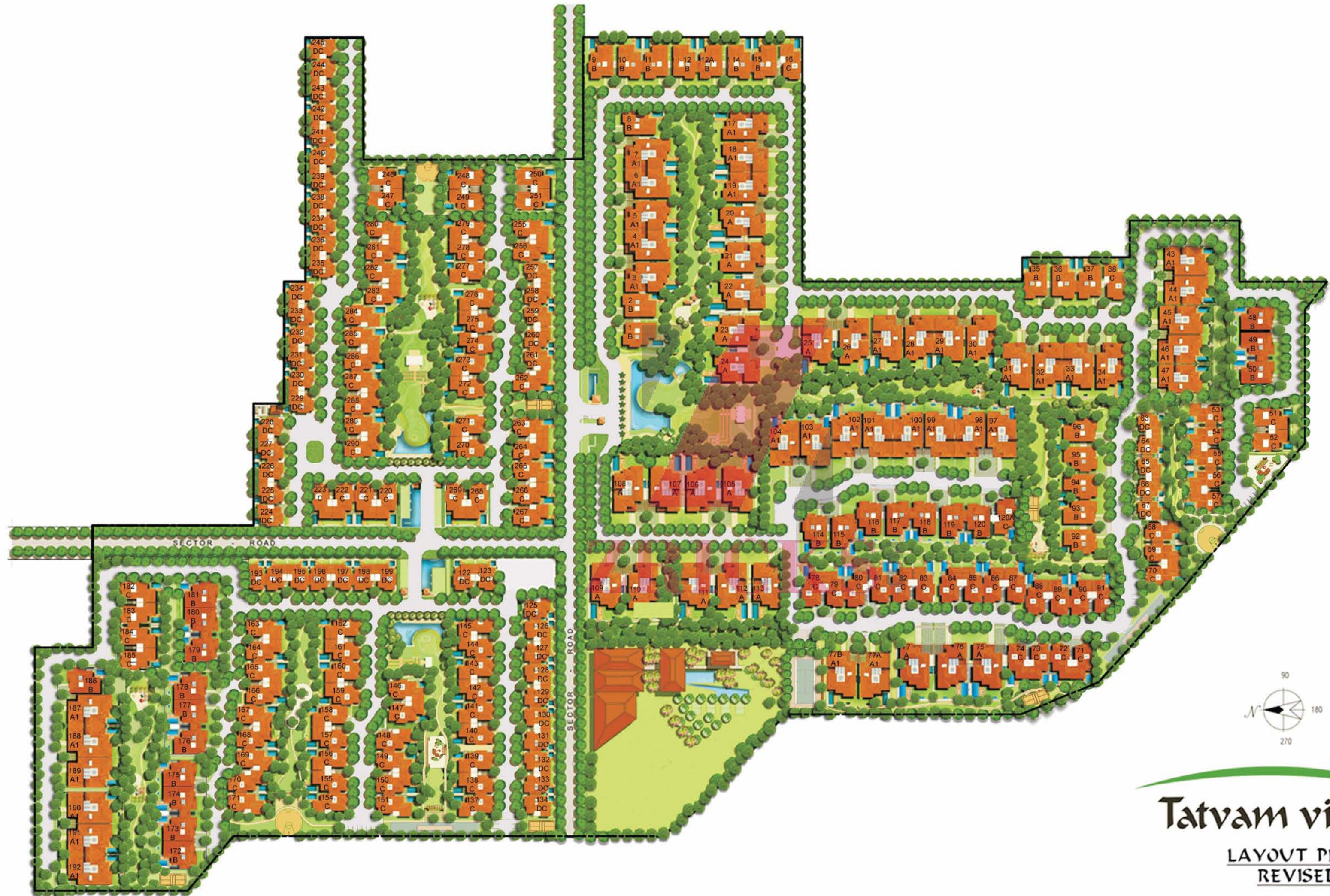
Tatvam villas LAYOUT PLAN REVISED