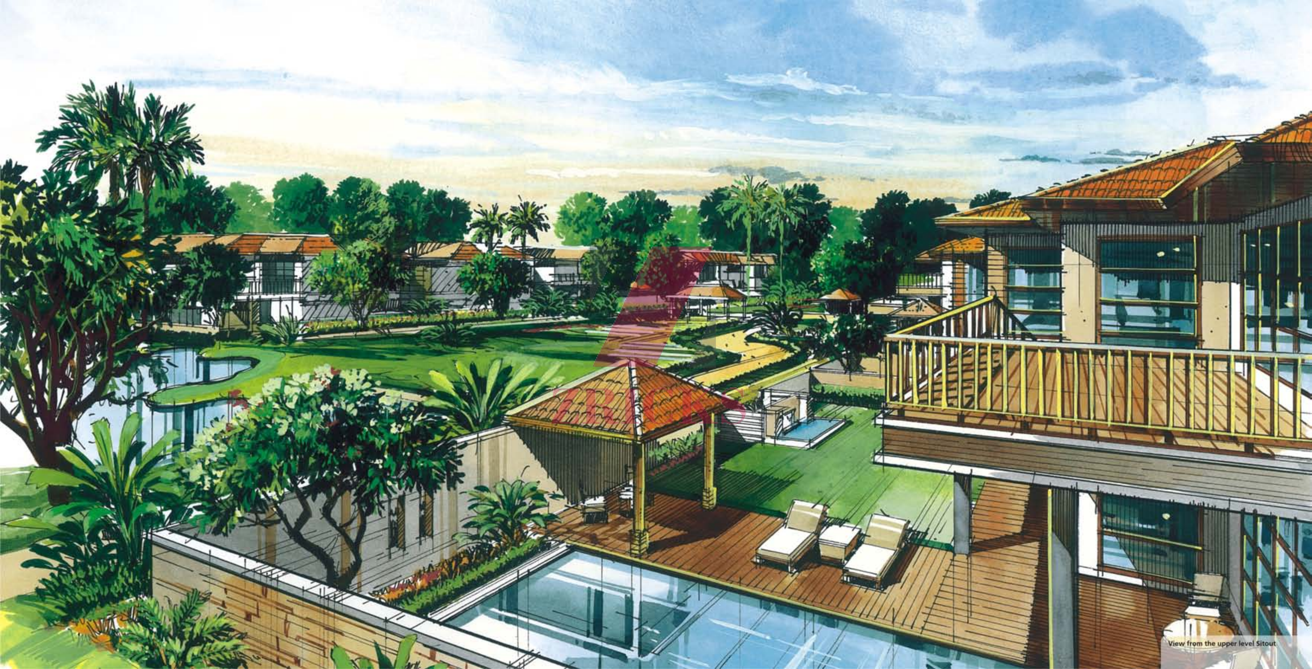
View from the upper level Sitout