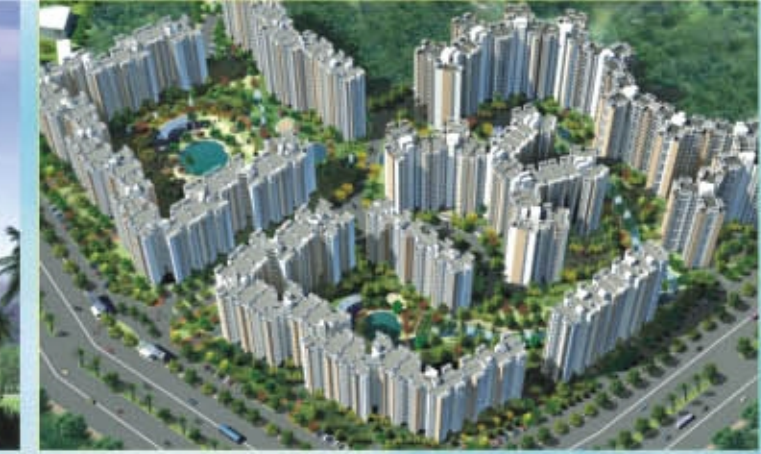
Amrapali Smart City-Noida Extn