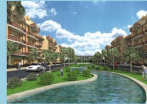
Amrapali Tech-Park, Greater Noida