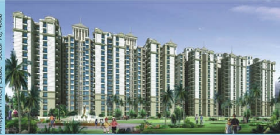
Amrapali Princely Estate - Sector 76, Noida

Contemporary techniques, persistent practices and exemplary execution