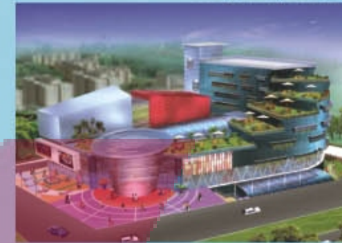
Amrapali IMT Manesar, Gurgaon