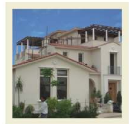
The Palm Springs, Gurgaon

Colliers International operates from over 257 offices in 57 Countries. With some of the most experienced and savvy project managers in the Country, Colliers will try to ensure that the project is built before schedule and with the highest quality of construction.