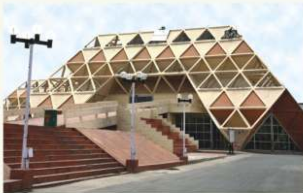
The Hall of Nations and Industries in Pragati Maidan, New Delhi