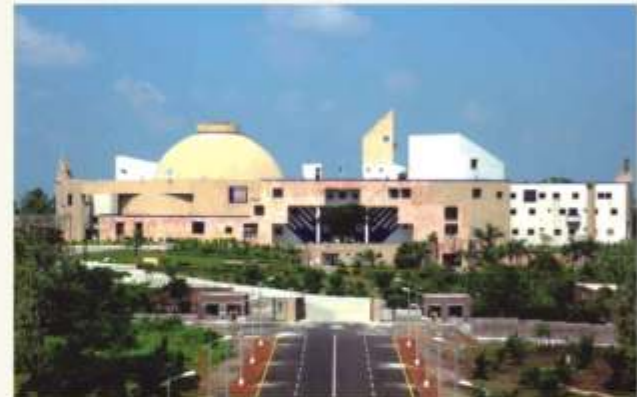
Vidhan Sabha Bhawan, Bhopal