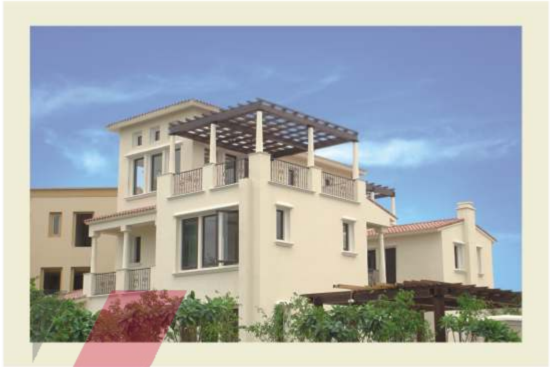
The Palm Springs, Gurgaon