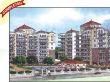
Amrapali Exotica, Noida