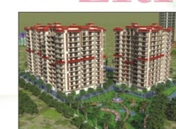
Nirala Eden Park II, Indirapuram