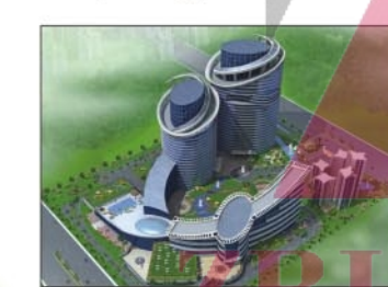
Amrapali Tech-Park, Greater Noida