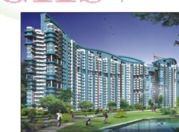
Amrapali Platinum, Noida