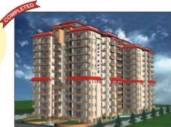
Nirala Eden Park I, Indirapuram