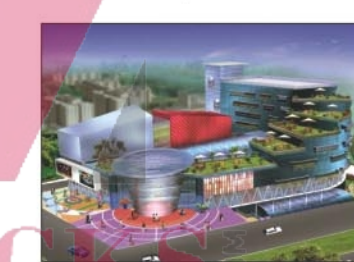
Amrapali Mall, Vrindavan