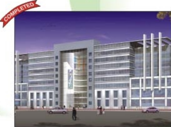
Amrapali IMT Manesar, Gurgaon