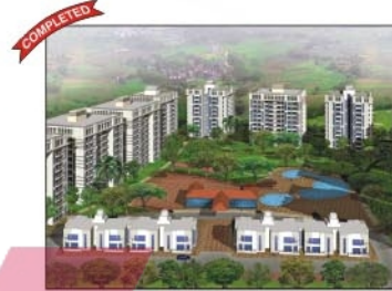
Amrapali Grand, Greater Noida