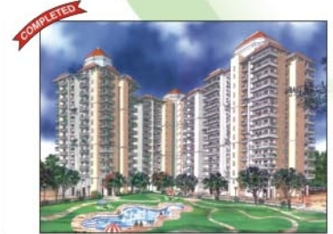
Amrapali Royal, Indirapuram