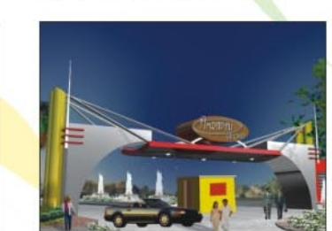
Amrapali Modern City, Indore