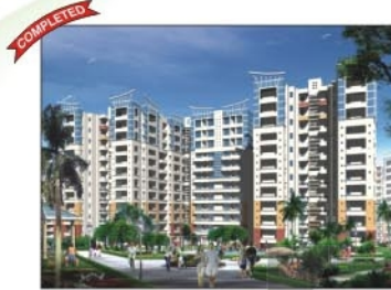
Amrapali Village, Indirapuram