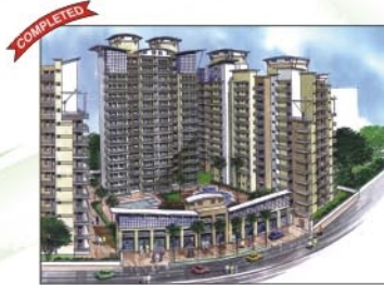
Amrapali Green, Indirapuram