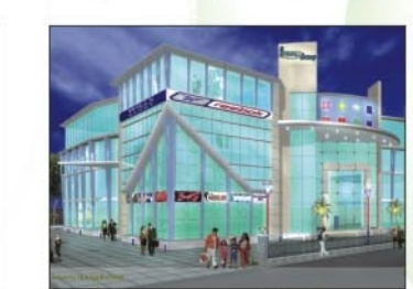
Amrapali Mall, Bareilly