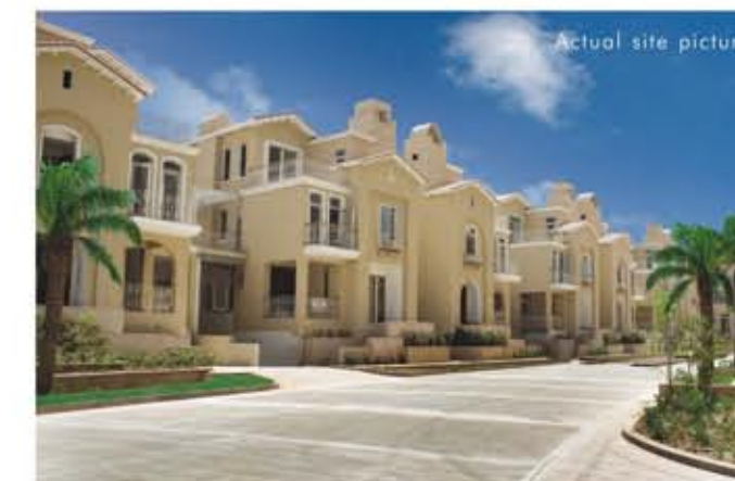
The Palm Springs, Gurgaon