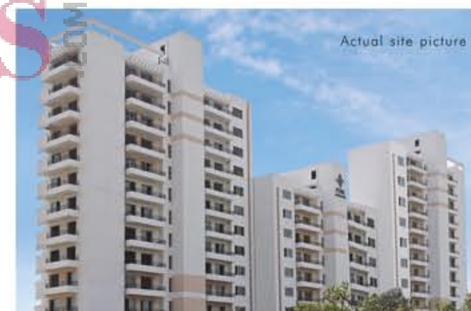
The Pranayam, Faridabad