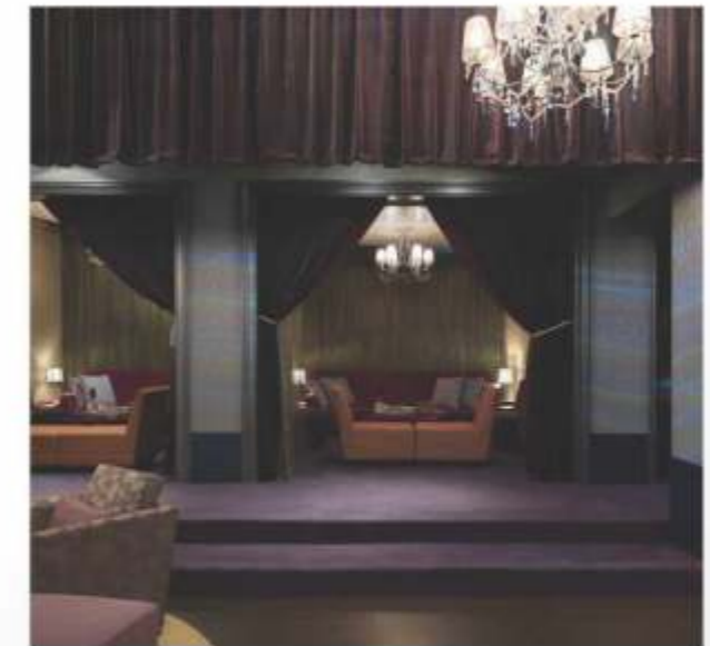
// CIGAR LOUNGE