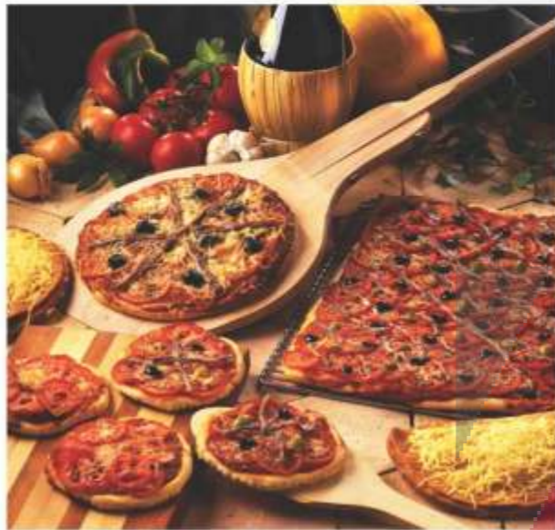
// PIZZA CORNER