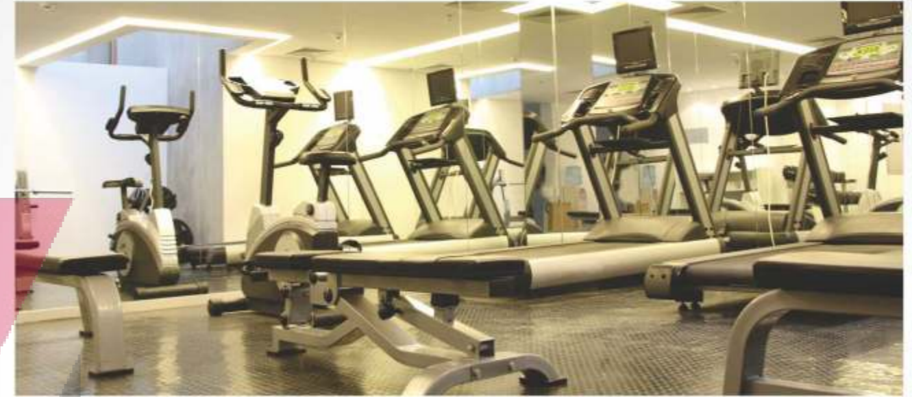
// INTERNATIONAL FITNESS CENTRE