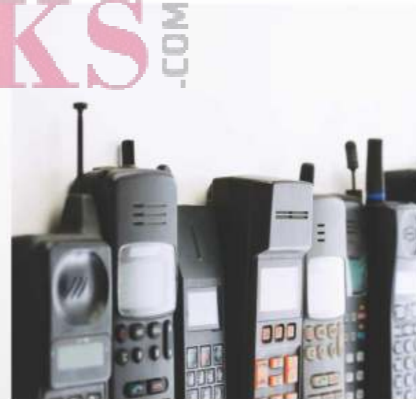
// MOBILE STORE