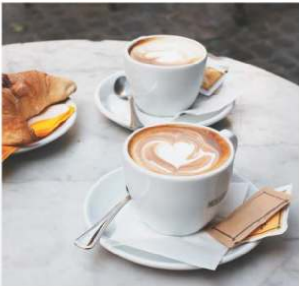
// FOOD N BEVERAGES