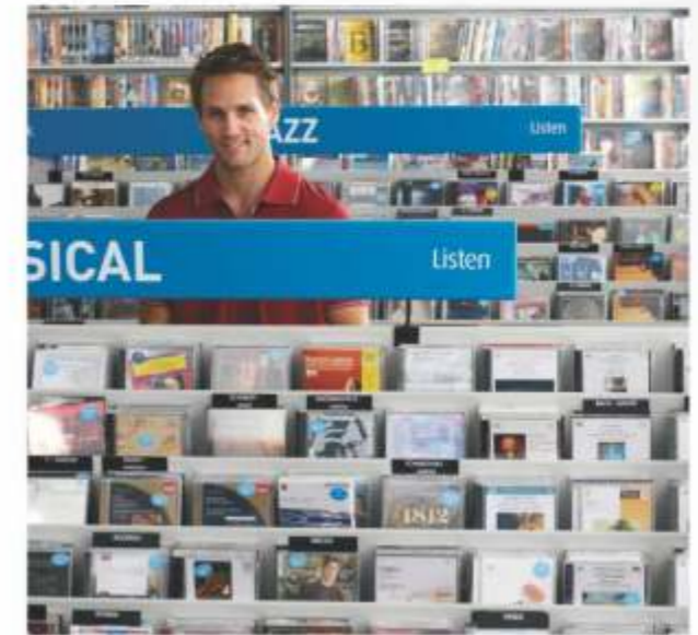
// MUSIC STORE