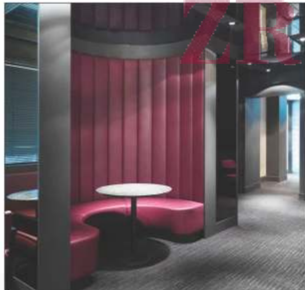
// PARTY AREA