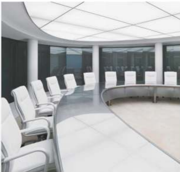
// CONFERENCE ROOM