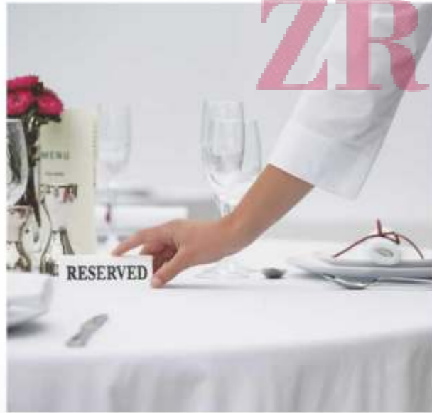
// RESTAURANT RESERVATION