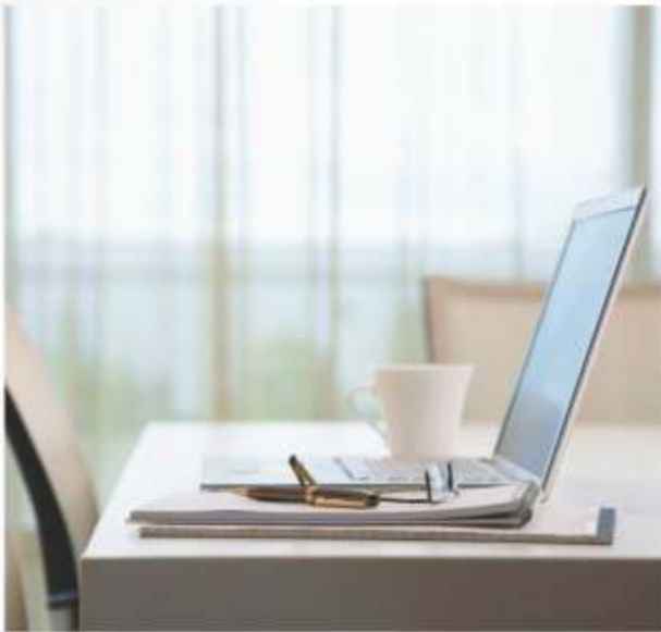
// WI-FI CONNECTIVITY