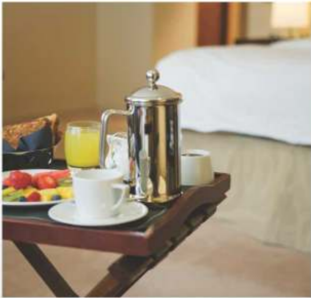
// FOOD ON CALL