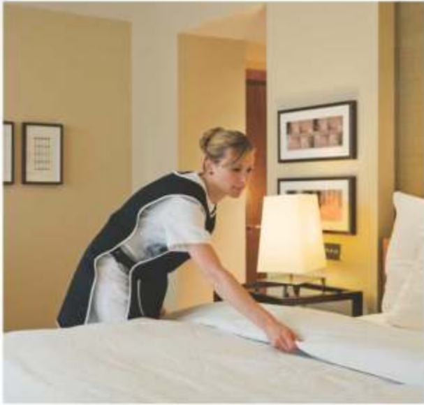
// HOUSE KEEPING