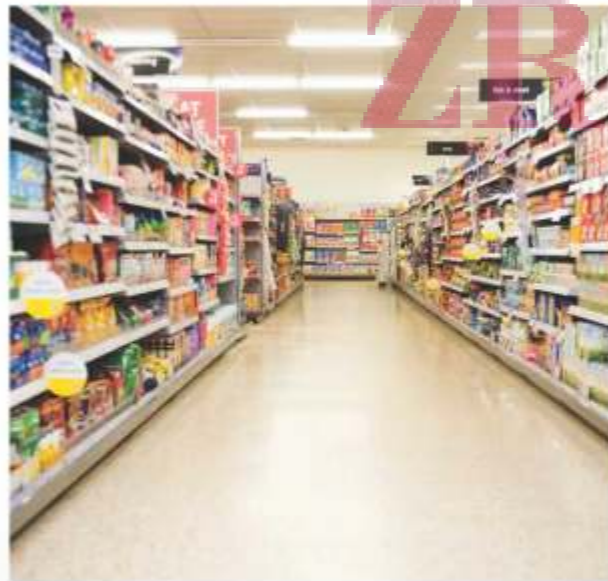
// CONVENIENCE STORES