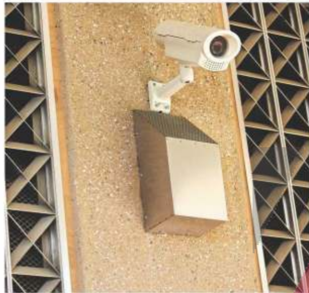
// ADVANCED SECURITY SYSTEM