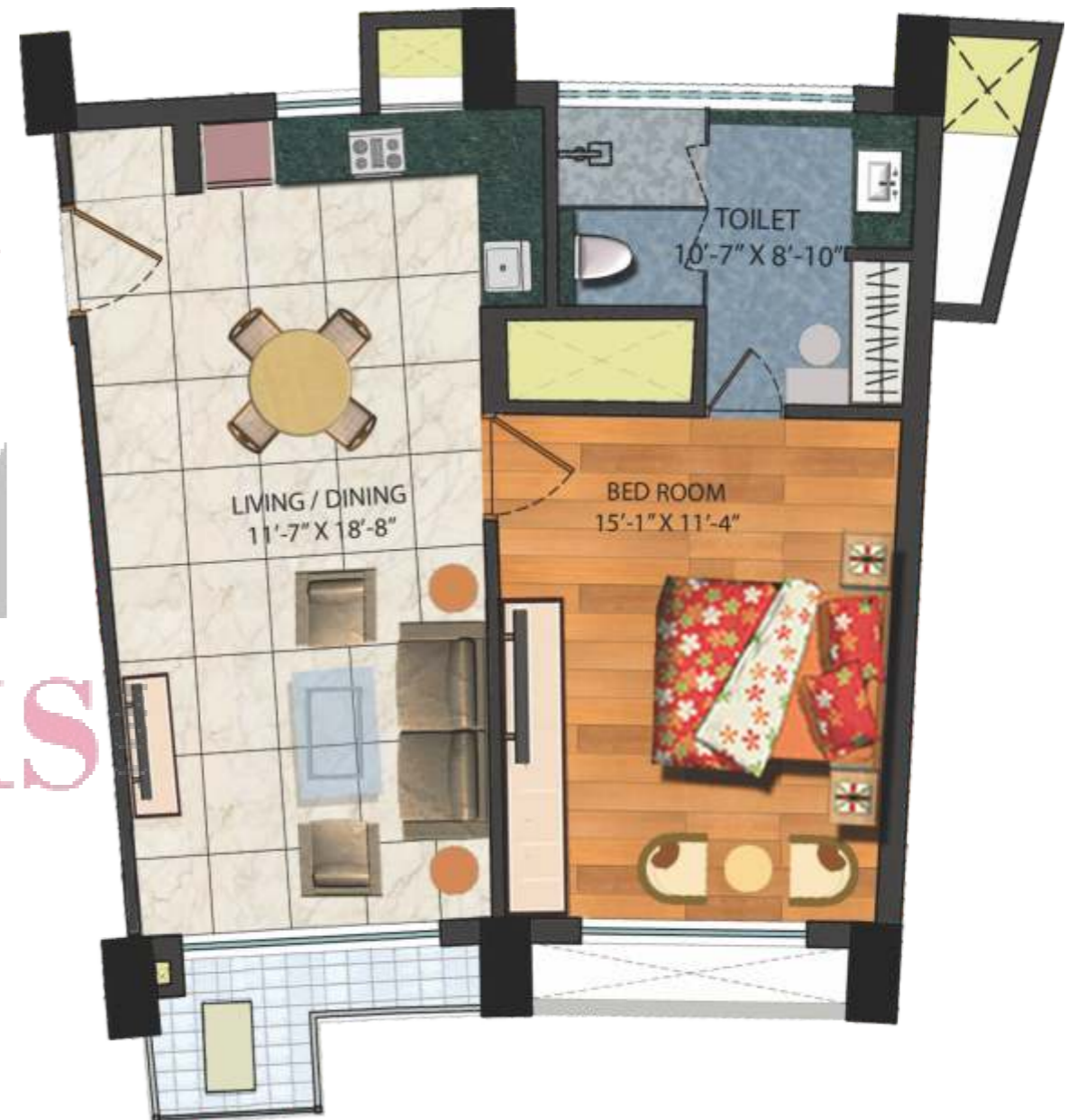
1 Bedroom (Large) Apartment

Note: All above features and layouts are tentative and are subject to change without any prior notice. These are purely conceptual and constitute no legal offering. Balconies are subject to change as per elevation drawings. 1 sq.mtr.=10,763 sq.ft (approx)