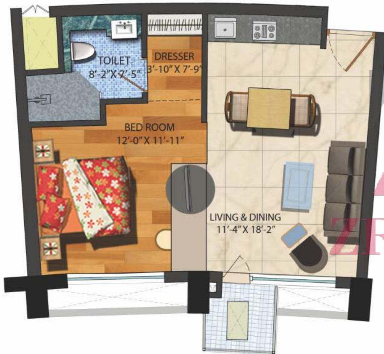
1 Bedroom Apartment

Typical Unit Plan (Super Area : 820 Sq. ft.)