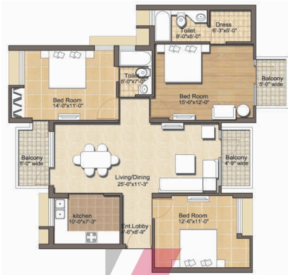
UNIT PLAN TYPE : 1600 sq. ft.

* This is tentative plan subject to approval from the concerned authority