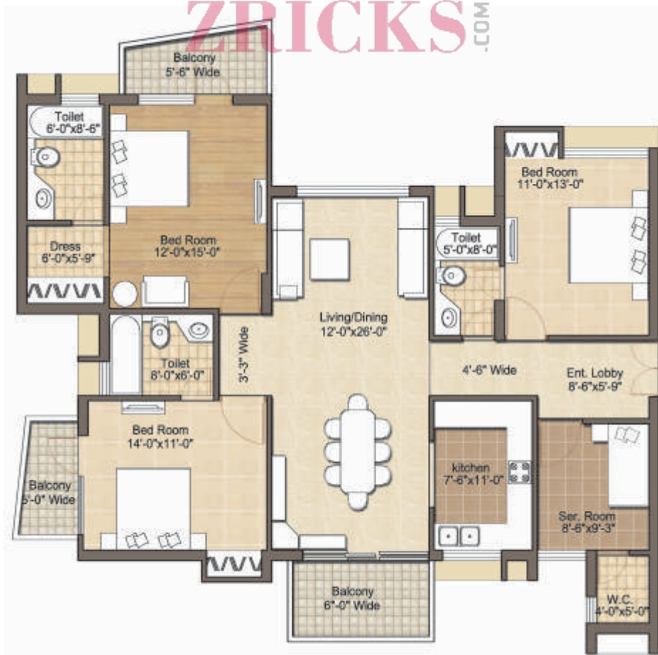
UNIT PLAN TYPE : 1922 sq. ft.

* This is tentative plan subject to approval from the concerned authority