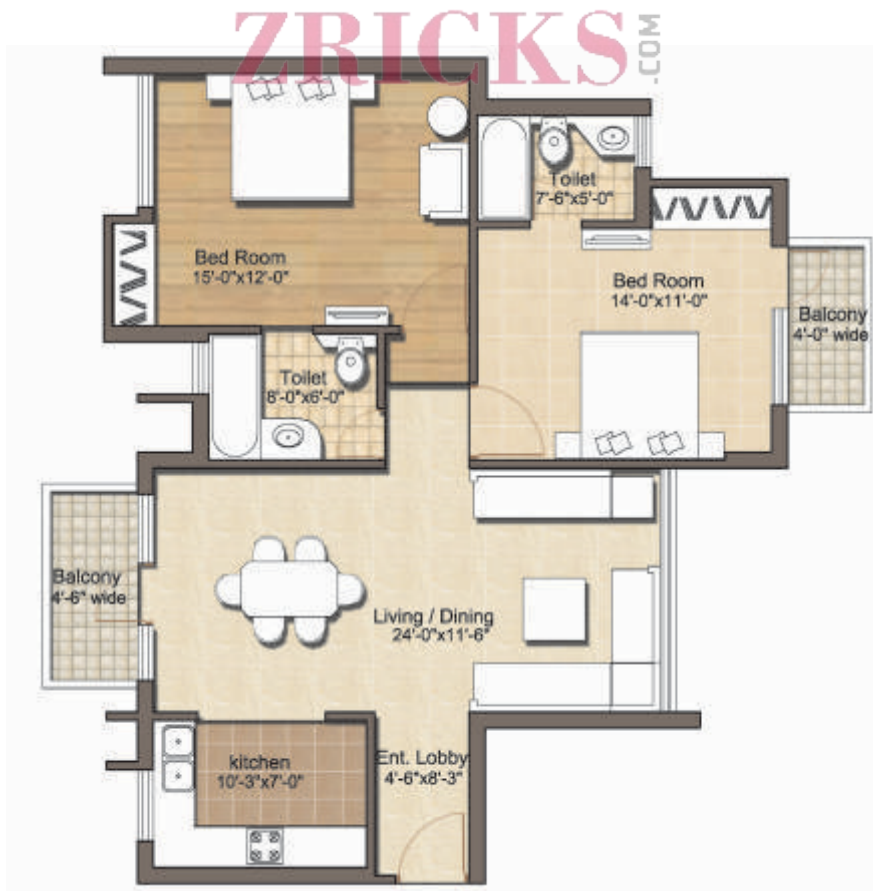
UNIT PLAN TYPE : 1330 sq. ft.