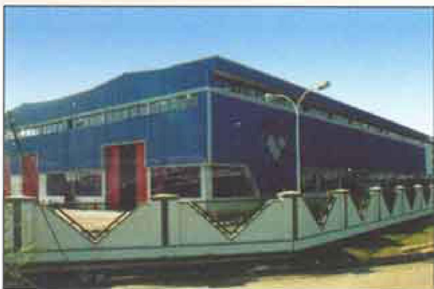
Mfg. Plant, at Gurgaon for Swedala Industri India Pvt. Ltd.