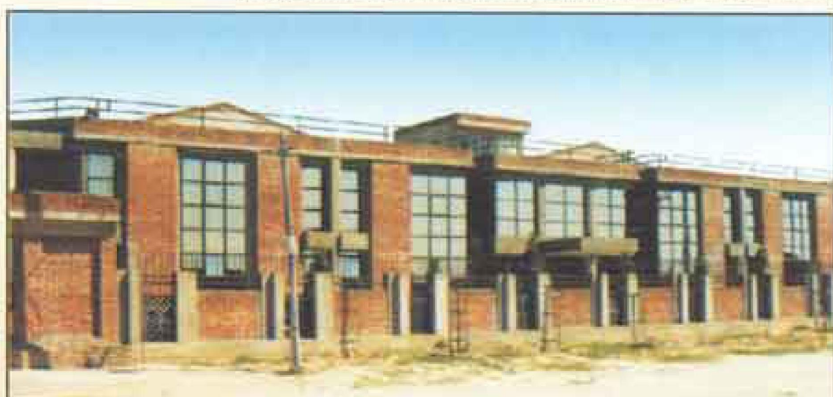
Switch Gear mfg. Unit, at Noida for Indo Asian Switch Gear