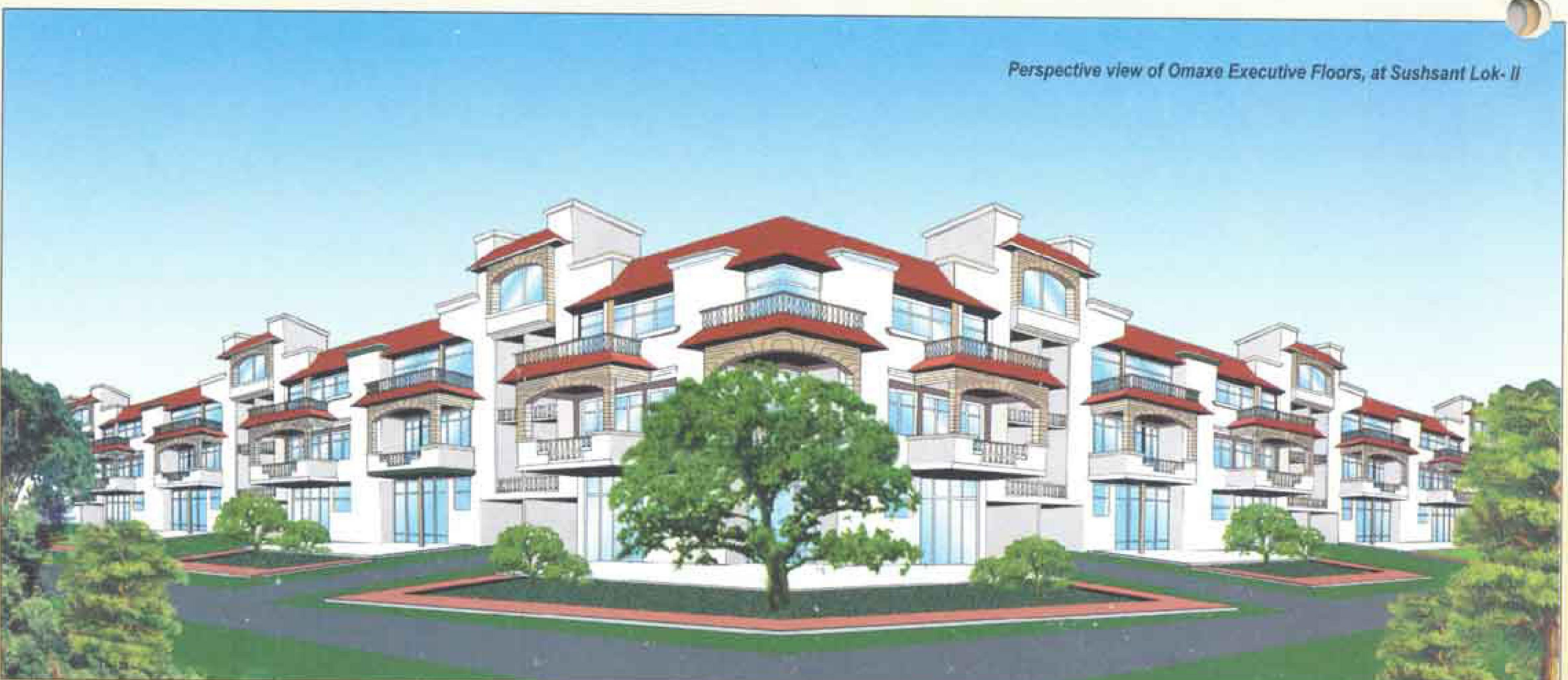
Perspective view of Omaxe Executive Floors, at Sushant Lok-II