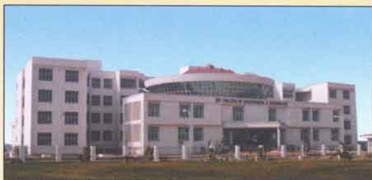
IEC College of Engineering & Technology, at Gr. Noida for IEC Software Ltd.