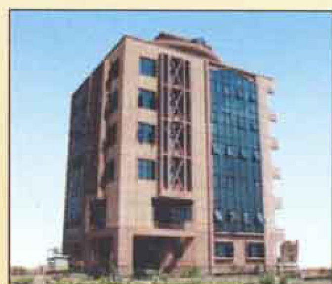
BSES Tower, at Noida for BSES Ltd.