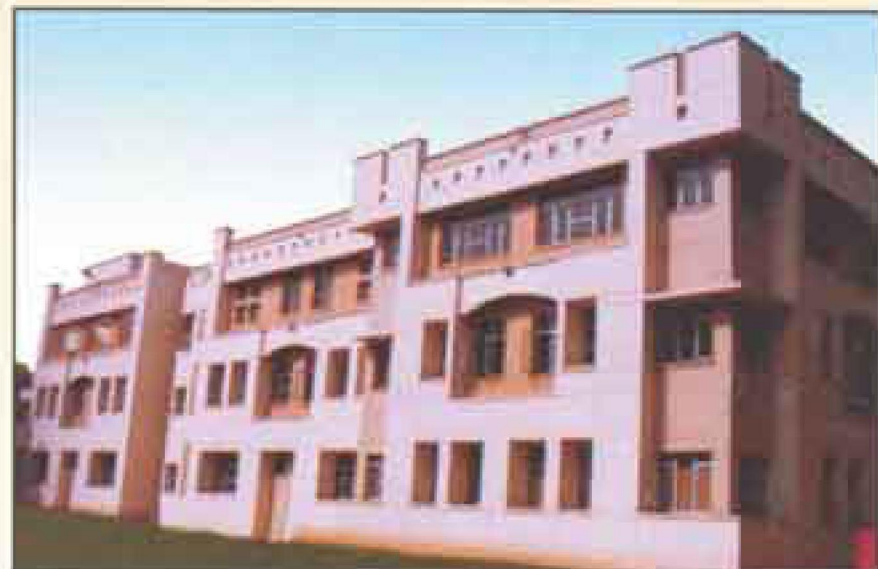
Starex International School, at Manesar, Haryana