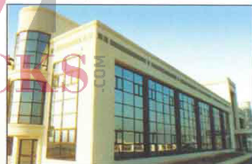
Refrigerator mfg. Plant, at Manesar for Norcool India Pvt. Ltd.