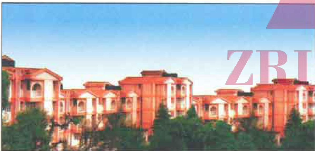
Residential complex, at Kullu (H.P.) For Malana Power Co. Ltd.