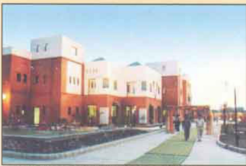
Automotive component mfg. Plant, at Noida for Uniparts India Ltd.