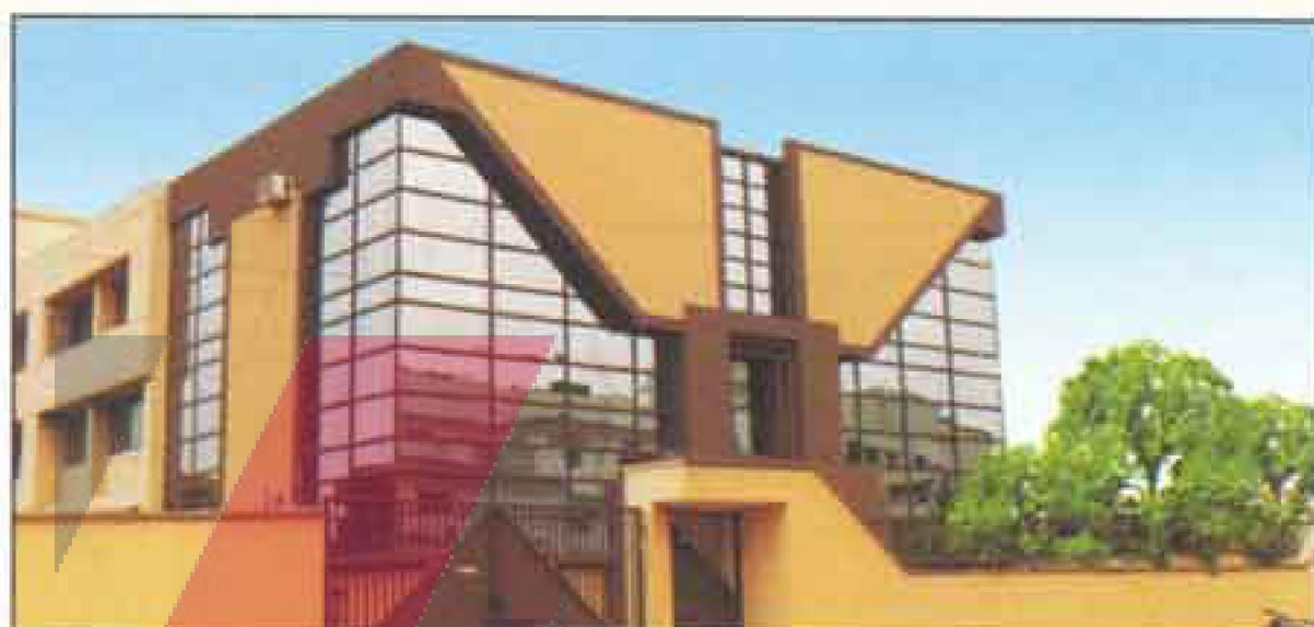
Corporate Office, at Delhi for Sunehari Exports