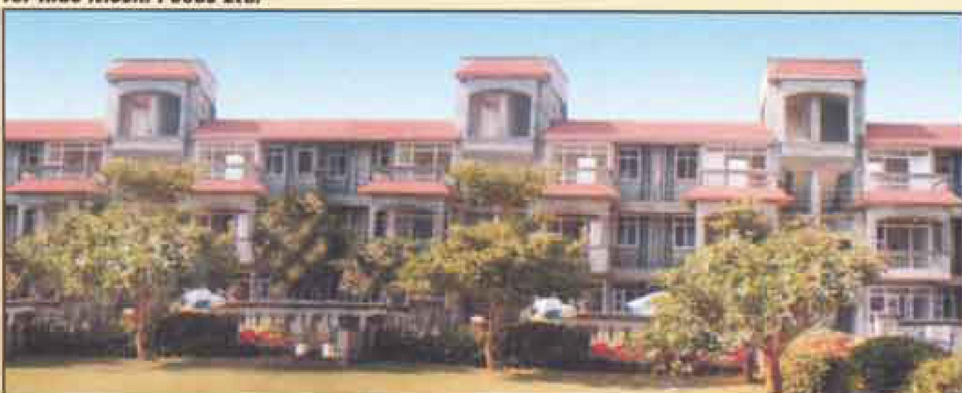
Olive Apartments, at Sushant Lok- II