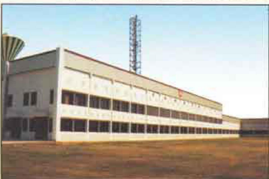
Noodles Plant on N.H. 8, Delhi- Jaipur Highway, for Indo-Nissin Foods Ltd.